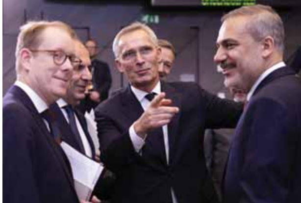
NATO Secretary General Jens Stoltenberg, centre, speaks with Sweden’s Foreign Minister Tobias Billstrom, left, and Turkey’s Foreign Minister Hakan Fidan, right, during a meeting of NATO foreign ministers in North Atlantic Council session at NATO headquarters in Brussels, on Tuesday

“It is doable,” he said. “We can do it if we are calm but