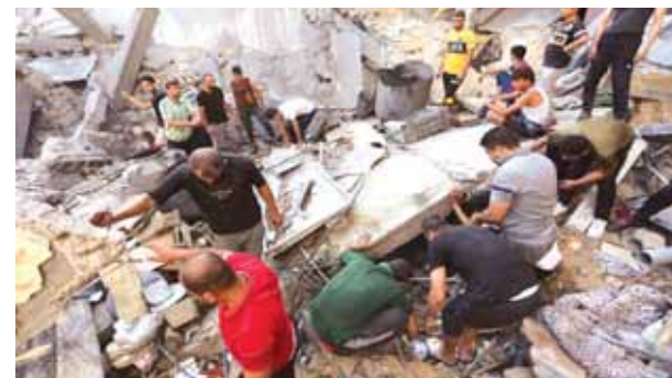
Palestinians look for survivors after an Israeli strike in Rafah in Gaza Strip on Tuesday

The head of the UN agency for Palestinian refugees has told a UN emergency meeting that "an immediate humanitarian ceasefire has become a matter of life and death for millions," accusing Israel of "collective punishment" of Palestinians and the forced displacement of civilians. Philippe Lazzarini warned that a further breakdown of civil order following the looting of the agency's warehouses by Palestinians searching for food and other aid "will make it extremely difficult, if not impossible, for the largest UN agency in Gaza to continue operating."