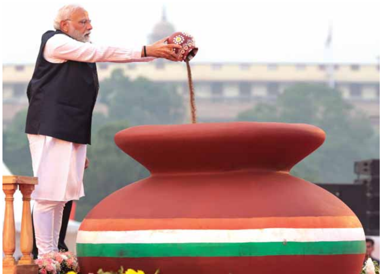
Prime Minister Narendra Modi during an event marking the culmination of the 'Meri Maati Mera Desh' campaign, in New Delhi on Tuesday

Modi emphasised that the politics of appeasement poses the biggest obstacle to the country's development journey, and he warned about "a very large political class" that seems unable to engage in positive politics, often compromising the country's unity for their own selfish goals.