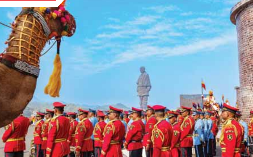
BSF personnel during 'Rashtriya Ekta Diwas' celebrations on Sardar Vallabhbhai Patel's birth anniversary, in Kevadia