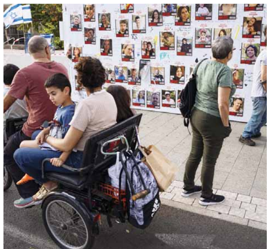
People look at photographs of hostages, mostly Israeli civilians who were abducted during the Oct. 7, unprecedented Hamas attack on Israel, in Tel Aviv, Israel Monday.

that conducts research but does not set policy — offered three alternatives "to effect a significant change in the civilian reality in the Gaza Strip in light of the Hamas crimes that led to the Sword of Iron war."