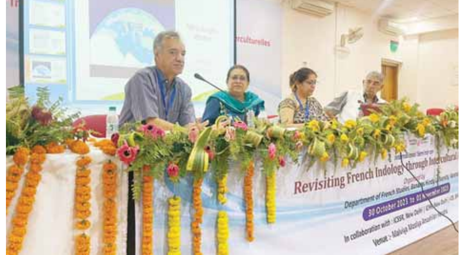
Concluding day function of seminar on French indology being held at BHU in Varanasi on Wednesday.

The three-day international seminar on 'Revisiting French Indology through Intercultural Approaches' concluded at the Malviya Mulya Anushilan Kendra, Banaras Hindu University (BHU) here on Wednesday. The seminar aimed to pay homage to the French resistance fighter and writer, Satprem, on his centenary day. Satprem, disenchanted and deeply broken in soul and body by the Second World War, left France and came to live near Sri Aurobindo and the Mother in India.