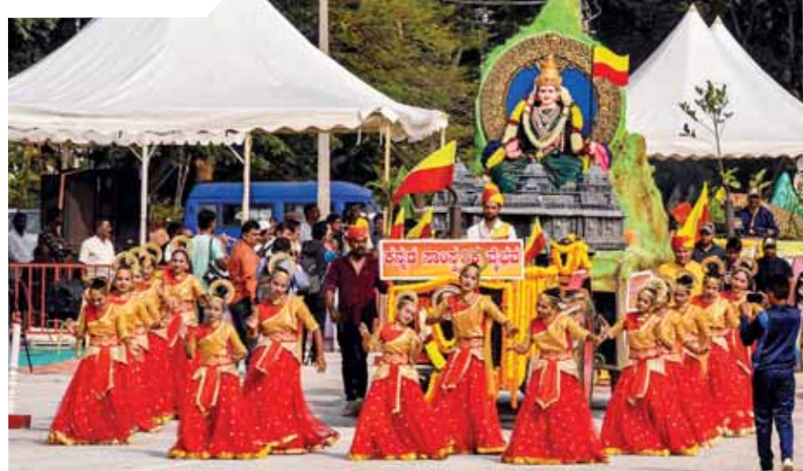
Karnataka tableau artists participate in a procession during 'Karnataka Rajyotsava', in Chikmagalur