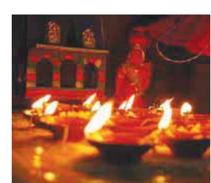
South Asian dance community. Celebrating the magic of Diwali in 'The Most Magical Place on Earth' was truly a dream come true."