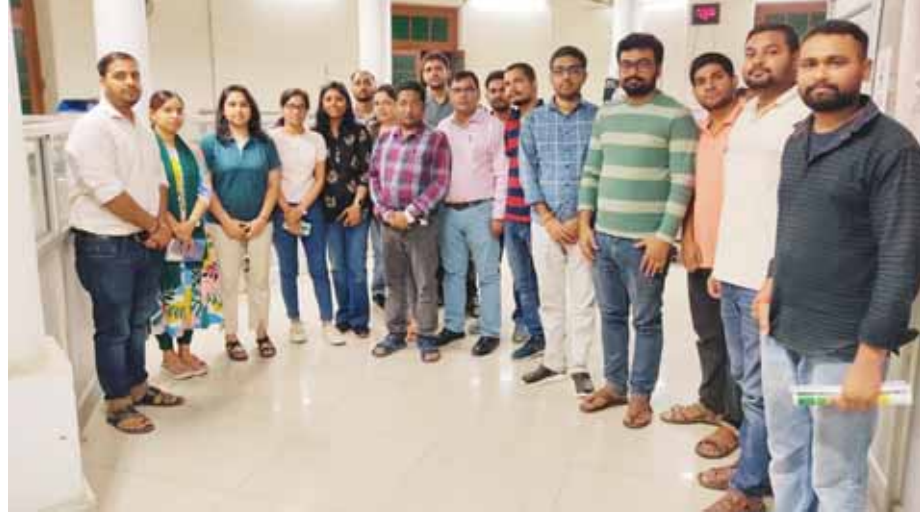
IIT (BHU) research scholars selected for PMRF in Varanasi.