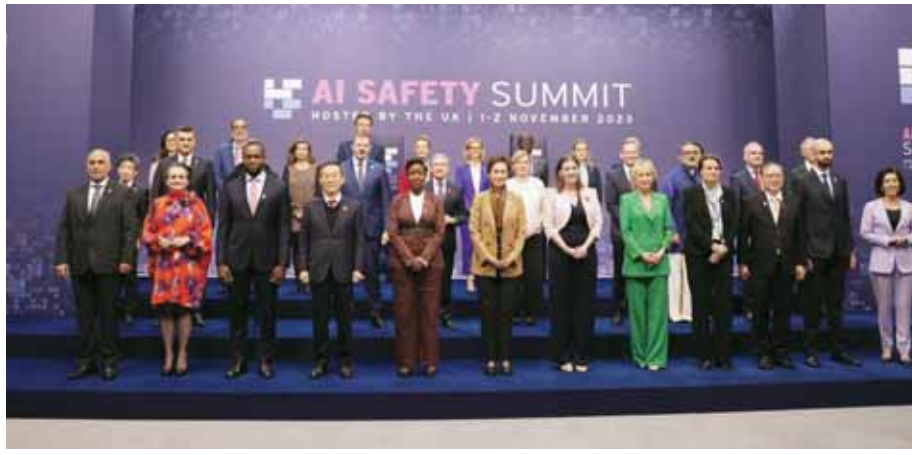
Britain's Michelle Donelan, Secretary of State for Science, Innovation and Technology, 6th right front row, with Digital Ministers who are attending the AI Safety Summit in Bletchley Park, Milton Keynes, England on Wednesday.

She's due to attend the summit on Thursday alongside government officials from more than two dozen countries including Canada, France, Germany, India, Japan, Saudi Arabia — and China, invited