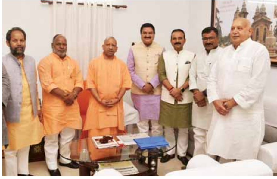
CM Yogi Adityanath holding a meeting with senior BJP leaders at Circuit House in Varanasi on Wednesday.

Chief Minister (CM) Yogi Adityanath discussed poll strategy with the senior Bharatiya Janata Party (BJP) on the second day of his visit at Circuit House here on Wednesday morning. He also tried to know about the party preparations for the 2024 Lok Sabha election in which the development work of the central and state government would play an important role. Apart from discussing development work with party workers, Yogi also inquired about the well-being of the people.