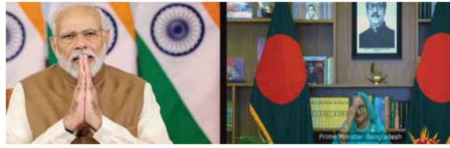
Prime Minister Narendra Modi with Bangladesh Prime Minister Sheikh Hasina during a joint inauguration of three India-assisted development projects via a video conference on Wednesday

Prime Minister Narendra Modi and his Bangladeshi counterpart Sheikh Hasina on Wednesday jointly inaugurated three India assisted projects via virtual mode. These include a key rail link between Tripura's Nischintapur and Gangasagar in the neighbouring country. Modi described the rail link a "historic moment". The other two projects inaugurated by Modi and Hasina are the 65 km Khulna-Mongla Port Rail Line, and Unit 2 of the Maitree Super Thermal Power Plant in Bangladesh's Rampal. Modi said inauguration of the India-Bangladesh rail project — the Agartala-Akhaura Cross Border Rail Link — was a "historic" moment. "This is the first rail link between the northeast and Bangladesh," he said. The 12.24 km rail project (6.78 km dual gauge line in Bangladesh and 5.46 km in Tripura) between Nischintapur and Gangasagar is expected to boost cross-border trade and significantly reduce the travel time between Agartala and Kolkata via Dhaka. The trial run of the rail project was completed on Monday, after a train from Gangasagar railway station in Brahmanbaria district of