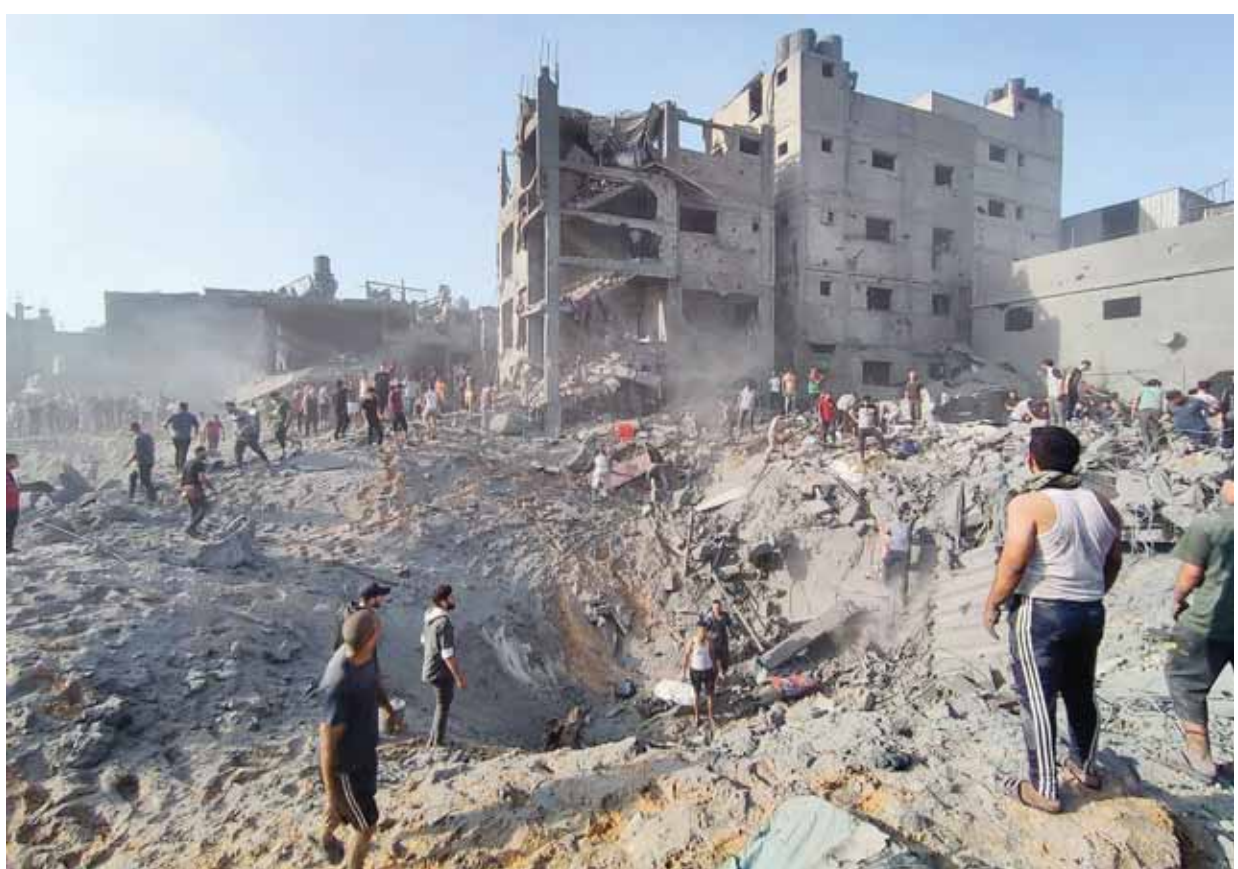
Palestinians inspect the damage of buildings destroyed by Israeli airstrikes on Jabaliya refugee camp on the outskirts of Gaza City

Even as bombings have driven tens of thousands from their homes and food, water and fuel run low, no one has been allowed to leave the embattled enclave, except for four Israeli hostages released by Hamas. Another captive was rescued by Israeli forces earlier this week. But a limited agreement appeared to have been reached on Wednesday. Communications and internet services were gradually being restored after the second major cut in five days, according to Paltel, the main service provider. Humanitarian aid agencies have warned that such blackouts severely disrupt their work in an already dire situation in Gaza. The Palestinian death toll in the Israel-Hamas war has reached 8,525. More than 1,400 people in Israel have been killed, most of them civilians slain in the initial October 7 Hamas rampage that started the fighting. In addition, around 240 hostages were taken from Israel into Gaza by the militant group. One of the captives, a female Israeli soldier, was rescued in a special forces operation. In a sign of increasing alarm over the war among Arab countries, Jordan on Wednesday recalled its ambassador from Israel and told Israel's ambassador to remain out of the country. Jordan, a key US ally, signed a peace deal with Israel in 1994, the second Arab country after Egypt to do so.