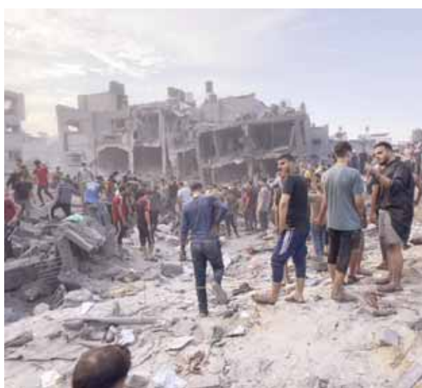
In this frame grab from video, Palestinians stand and others search for survivors and bodies following Israeli airstrikes at the Jabalyia refugee camp on Gaza City's A6s outskirts on Tuesday.

Another media freedom organization, the Committee to Protect Journalists, said Wednesday that it was investigating reports of journalists killed, injured, detained or missing in the war, including in Lebanon.