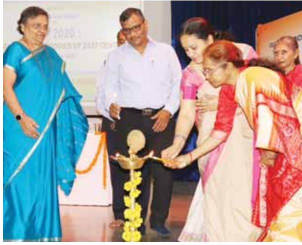
National seminar on NEP-2020 being inaugurated at Vasanta College, Rajghat in Varanasi on Friday.