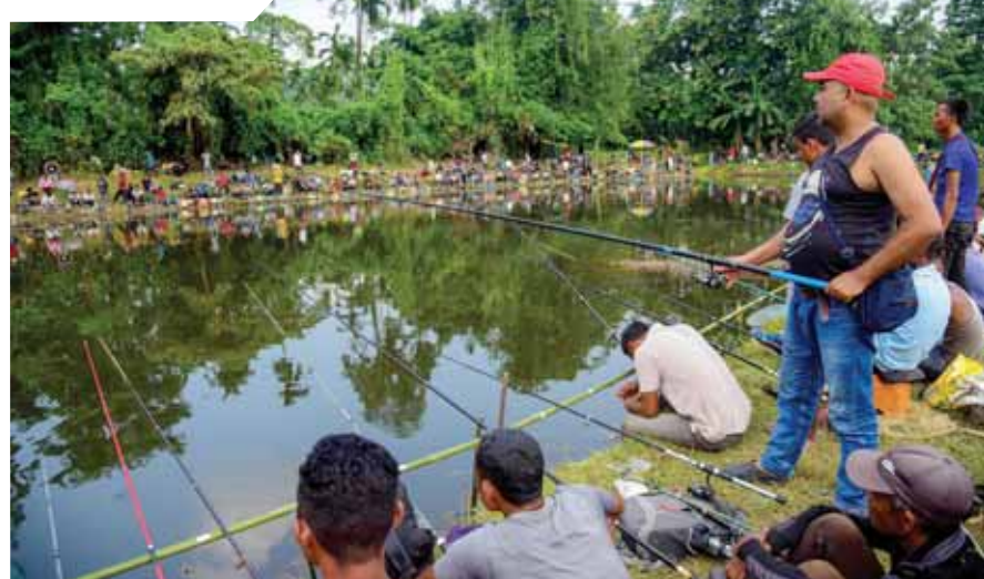
People from Assam and Meghalaya take part in a fishing competition, in Kamrup