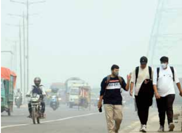
Commuters don masks as the air pollution level in Delhi soared to an unprecedented level on Friday

Given the gravity of the problem, Lt Governor VK Saxena, who held a high-level meeting with Delhi Environment Minister Gopal Rai, said the situation in the city is "extreme-