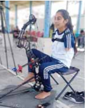
In her opening remarks, Sheetal Devi said, when I recently met

Archery Championship in Bangkok from November 15. Without taking any break, Sheetal on Friday arrived at her 'Karaboomi' in Katra and started training in the company of fellow archers at the Archery range of the Shrine Board Sports complex. In the last couple of days, Sheetal Devi attended a series of felicitation ceremonies including a meeting with Prime Minister Narendra Modi in New Delhi. On Friday this correspondent met her during her maiden practice session in Katra.