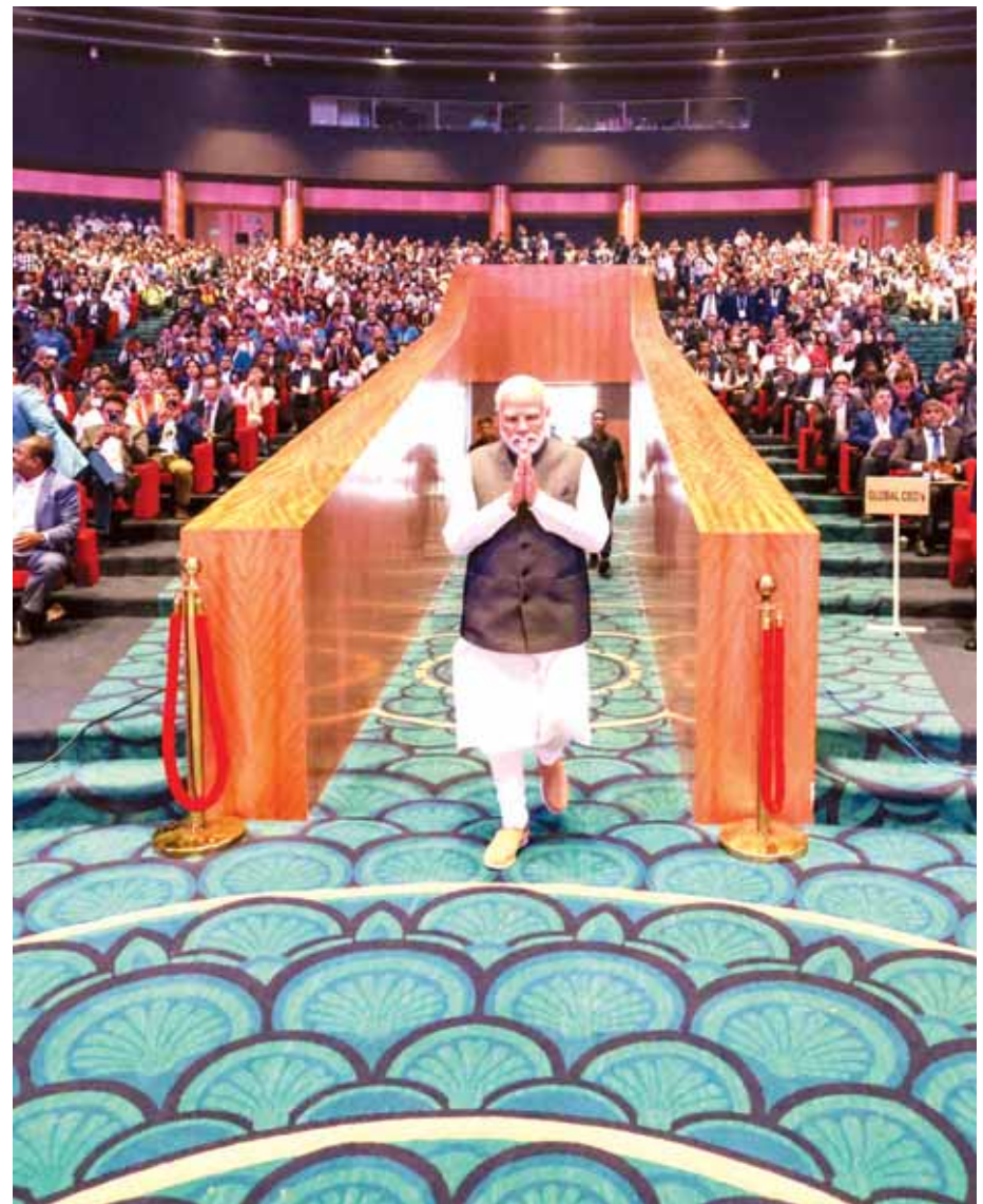
Prime Minister Narendra Modi addresses at the inauguration of the World Food India 2023 event at Bharat Mandapam in New Delhi on Friday. India's sunrise food processing sector has attracted ₹50,000 crore FDI in the last nine years, Prime Minister Modi said, as he stressed on reducing post-harvest losses and food wastage. He also said India's food processing capacity has witnessed significant growth in the last nine years leading to 150 per cent growth in exports of processed food. The capacity of the food processing sector too has increased from a meagre 12 lakh tonne to over 200 lakh tonne. More than 80 countries, 200 speakers and 12 partner ministries, departments and commodity boards are scheduled to take part in the second edition of World Food India

See P4: Air pollution threat to kids academic life