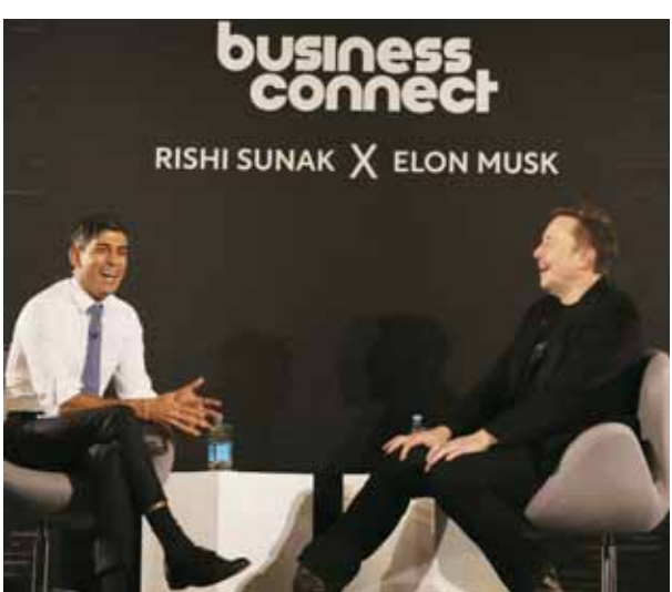
Britain's Prime Minister Rishi Sunak, left, attends an in-conversation event with Tesla and SpaceX's CEO Elon Musk in London on Thursday.

In a much-hyped conversation between Prime Minister Rishi Sunak and Tesla CEO Elon Musk at the conclusion of the AI Safety Summit hosted by the UK government, the duo discussed a range of issues from job threats posed by artificial intelligence to how AI-enabled robots could make good "friends" in the future. In a recording of his discussion at Lancaster House in London on Thursday evening shared on X, Sunak is seen playing chat show host as he throws questions at the tech billionaire about the risks associated with the fast-developing and "transformative" new technology. Musk, the world's richest man, described AI as "a magic genie" that could grant limitless wishes and agreed with the need for a "referee" to monitor the development of supercomputers of the future. "We are seeing the most