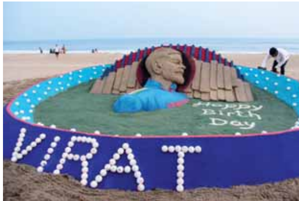
Sand artist Sudarsan Pattnaik creates a sand sculpture on the eve of Indian cricketer Virat Kohli's birthday, in Puri, on Saturday

Post-match, Gambhir called up Kohli and handed his player of the match cheque to the young player as a mark of encouragement from a senior player. Who knows the world record equalling 49th hundred might just happen at the same venue where it all started. There won't be 70,000 'Kohli