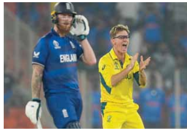
Australia's bowler Adam Zampa celebrates the wicket of England's batter Jos Buttler during the ICC Men's Cricket World Cup 2023 match between Australia and England at Narendra Modi Stadium in Ahmedabad on Saturday

Adam Zampa produced three timely strikes in the middle overs as Australia knocked out defending champions England out of the ODI World Cup with a 33-run win here on Saturday, their fifth consecutive victory. Australian batters were guilty of not converting starts but still managed to post 286 against arch-rivals England. Marnus Labuschagne (71 off 83) recorded his highest score of the tournament. England, whose formidable batting lineup has massively underperformed in their title defence, had a good opportunity to pick up a win after four consecutive losses. Amid heavy dew, Ben Stokes (64 off 90) kept the chase alive while batting alongside Dawid Malan (50 off 64) and Moeen Ali (42 off 43) before Zampa landed the killer blows to stop England at 253 in 48.1 overs. Chris Woakes (32 off 33) tried his best towards the end but it was not enough. Zampa first had out-of-form England skipper Jos Buttler (1) caught in the deep before getting rid of Stokes in a soft dismissal. It was a short ball on the leg side and Stokes ended up offering a simple catch to Stoinis at short-fine leg. It was all over for England when Moeen's slog sweep off