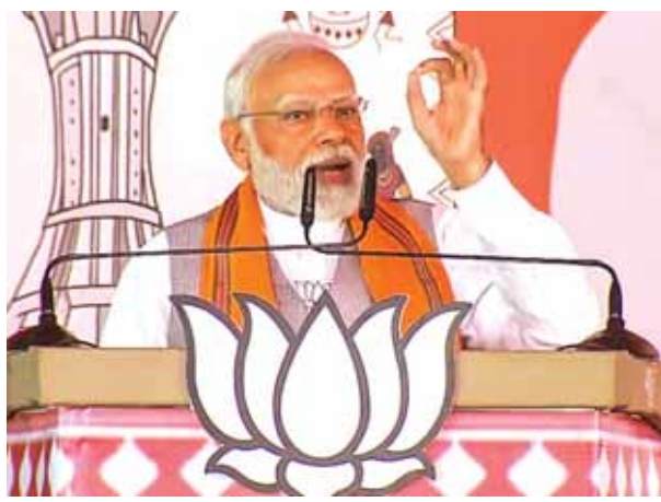
Prime Minister Narendra Modi addresses a public meeting ahead of Chhattisgarh Assembly polls, in Durg on Saturday PTI

PTI ■ DURG Prime Minister Narendra Modi on Saturday attacked Chhattisgarh Chief Minister Bhupesh Baghel over the alleged "Mahadev" betting app scam, and said the Congress leader and the State Government should tell people what links they have with the accused who are sitting in Dubai. He also said the scams committed in Chhattisgarh under Congress rule would be investigated after the BJP Government is formed and those who looted the money of people will be sent to jail. Addressing a public meeting in Durg city of poll-bound Chhattisgarh, a day after the Enforcement Directorate (ED) claimed that a forensic analysis and a statement made by a "cash courier" have led to "startling allegations" that Mahadev betting app promoters paid about ₹508 crore to Chhattisgarh CM Baghel so far, Modi said the CM (Baghel) has become frustrated after the money was recovered. Modi also said the Government will extend for five years the free ration scheme, Pradhan Mantri Garib Kalyan Anna Yojana, covering 80 crore poor people. He accused the Congress of treating the poor as a "vote bank" and abusing him and the entire OBC community.