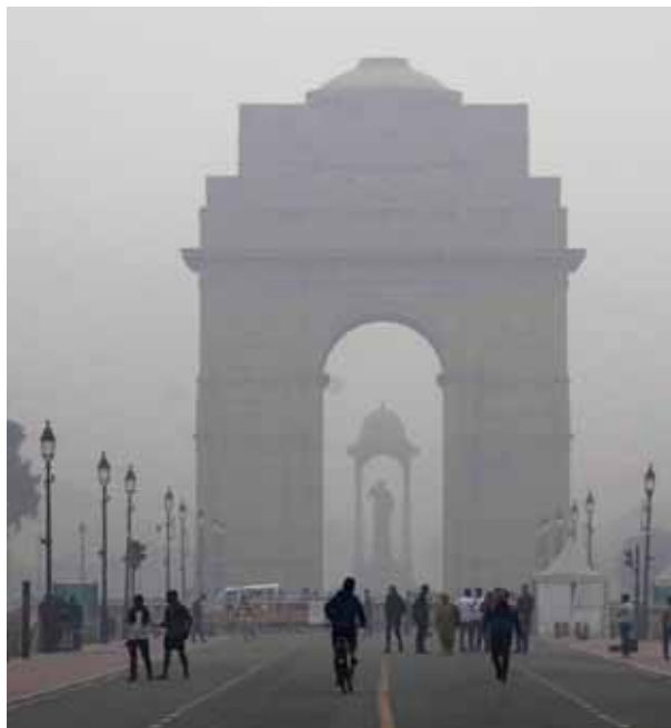
national Capital on Monday as the International Cricket Council (ICC) is currently assessing situation after the Sri Lanka team cancelled their practice session at the Arun Jaitley Stadium here on Saturday due to air pollution,

Data shows that Delhi's air quality index increased by over 200 points between October 27 and November 4. The rising pollution level and AQI is likely to cast shadow on the World Cup fixture in the