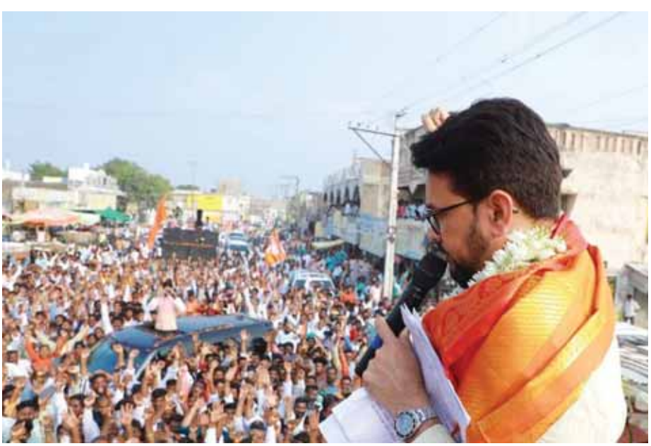
Union Information and Broadcasting Minister Anurag Thakur addresses a rally in Nalgonda district of Telangana as the State goes to poll on November 30. Thakur also conducted a door to door campaign for the BJP candidate in the Palakurthy district on Thursday

guard of honour at the airport. Rajnath and Jaishankar are also scheduled to have separate bilateral meetings with their US counterparts on the sidelines of the '2+2' dialogue that is expected to carry out a comprehensive review of fast-expanding India-US strategic ties. The defence ministry said on Thursday a number of strategic, defence and technology issues are expected to be discussed at the '2+2' dialogue and the bilateral meeting between Rajnath and Austin.