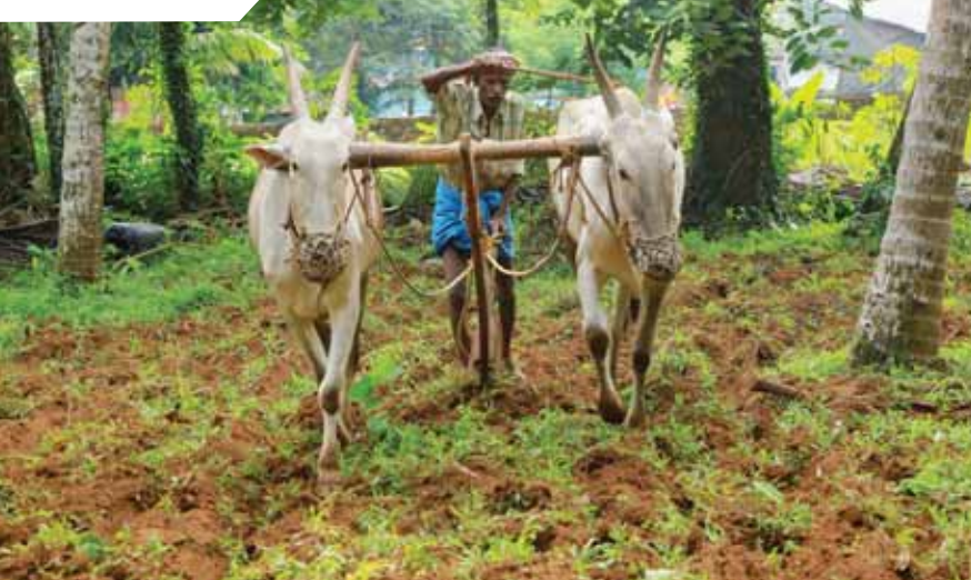
A farmer prepares a field for sowing, in Kozhikode