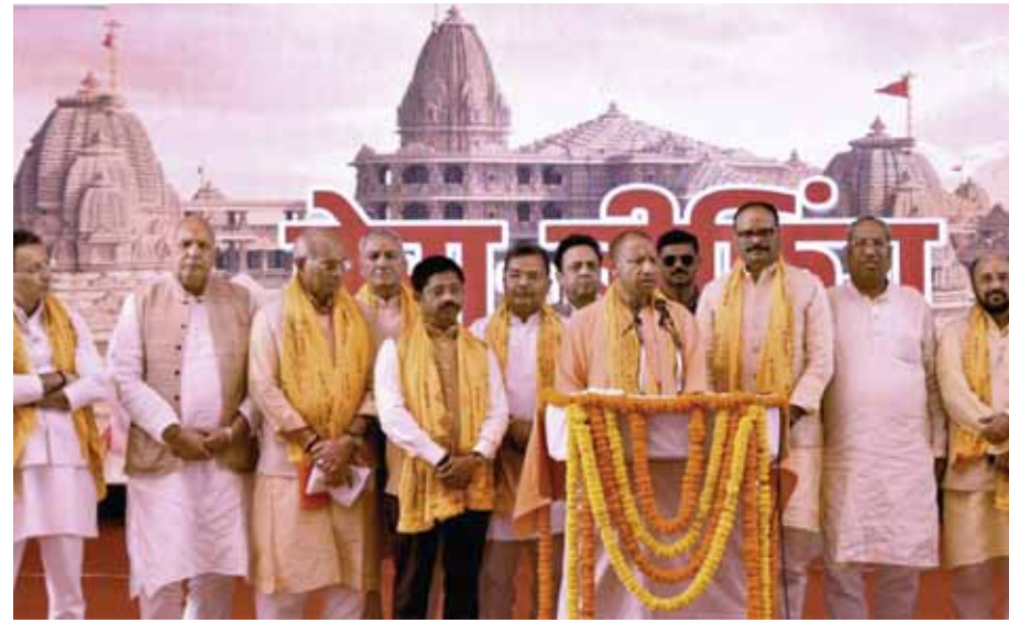
Uttar Pradesh Chief Minister Yogi Adityanath, with his Cabinet ministers, addresses the media at Ram Katha Park, in Ayodhya, on Thursday

In a departure from convention, the Yogi Adityanath Government on Thursday held its Cabinet meeting in Ayodhya as the city gears up for opening of the magnificent Ram temple in January 2024. The Uttar Pradesh Cabinet chaired by Adityanath approved several proposals which included building a temple museum and Ayodhya Research Institute as the International Ramayana Vedic Research Institute. Adityanath said after the meeting that a new chapter has been added in the history of Uttar Pradesh. The State Cabinet meetings are held in the capital city of Lucknow. This was only the second time a cabinet meeting of Uttar Pradesh has been held outside Lucknow while the first was in Prayagraj in January, 2019 ahead of the Mahakumbh. Standing before a banner that had pictures of Lord Ram and Lord Hanuman, the Chief Minister announced 14 proposals were approved in the Cabinet meeting that includes holding the Winter session of the State Assembly from November 28. Yogi and his Cabinet colleagues were also wearing yellow gamucha (scarves) with Sri Sita Ram written on it. November