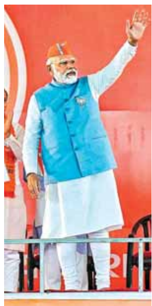
Prime Minister Narendra Modi waves at supporters during a public meeting ahead of the Madhya Pradesh Assembly elections in Neemuch district on Thursday

Prime Minister Narendra Modi on Thursday said the Congress is an "expert" in reversing the country's progress and asked voters to keep it away from power for at least 100 years as he accused the party of practising the policy of "divide and rule" and creating new records in corruption. Continuing his campaign blitz in Madhya Pradesh, where he addressed three rallies in a day for the second day running to bolster the BJP's polls prospects, Modi spoke about his welfare schemes and touched upon a range of other issues, but remained largely focused on attacking the Congress which is making a renewed bid to come back to power in the State where it lost its Government midway. Speaking at a rally in Chhatarpur ahead of the November 17 Assembly polls, he accused the Grand Old Party of ignoring the problems of Madhya Pradesh when it ruled the State.