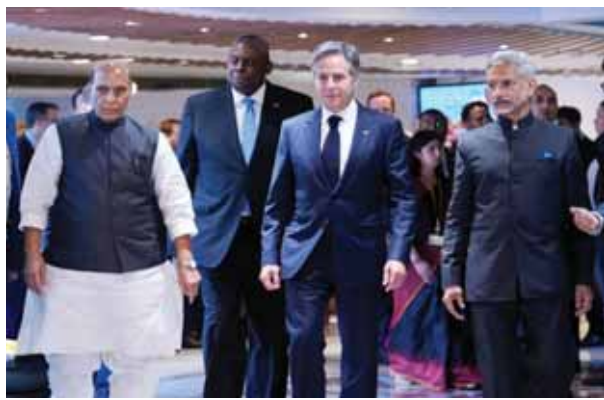
Defence Minister Rajnath Singh and External Affairs Minister S Jaishankar with US Secretary of State Antony Blinken and US Secretary of Defence Lloyd Austin arrive for a group photo before the 5th India-US 2+2 Ministerial Dialogue at Sushma Swaraj Bhavan in New Delhi on Friday

The ties between India and Canada came under severe