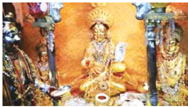
Golden idol taken out for public glimpse at Annapurna Mandir on the occasion of Dhanteras in Varanasi on Friday.

Amidst tight security arrangements, thousands of devotees thronged the famous Annapurna Mandir near Dwadasa Jyotirlinga Kashi Vishwanath Mandir to have 'darshan' of golden idol of Maa Annapurna on the auspicious occasion of Dhanteras here on Friday. As the temple is located in the red zone of super sensitive Gyanvapi premises, elaborate security arrangements were made and each devotee was only allowed after being checked through metal detectors. In view of the rush of devotees, the adjoining areas were barricaded. Queues of devotees were seen even in Dashashwamedh-Godwalia areas. The Dhanteras Parv (festival) will continue for five days and it is the first time when the same has been extended to five days, instead of four. The darshan of the