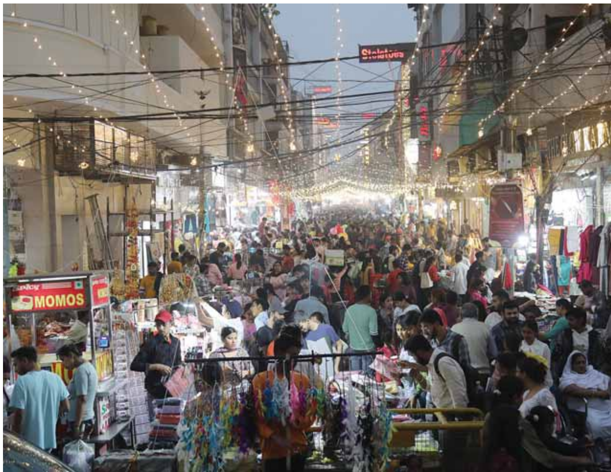
Dhanteras saw a large number of buyers in the market in New Delhi on Friday. The purchase of gold and silver gathered pace from the second half on Friday, with traders and retailers expecting sales volumes to increase by up to 20 per cent over last year due to the softening prices from the recent peak. Automobile manufacturers, consumer goods companies and appliance makers on Friday reported blockbuster sales during Dhanteras and expect the trend to continue for the next three days. The manufacturers have reported a high double-digit growth during pre-Diwali Dhanteras sales, in comparison with the same period last year, led by enhanced attractive offers and schemes.

Karnataka Chief Minister Siddaramaiah, Deputy Chief Minister DK Shivakumar and several ministers and political leaders had visited the temple in recent days.