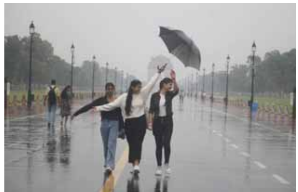
Girls enjoy a spell of rain at India Gate on Friday

Favourable wind speeds facilitating pollutant dispersion are expected to contribute to further improvement. The AQI,