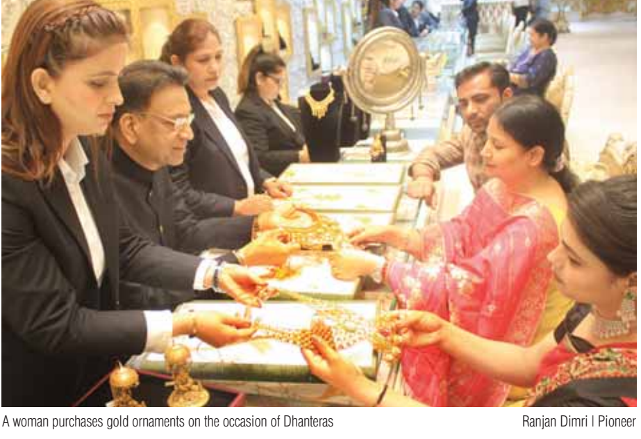
A woman purchases gold ornaments on the occasion of Dhanteras.

As the fourth stage of the Graded Response Actions Plan (GRAP) invoked due to deteriorating air quality index in the national capital, the Delhi University has declared an early winter break from November 13-19. All colleges and institutes of the university have been asked to declare the winter break. "In order to tide over the prevailing environmental pollution caused by severe air quality and implementation of GRAP-IV measures in Delhi, it has been decided to declare November 13 to 19 as winter break for the university and its colleges," the notification issued on Thursday read. The university has also revised the examination date for its undergraduate (UG) and post-graduate (PG) courses which will begin from December 20 and January 8, respectively, it said. The winter break, which is usually given in December, has been revised keeping in mind the GRAP-IV measures being implemented amid the prevailing air pollution in Delhi. The examination schedule for these courses will be released soon, an official said.