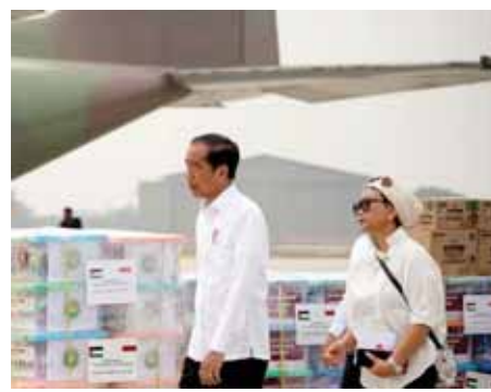
in September. However, events in the Middle East are expected to intrude on the agenda. Widodo will be arriving in the US after making a previous stop in Riyadh, Saudi Arabia, for a summit of Muslim leaders. While there, he joined in calls for a ceasefire and denounced the Israeli bombardment and invasion of Gaza, which began after Hamas attacked on October 7. Indonesia is the world's most populous Muslim country, and a senior administration official said "their views and their engagement are critical" on the war between Israel and Hamas. The official said Biden would seek to have Widodo "play a larger role" in the Middle East, although it was unclear exactly what that would entail.

AP ■ WASHINGTON President Joe Biden will host Indonesian President Joko Widodo at the White House on Monday, one day before the US leader leaves for San Francisco to attend a summit of Asian leaders. The two presidents will share an afternoon tea and meet with top advisers, according to senior administration officials who insisted on anonymity to preview the schedule. They will also talk about ways to expand the trade of critical minerals like nickel, which can be used to produce electric vehicle batteries. Indonesia is the world's largest producer of nickel. White House press secretary Karine Jean-Pierre said they "will explore opportunities to enhance cooperation on the clean energy transition, advance economic prosperity, bolster regional peace and stability, and reinforce our people-to-people ties." Biden's meeting with Widodo comes shortly before he sits down with Chinese President Xi Jinping on Wednesday during the Asia-Pacific Economic Cooperation summit. Indonesia is the world's third-largest democracy — after India and the United States — and a key player in Southeast Asia. The U.S. has been working to strengthen relationships in the region in hopes of deterring China's influence, and Vice President Kamala Harris attended a summit there