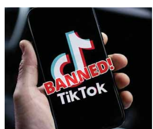
Police, Ministry of Home Affairs, and representatives of Tiktok discussed the issue earlier last week. Monday's decision is expected to be enforced following the completion of technical preparations, it said. Sharma clarified the decision to shut down Tiktok will be implemented promptly by setting a specific deadline. However, Nepali Congress General Secretary Gagan Thapa expressed reservations about the decision. "The government's decision to ban Tiktok is wrong; the gov-

PTI ■ KATHMANDU The Nepal government on Monday decided to ban the Chinese-owned social network platform Tiktok, citing its negative effects on social harmony. According to government spokesperson and Minister for Communication and Information Technology, Rekha Sharma, Monday's Cabinet meeting decided to prohibit Tiktok's use. The decision to ban Tiktok will be implemented through the Ministry of Communication and IT, she said. The Nepal government decided to ban Tiktok due to its negative effects on social harmony, The Kathmandu Post newspaper reported. A Cabinet meeting on Thursday made it mandatory for social media sites such as Facebook, X (formerly Twitter), Tiktok and YouTube, among others, to open their liaison offices in Nepal. Although freedom of expression is a basic right, a large section of society has criticised Tiktok for encouraging a tendency of hate speech, the government said. In the past four years, 1,647 cases of cybercrime have been reported on the video-sharing app, the report said. The Cyber Bureau of the Nepal