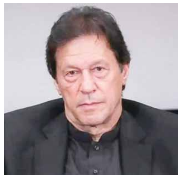
Khan has been in the Adiala Jail, Rawalpindi after he was shifted there on September 26 from the District Jail Attock where he was taken after arrest on August 5 following conviction in the Toshakhana case. The Pakistan Tehreek-e-Insaf

PTI ■ ISLAMABAD Pakistan's caretaker government on Monday approved the jail trial of former prime minister Imran Khan and his close aide ex-foreign minister Shah Mahmood Qureshi in a case against them for allegedly leaking state secrets and violating the laws of the country. Both Khan, 71, and Qureshi, 67, are currently detained in the Adiala jail on judicial remand. The case is based on alleged violation of the Official Secrets Act while dealing with a communication by the embassy of the country in Washington in March 2022 and it was launched in August this year by the Federal Investigation Agency (FIA). The summary for the jail trial of Khan and Qureshi in the Adiala jail due to security concerns was moved by the Ministry of Law and the cabinet gave its assent to it. The ministry stated in the summary that it had issued a no-objection certificate (NOC)