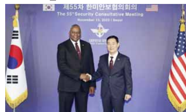
could assist US nuclear operations in such events with its conventional capabilities but didn't elaborate further. "Our deterrence commitment to the ROK remains ironclad — that includes a full range of our nuclear, conventional and missile defence capabilities," Austin said at a news conference, referring to South Korea's formal name, the Republic of Korea.

Arriving in South Korea over the weekend, Austin earlier met Shin during a three-way meeting with Japanese Defense Minister Minoru Kihara, who participated in the talks through online video. They agreed to start as planned a real-time information sharing arrangement on North Korean missile launches in December. They also agreed to set up multi-year plans in coming weeks to enhance their trilateral military exercises, South Korea's Defence Ministry said. Austin also on Sunday met Yoon, who expressed satisfaction over the increased consultations with Washington over nuclear deterrence plans and the more frequent deployment of advanced US military assets to the Korean Peninsula in past months, which he described as crucial for keeping the North's nuclear and missile threats in check.