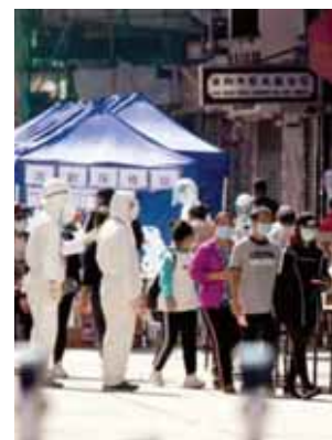
According to Lu, there may be a rise in COVID-19 cases during the winter seasons. Also, autumn and winter are known for high influenza rates, so people should also be cautious of potential co-infections, according to Lu. While it is still necessary to continue implementing prevention and control measures in the winter season, there is no need to be overly concerned about it, said Lu. The coronavirus which first emerged in Wuhan towards the end of 2019 had spiralled into a

PTI ■ BEIJING Chinese experts have sounded an alert about the relapse of COVID-19 infections during the current winter season and asked elderly and vulnerable populations to get vaccinated. The Chinese Centre for Disease Control and Prevention (Chinese CDC) shows that a total of 209 new severe COVID-19 cases and 24 deaths caused by COVID-19 were reported across the country in October, with the prevalent strains all being XBB variants, official media reported on Monday. China's top respiratory disease expert Zhong Nanshan warned of a small COVID-19 spike in the winter and reminded the elderly and vulnerable populations to get vaccinated as soon as possible, state-run Global Times reported. The virus is undergoing mutations, while the general population's ability to fight off the disease is declining because their antibody levels are lowering as time passes, Lu Hongzhou, head of the Third People's Hospital of Shenzhen, told the Daily.