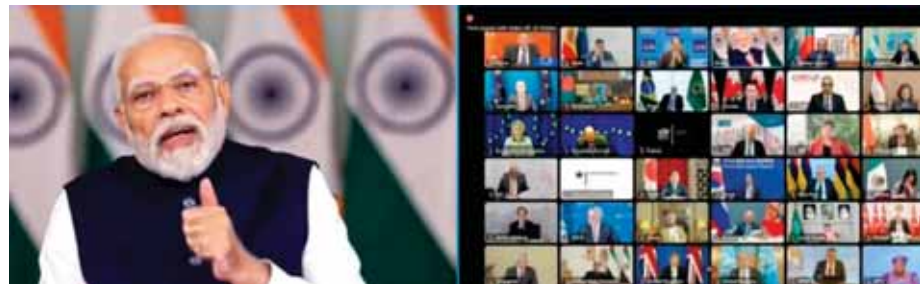
Prime Minister Narendra Modi addresses the G20 virtual summit in New Delhi on Wednesday

As the Israel-Hamas conflict rages on, Prime Minister Narendra Modi cautioned on Wednesday that insecurity and instability in West Asia are matters of concern. He emphasised the need to ensure that the Israel-Hamas conflict does not escalate into a regional conflict. Addressing the G-20 Leaders' summit, he stated, "Terrorism is unacceptable to all of us." Modi stressed that the death of civilians, regardless of the location, is condemnable, and he also welcomed the news of the release of hostages in West Asia. The summit was held in virtual mode. Significantly, the meeting came on a day Israel's Cabinet approved a temporary ceasefire with the Hamas group. Moreover, the virtual meeting of G20 leaders took place a day after leaders of the BRICS grouping held an extraordinary meeting on the humanitarian crisis in Gaza. Prime Minister Modi, in his opening remarks, said in the last few months, new challenges have emerged and the situation of insecurity and instability in West Asia is a matter of concern. The virtual meeting was attended by leaders such as European Commission President Ursula von der Leyen, Canadian Prime Minister Justin Trudeau, Russian President Vladimir Putin, Brazilian President Luiz