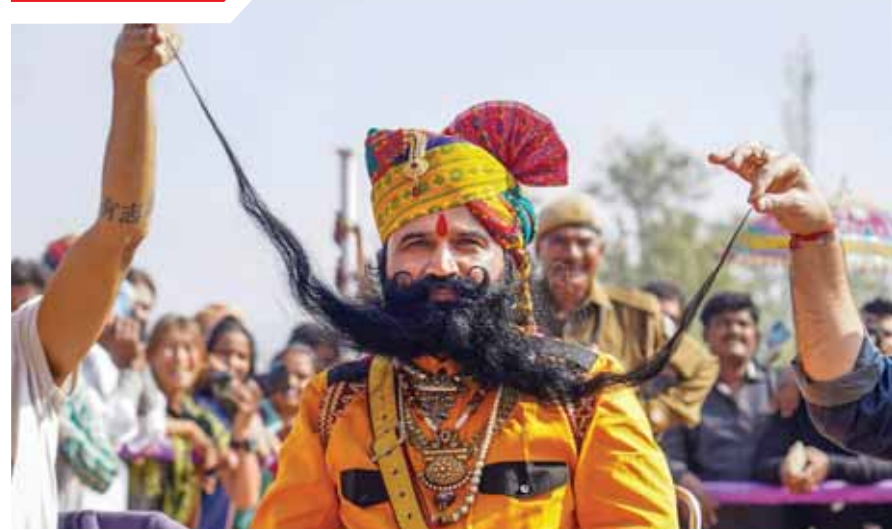
Participant of the 'longest moustache' competition during the annual Pushkar Fair, in Pushkar