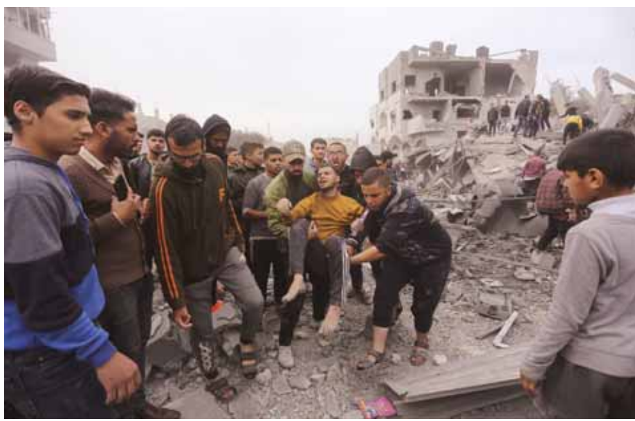
Palestinians evacuate survivors of the Israeli bombing in Rafah, Gaza Strip, Wednesday.

In a statement issued here, Guterres welcomed the agreement reached by Israel and Hamas, with the mediation of Qatar supported by Egypt and