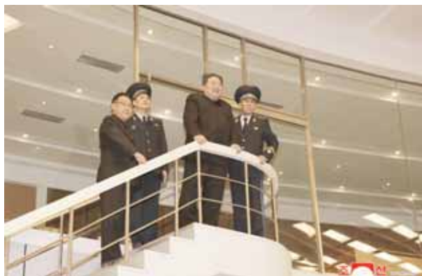
In this photo provided by the North Korean government, North Korean leader Kim Jong Un watches conditions of a satellite at a satellite control center in Pyongyang, North Korea, Wednesday after North Korea's space agency said its new 'Chollima-1' carrier rocket accurately placed the Mallyong-1 satellite into orbit on Tuesday night.