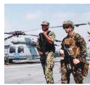
Three people were killed and three were missing after a landslide barreled down a heavily forested, rain-soaked mountainside and smashed into homes in a remote fishing community in southeast Alaska.

Earlier this month a Chinese coast guard ship blasted a Philippine supply ship with a water cannon in disputed waters, and last month a Chinese coast guard ship and an accompanying vessel