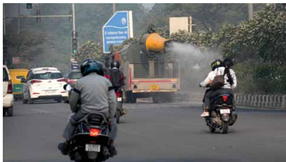
An anti-smog gun being used to spray water droplets to curb air pollution in New Delhi on Wednesday

order will be issued." Data from the Ministry of Agriculture showed Punjab reported 512 farm fires on Wednesday, taking the total number of such cases recorded since September 15 to 36,118. In October, the Delhi Government mandated that only those electric/CNG or BS-VI diesel buses would be allowed to enter the national capital from NCR cities of Uttar Pradesh, Haryana and Rajasthan. The Commission for Air Quality Management (CAQM) in the National Capital Region and Adjoining Area, a statutory body responsible for formulating strategies to combat pollution in the region, had on