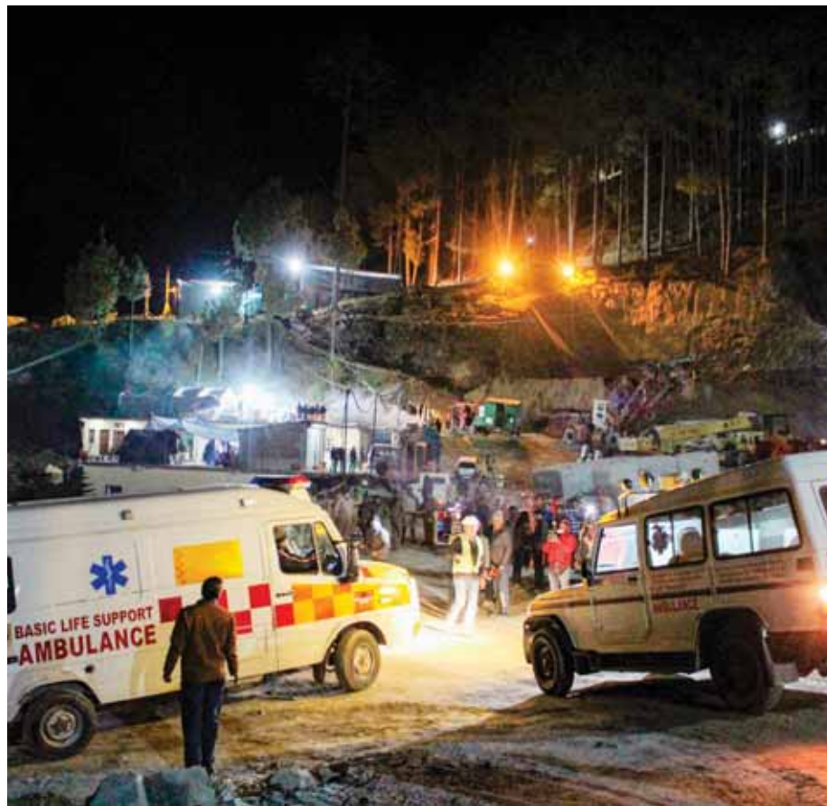
Ambulances on standby near the Silkyara tunnel where rescue operation of 41 workers trapped inside the tunnel for 10 days is underway in Uttarkashi on Wednesday. Horizontal drilling to evacuate trapped workers in the tunnel has reached 44 metres, rekindling hopes of the stranded 41 persons coming out soon