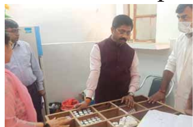
UP Minister of Industrial Development and minister incharge of the district Nand Gopal Gupta 'Nandi' inspecting Padari PHC on Tuesday

At Ayurvedic Hospital Bharpura the minister became aware of the facilities being provided to the patients, interacted with them and issued necessary directions. At Bharpura primary school the minister examined the standard of teaching through the students and tasted the mid-day meal. The minister asked questions related to the course but the students failed to respond satisfactorily. The teachers were warned to improve the standard of teaching. The minister inspected the Anganwadi centre too and directed the BEO to make the campus of school and Anganwadi centre safe from monkeys. He inspected the Atal play ground, Bhagat Singh Shaheed Udyan and waste disposal centre too. During the inspection of Padari PHC the minister found discrepancy in registers related to medicines as well as other items. He directed the CMO to suspend the two pharmacists posted at the hospital and initiate departmental action. The CMO was asked to ensure that the records are updated and crystal clear, especially related