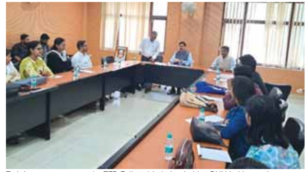
Training programme under TFB Fellowship being held at BHU in Varanasi on Friday.