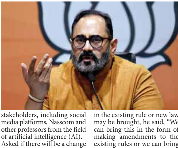
stakeholders, including social media platforms, Nasscom and other professors from the field of artificial intelligence (AI). Asked if there will be a change in the existing rule or new law may be brought, he said, "We can bring this in the form of making amendments to the existing rules or we can bring

forms have been given seven days time to align their terms of use as per the IT rules. "From today onwards, there is zero tolerance for violation of IT rules," Chandrasekhar added. Vaishnaw described deepfakes as "a threat to democracy." "Deepfakes have emerged as a new threat to democracy. These (can) weaken trust in society and its institutions. We will start drafting the regulations today itself and within a very short timeframe, we will have a separate regulation for deepfakes," Vaishnaw said at a Press conference on Thursday following a meeting with various