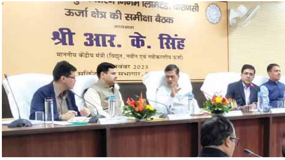
Union minister RK Singh reviewing progress of power sector in Varanasi on Thursday.

"The energy loss in the city should be further reduced and the loss percentage should be brought down further. For