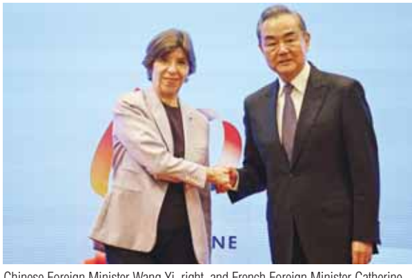
Chinese Foreign Minister Wang Yi, right, and French Foreign Minister Catherine Colonna shake hands during the 6th China-France high-level dialogue on people-to-people exchange at Peking University in Beijing on Friday

Starting December 1, citizens of France, Germany, Italy, the Netherlands, Spain and Malaysia will be allowed to enter China for up to 15 days without a visa. The trial pro-