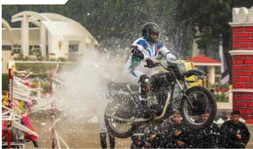
Indian Army Daredevils show their skills during a reunion ceremony, in Jabalpur.