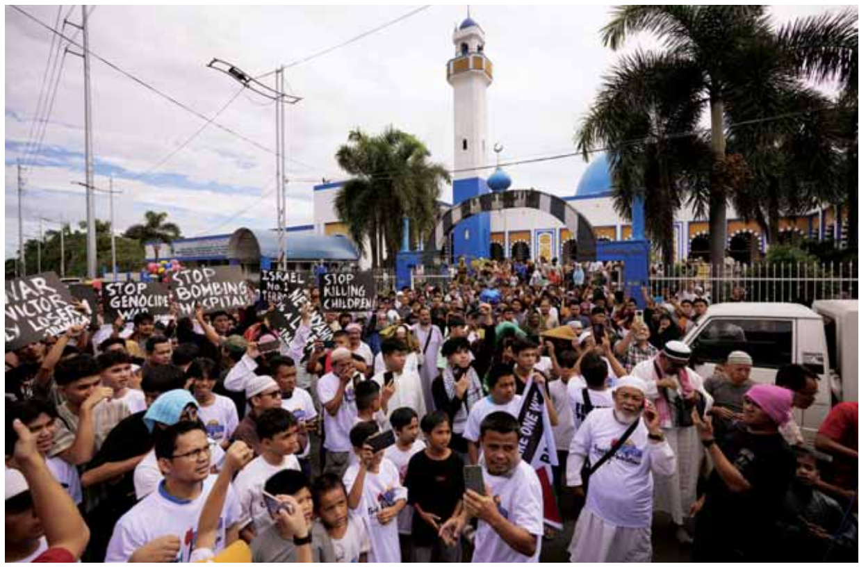
Filipino Muslims hold slogans during a demonstration in support of the Palestinian people and calling for a ceasefire in Gaza outside the Blue Mosque in Taguig, Philippines on Friday

Bandial later clarified that it was part of court etiquette and carried no political connotation. Asked about the special court's directives to present the ex-premier and former foreign minister Shah Mahmood Qureshi before the court on November 28 in the cipher case, Bugti said he would follow the court orders to the letter.