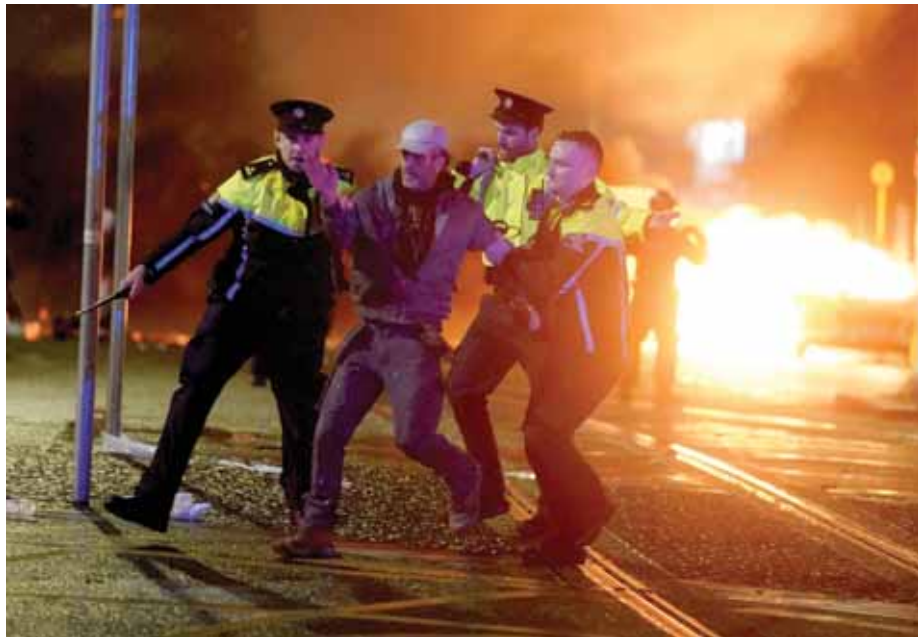
Irish police officers apprehend a man after a demonstration near the scene of an attack in Dublin city centre on Thursday

Police said over 400 officers including many in riot gear, were deployed in Dublin city centre to contain the unrest, which they said was "caused by a small group of thugs." A police cordon was also set up around the Irish Parliament building, Leinster House, and officers from the Mounted Support Unit were in nearby Grafton Street.