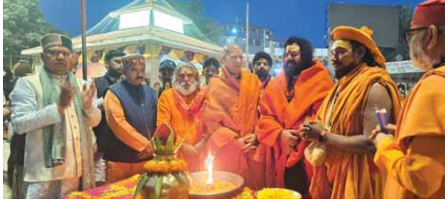
The foundation day ceremony of Subeh-e-Banaras at Assi Ghat in Varanasi on Friday.

Along with them, the representatives of Brahma Kumari, Devraha Baba Trust, Shri Ravidas Janmashali Trust, Dharmasaghar, Jagannath Temple, Dakshin Kali Math and about 25 other religious institutions also participated in the event. The rituals were