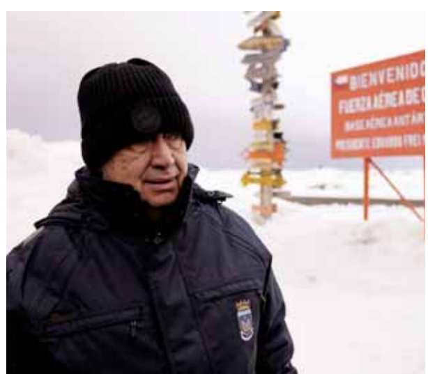
United Nations Secretary-General Antonio Guterres stands outside the Chilean Eduardo Frei Air Force Base in King George Island, Antarctica on Thursday

For years, scientists and environmentalists have kept an eye on the West Antarctic Ice Sheet as an important indicator of global warming. A study published in "Nature Climate Change" last month said warming has increased to the point that the ice sheet will now experience "unavoidable" melting regardless of how much the world reduces emissions of planet-warming gases