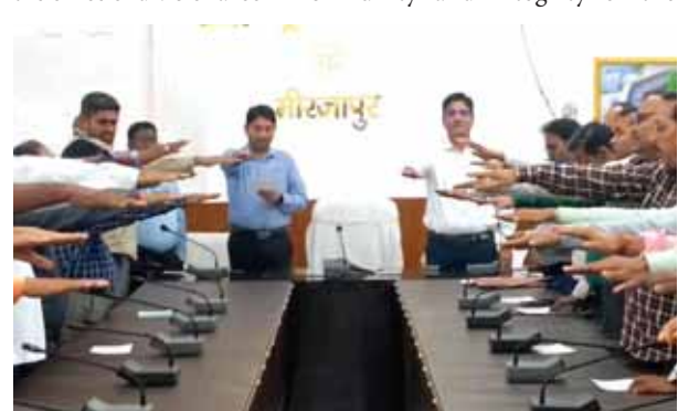
Constitution Day being observed at the Collectorate on Sunday

sioner (SP) Abhinandan said the nation must be kept on the top. On the occasion oath for unity and integrity of the