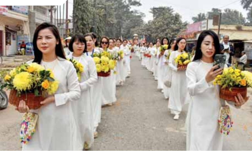
Devotees take part in a procession on Buddha Purnima, in Varanasi