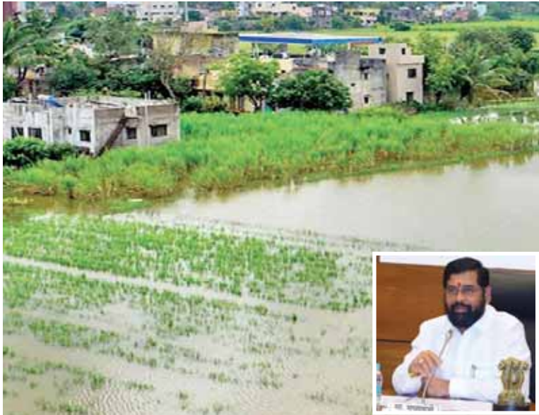
tance of Rs 2,500 crore from the Centre to provide immediate aid to the affected farmers.

Fadnavis said that the tillers have been affected in varying degrees in different parts of the state with their rabi season (winter) crops getting damaged because of the sudden rains witnessed in several districts of the state during the last few days. Informed official sources that Maharashtra government would seek an assis-