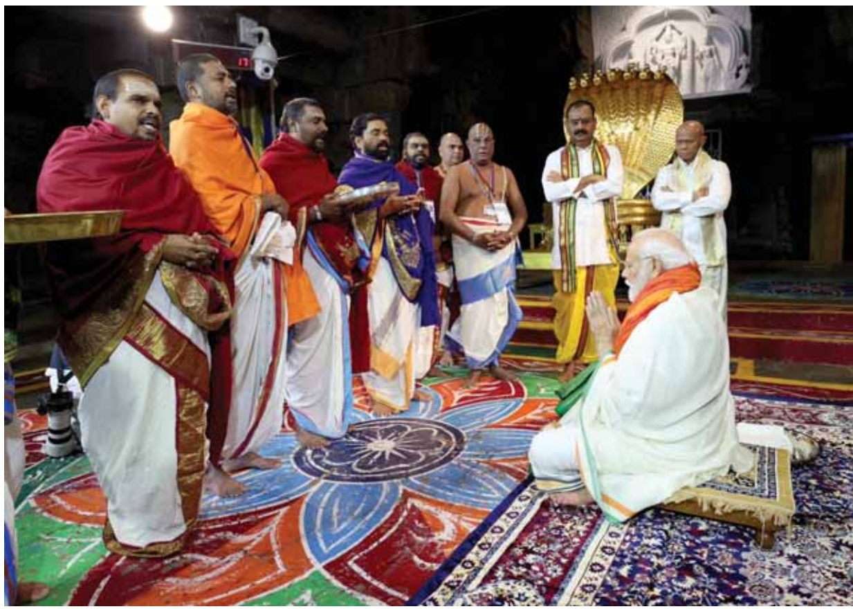
Prime Minister Narendra Modi visits the famous hill shrine of Lord Venkateswara at Tirumala in Andhra Pradesh on Monday and offered prayers for the good health, well-being and prosperity of all Indians