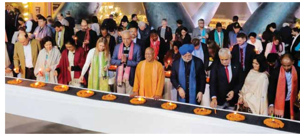
Chief Minister Yogi Adityanath along with the Union Minister Hardeep Singh Puri and foreign guests inaugurating the splendid Dev Deepawali celebration by lighting diyas at Namoo Ghat.