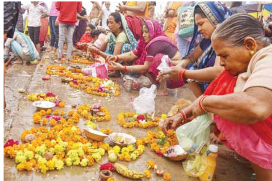
Devotees perform religious rituals after taking a holy dip in the river Yamuna on Kartik Purnima, in Prayagraj on Monday

BUS CATCHES FIRE: A Lucknow-bound AC Shatabdi bus caught fire near Beli Hospital in the afternoon