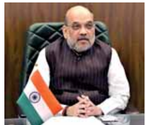
istration is engaged in relief work, praying for the speedy recovery of the injured." The India Meteorological Department (IMD) has said the rain activity is expected to abate on Monday. As per the SEOC data, as many as 234 out of 252 talukas of Gujarat received rainfall on Sunday, with Surat, Surendranagar, Kheda, Tapi, Bharuch and Amreli districts recording 50-117 mm rainfall in 16 hours, throwing normal life out of gear and causing crop damage. Hailstorms hit some parts of Rajkot, while locals were seen rejoicing the scene created by the sudden showers.

All the fatalities were attributed to lightning strikes during unseasonal rainfall which battered the state on Sunday. Four persons died in Dahod district, three in Bharuch, two in Tapi, and one each in Ahmedabad, Amreli, Banaskantha, Botad, Kheda, Mehsana, Panchmahal, Sabarkantha, Surat, Surendranagar and Devbhumi Dwarka, the SEOC official said. Union minister Amit Shah in a post on X on Sunday night said, "I am deeply saddened by the news of the death of many people due to bad weather and lightning in various cities of Gujarat. I express my deepest condolences for the irreparable loss to those who lost their loved ones in this tragedy. The local admin-