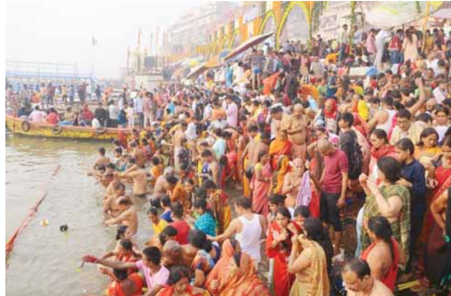
Devotees taking a holy dip in Ganga on the auspicious occasion of Kartik Purnima.

Heavy rush of devotees was seen particularly at Dashashwamedh, Rajendra Prasad, Ahilyabai, Man Mandir, Assi, Sheelta, Scindia, Panchganga, Nagwa,