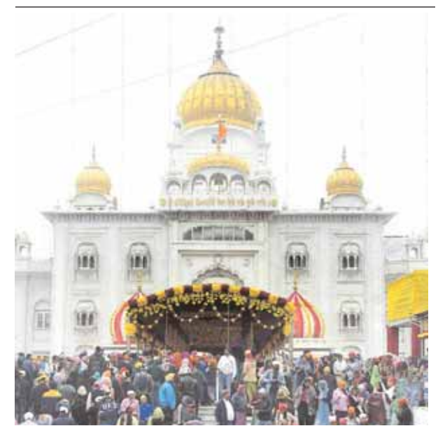
Devotees visit the Gurudwara Bangla Sahib on the occasion of the birth anniversary of Guru Nanak Dev