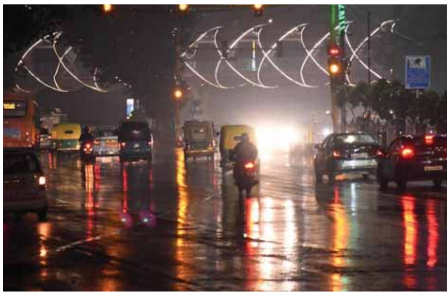
ed the national Capital and its suburbs, reducing visibility to just 600 meters at 8 am at the

Delhi witnessed light rain with a thunderstorm in the evening, and residents were hopeful that the showers would bring down the high pollution levels. This came after the air quality in the national Capital deteriorated to the severe category. With the temperature dropping due to the rain, netizens have taken to social media to share their reactions. According to IMD scientist RK Jenamani the clouds over Delhi will persist till Tuesday. "The western disturbance created due to intense circulation over central Pakistan led to the cloud formation over Delhi," he said. The minimum temperature was recorded at 13.4 degrees Celsius, three notches above the season's average. The average Air Quality Index of Delhi was recorded at 395 at 4 pm. A thick layer of smog blanket-