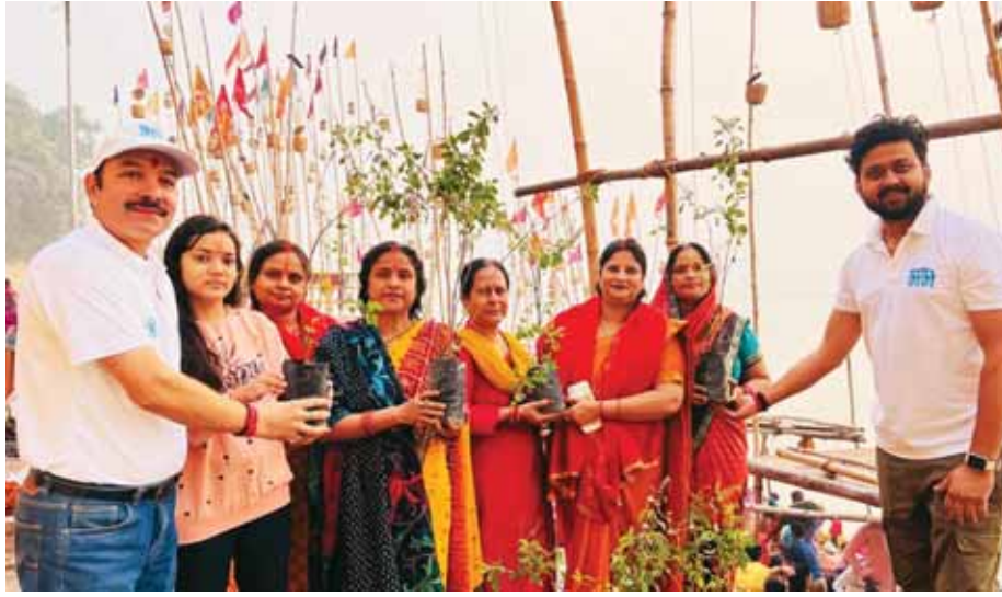
Namami Gange activists celebrating Prabodini Ekadashi before launching a special cleanliness drive for Dev Deepawali in Varanasi on Thursday.

Besides, both the eastern and western banks of the crescent-shaped ghats of Kashi