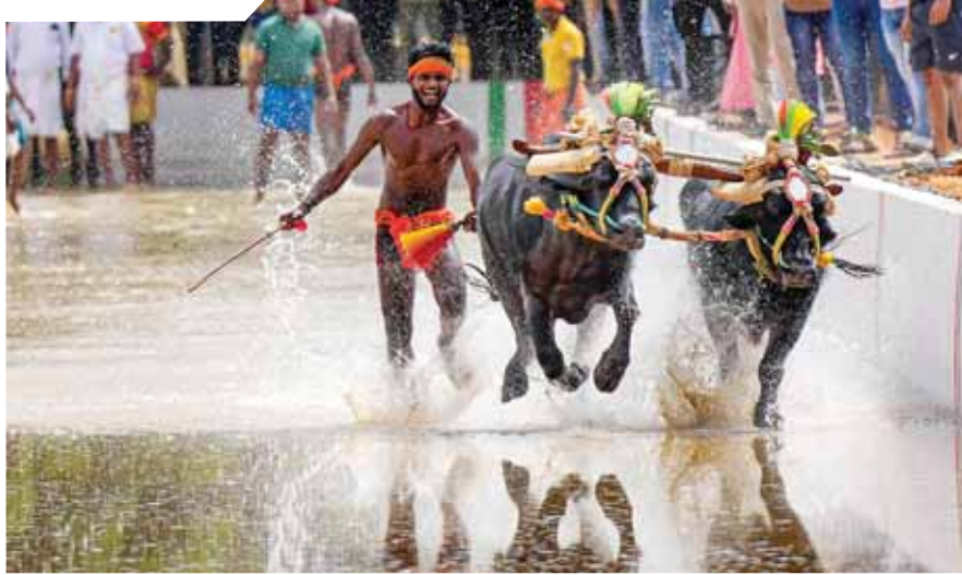
A participant with his buffaloes during a trial run for the 'Bengaluru Kambala', in Bengaluru.