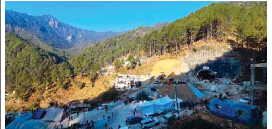
Preparations underway near the Silkyara tunnel where rescue operation of 41 workers trapped inside the tunnel

PIONEER NEWS SERVICE /PTI ■ DEHRADUN/ UTTARKASHI