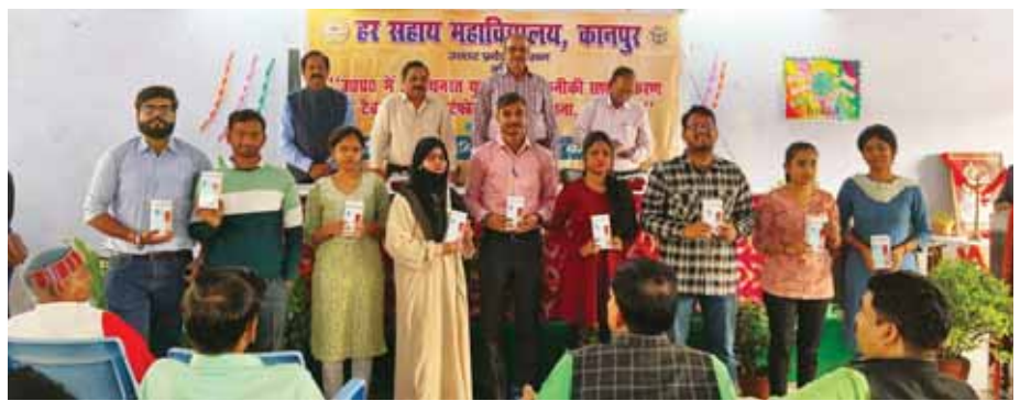
Smartphones distributed at Harsahai PG College, P Road, on Thursday.