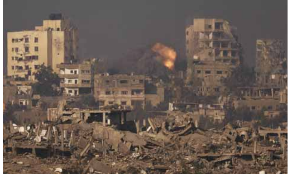
An explosion is seen following an Israeli bombardment in the Gaza Strip, as seen from southern Israel, Thursday.