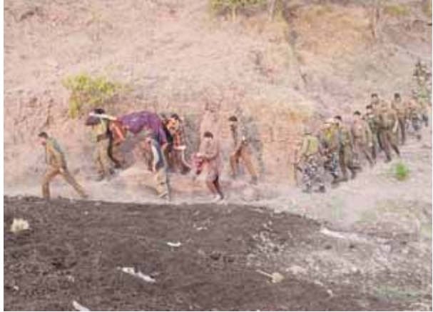
Army and police personnel shift bodies of two terrorists killed during an encounter at Bajimaal area in Rajouri district on Thursday