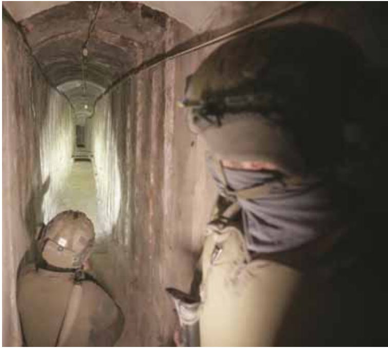
Israeli soldiers show the media an underground tunnel found underneath Shifa Hospital in Gaza City, Wednesday. Israel says that Hamas militants sought cover on the grounds of the hospital and used the tunnel for military purposes.

The Persian Gulf nation said early Thursday that a new time for the agreement to go into force would be announced "in the coming hours." It was originally set to begin Thursday morning. The US and Egypt also helped negotiate the deal.