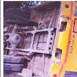
The school bus which overturned near Benda village of Ghatampur on Thursday morning

On coming to know about the agitation, the sub-divisional magistrate (SDM)