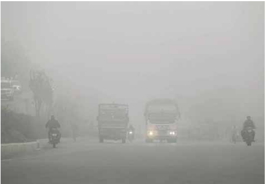
Shaheed Path engulfed by a thick fog cover on Tuesday morning