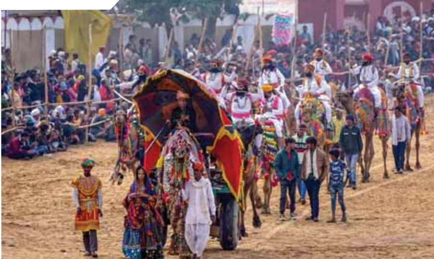
Artists perform during the closing ceremony of the annual Camel Fair, in Pushkar