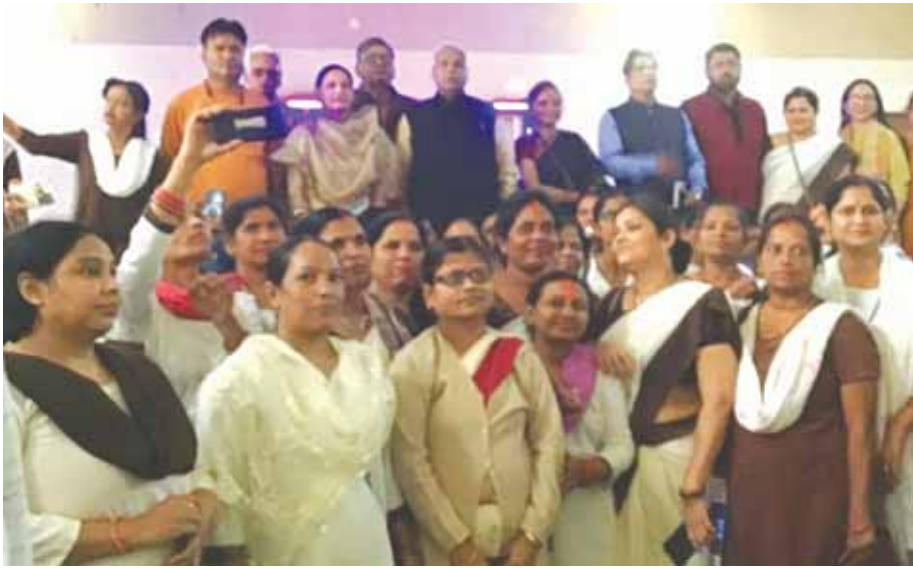
ASHA workers taking part in the state level convention organised here on Wednesday.