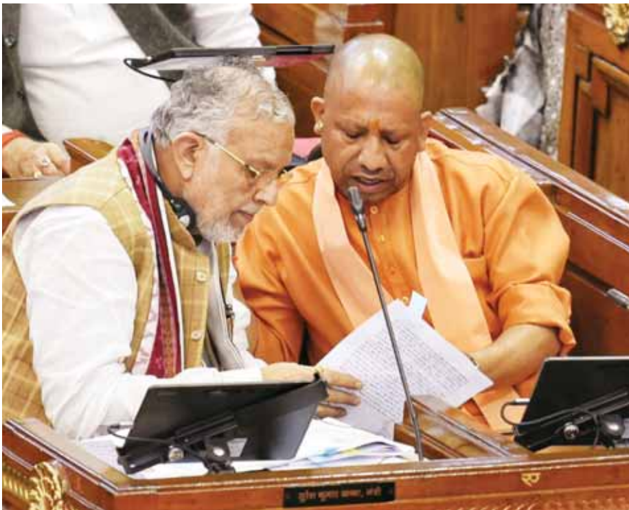
Chief Minister Yogi Adityanath and Finance Minister Suresh Khanna having an intense discussion during Winter Session on Wednesday

A provision of Rs 50 crore as seed capital for the 'State Capital Regional Development Authority' and Rs 100 crore for the construction of the regional offices of the authority at Varanasi and Gorakhpur, and Rs 10 lakh to the UP Housing and Development Board for the