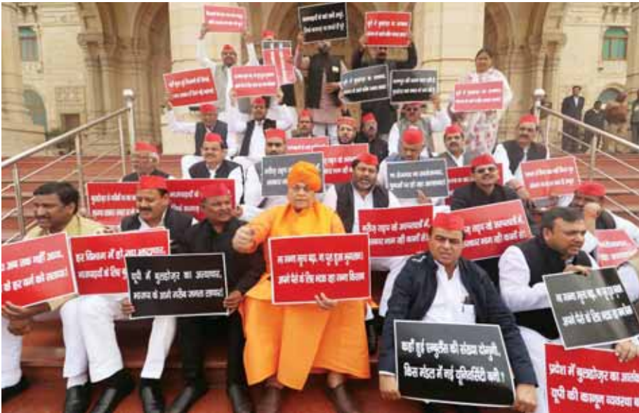
A new set of rules prohibiting the legislators from carrying phones, political posters or flags in the Uttar Pradesh Assembly came into force during the winter session.

Carrying banners with slogans on unemployment, patients facing problems in hospitals, use of bulldozers and farmers' problems related to irrigation, the Samajwadi Party (SP) MLAs sat on the stairs in front of the House. The SP members wore black clothes as a mark of protest on the first day of the winter session which began on Tuesday. One of the MLAs wore a kurta having anti-government slogans on it.