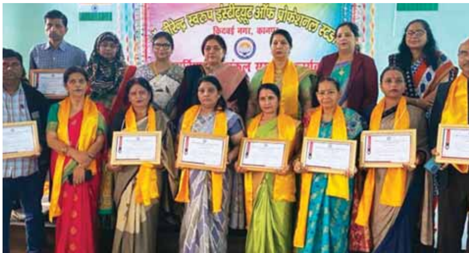
BEd Internship Programme function being held at Dr Virendra Swarup Institute of Professional Studies.