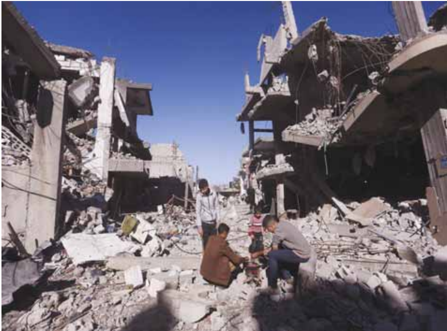
Palestinians cook bread by their destroyed homes in Kuza'a Gaza Strip during the temporary ceasefire between Hamas and Israel on Wednesday.

The war began with Hamas' October 7 attack into southern Israel, in which it killed over 1,200 people, mostly civilians. The militants dragged some 240 people back into Gaza, including babies, children, women, soldiers, older adults and Thai farm labourers. Israel responded with a devastating air campaign