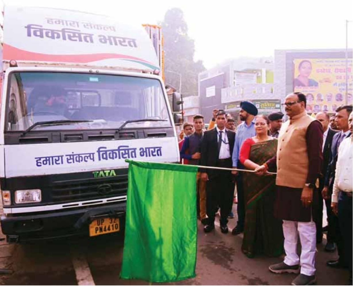
Deputy Chief Minister Brajesh Pathak flagging off Bharat Sankalp Yatra in Lucknow on Wednesday

The divisional commissioner will also carry out an inspection of the gardens and flower beds on Saturday.