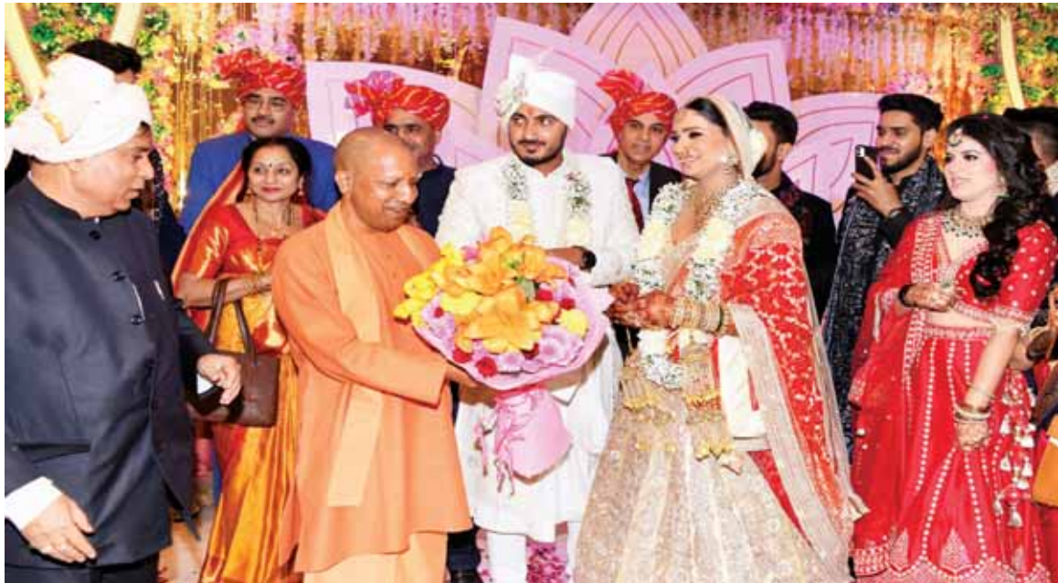
Chief Minister Yogi Adityanath attending the marriage ceremony of BJP leader Markanday's daughter in Gurugram on Wednesday

each in Sector Delta-2, five plots of 2,580 square metre each in Sector Alpha-2, a plot of 11,500 square metre in Sector Alpha-2, a plot of 12,000 square metre in Sector Ecotech-12, a plot of 10,000 square metre in Technozone-8, six plots of 10,400 square metre each in Sector 12, three plots of 10,600 square metre each in Sector 10, and a plot of 9,250 square metre in Sector 10.