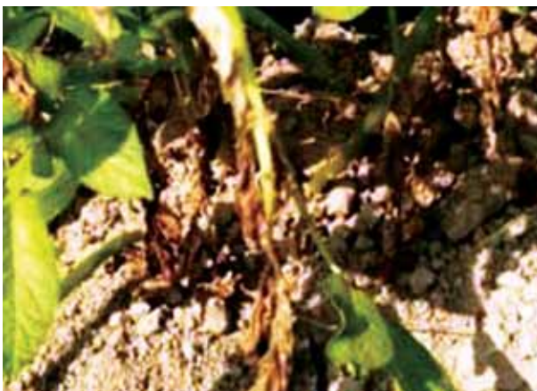
Late blight affected potato crop in rural Kanpur