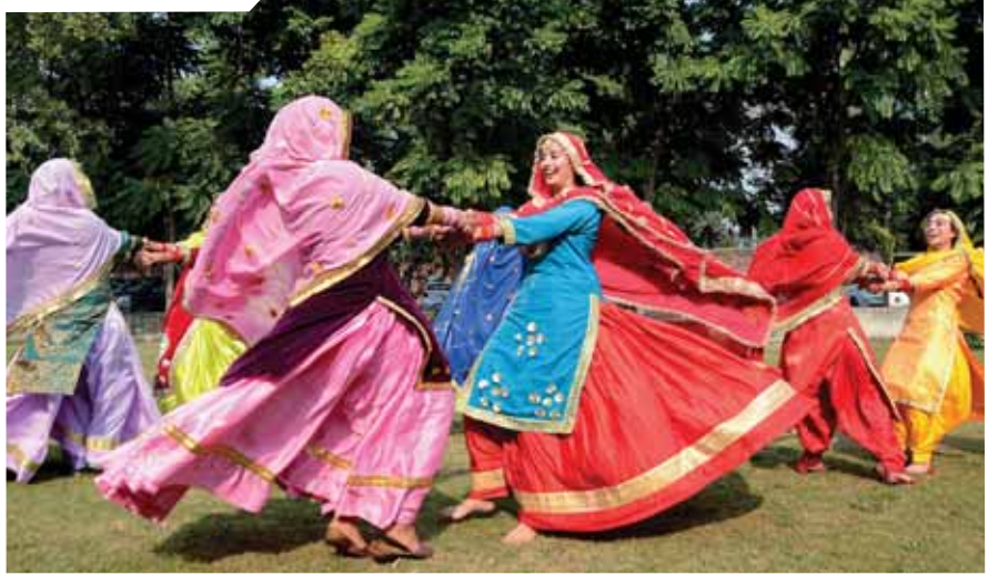
Girls wearing traditional Punjabi dress perform 'giddha', in 11th Amritsar International Folk Festival