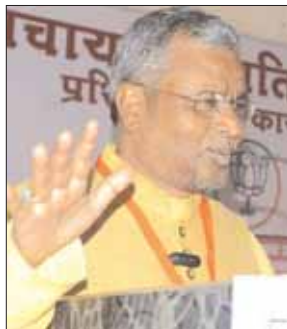
State BJP President Babulal Marandi addresses party workers during a training session of Panchayat Samiti members in Giridih on Tuesday.

The BJP leader said that in the development journey of