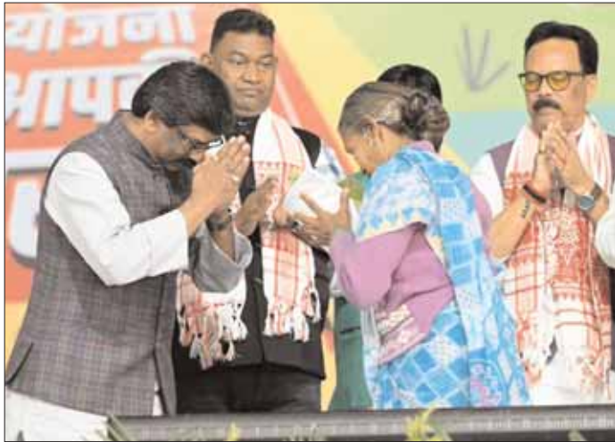
Chief Minister Hemant Soren greets an elderly woman during the third phase of "Aapki Yojana, Aapki Sarkar, Aapke Dwar" in Chiri, Lohardaga on Tuesday.

Addressing people on the occasion, the CM said, "This is the third phase of your scheme, your government, your door campaign. I have come to Lohardaga today to join the campaign. This is the third consecutive year of delivering the state government schemes to the doorsteps of the people of the state. This is the government of tribals and natives. We have to reach the last person and connect him with the welfare schemes of the government. Now in the third phase, camps are being organized at Panchayat and Ward level under the Aapki Yojana, Aapki Sarkar, Aapki Dwar programme. Where officials did not go, today they are