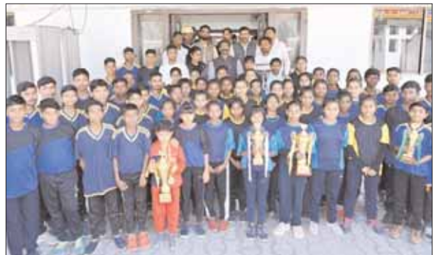
Players of state level sub-junior netball with Chief Minister Hemant Soren during a programme in Godda district on Tuesday.

The Chief Minister said that our government is committed to promoting sports and players. In this connection, sports grounds are being developed in Panchayats. Sports kits and other facilities are being provided to the