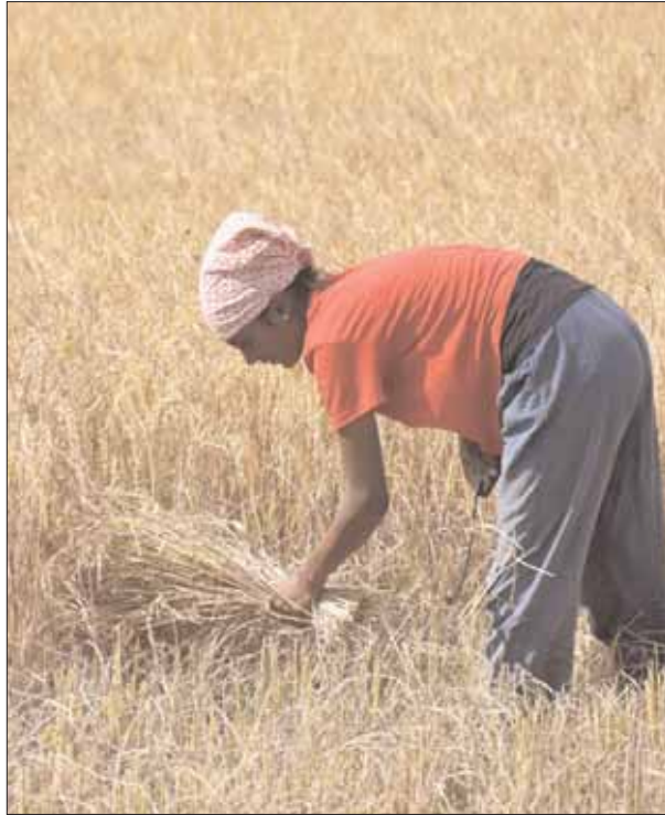
A farmer harvests paddy in a field near Ranchi on Tuesday.

On Thursday, November 30, a special campaign will be run for voter registration for senior citizens above 80 years of age.