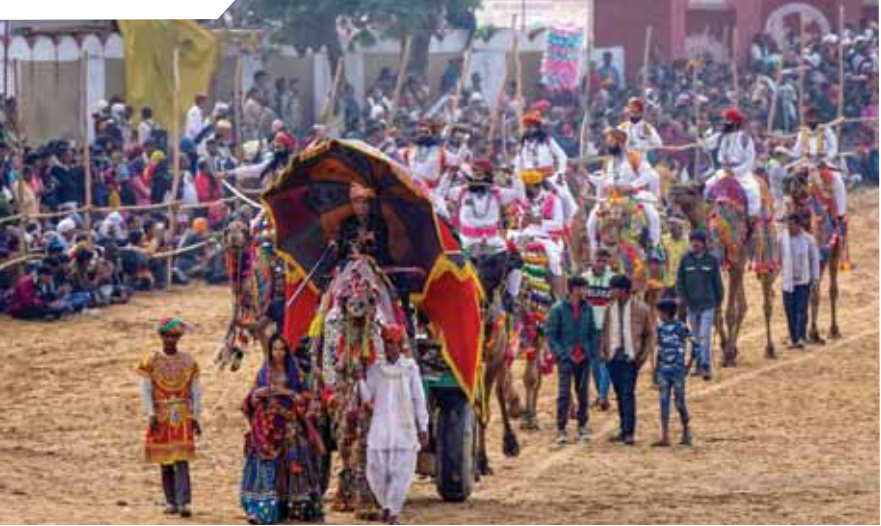
Artists perform during the closing ceremony of the annual Camel Fair, in Pushkar