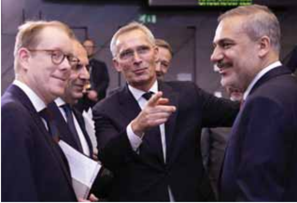
NATO Secretary General Jens Stoltenberg, centre, speaks with Sweden’s Foreign Minister Tobias Billstrom, left, and Turkey’s Foreign Minister Hakan Fidan, right, during a meeting of NATO foreign ministers in North Atlantic Council session at NATO headquarters in Brussels, on Tuesday

“It is doable,” he said. “We can do it if we are calm but