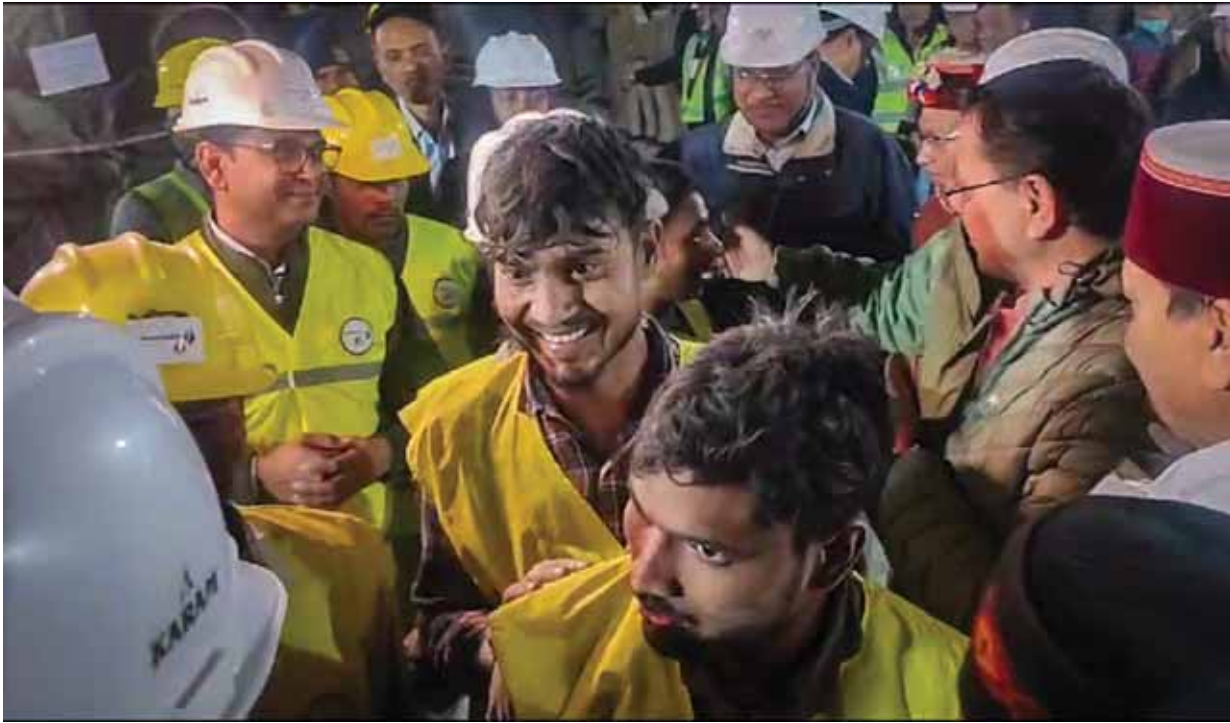
Jubilation as the trapped workers come out of the collapsed Silkyara Tunnel in Uttarkashi on Tuesday. Uttarakhand Chief Minister Pushkar Singh Dhami and Union Minister of State for Road Transport & Highways VK Singh greet them

"All are fine and healthy. I have spoken to a few of them," said a rescue worker as media persons who staked out at the site