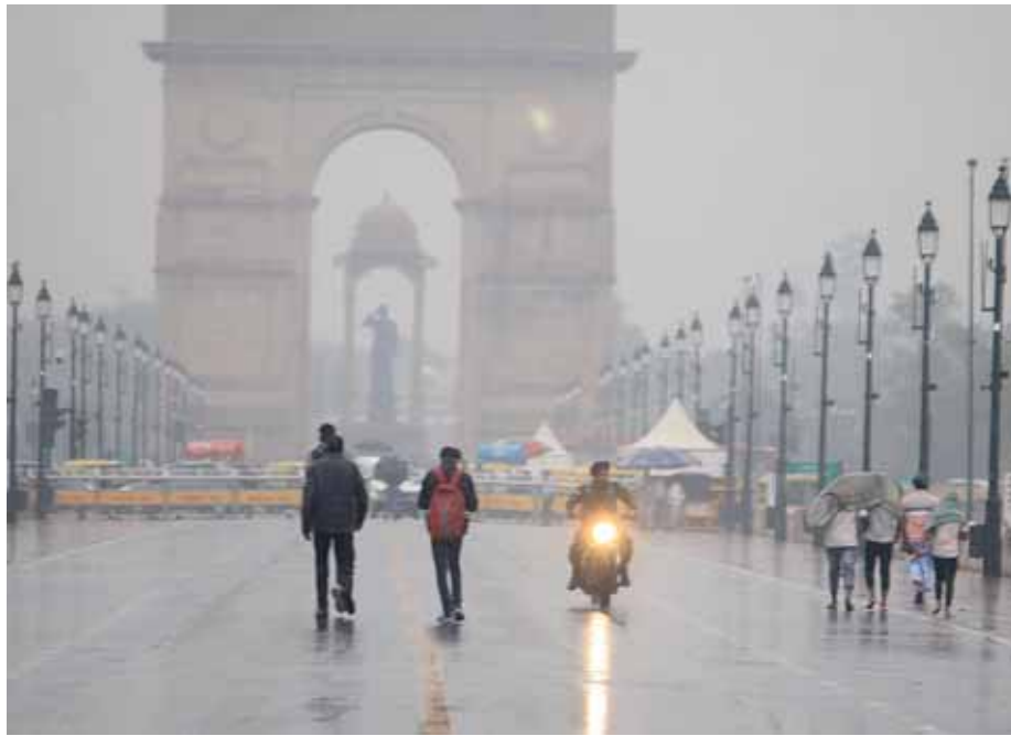
Commuters during a rainy morning at India Gate on Tuesday

them, while 353 (15 per cent) have serious criminal cases against them, the report said. It also stated that BRS, which is contesting on all 119 seats in Telangana, has fielded 57 candidates with criminal cases against them, while 34 of them are facing serious criminal cases. The figures are lowest for Mizoram, where between 3 per cent and 10 per cent of candidates from major parties have criminal records, and none of the candidates have declared cases related to crimes against women, attempt to murder, and murder. In Chhattisgarh, out of 1,178 candidates analysed, 126 candidates have declared criminal cases, while 291 have declared serious criminal cases. In Rajasthan, the report claimed that out of 1,875 candidates, 326 are facing criminal cases while 236 are facing serious criminal cases. The report also said that Congress, which fielded 677 candidates, has 268 candidates with criminal cases and 162 with serious criminal cases.