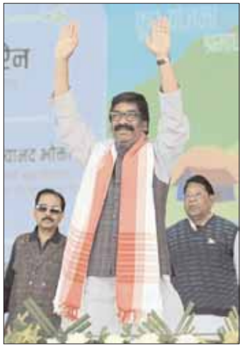
Chief Minister Hemant Soren acknowledges supporters during the mant Soren greets an elderly woman during the third phase of "Aapki Yojana, Aapki Sarkar, Aapke Dwar" in Chiri, Lohardaga on Tuesday.