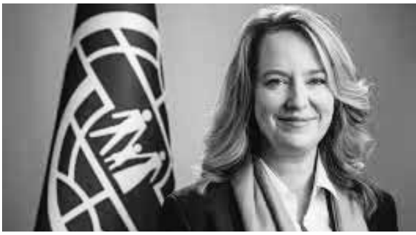
New head of UN’s migration agency Amy Pope

Governments who open up to migration often do so at their political peril: The Biden administration — which