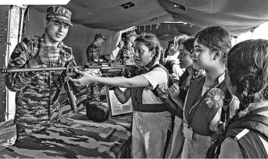
Army personnel briefs students about a weapon during an event of 'Veer Gatha', in Kolkata