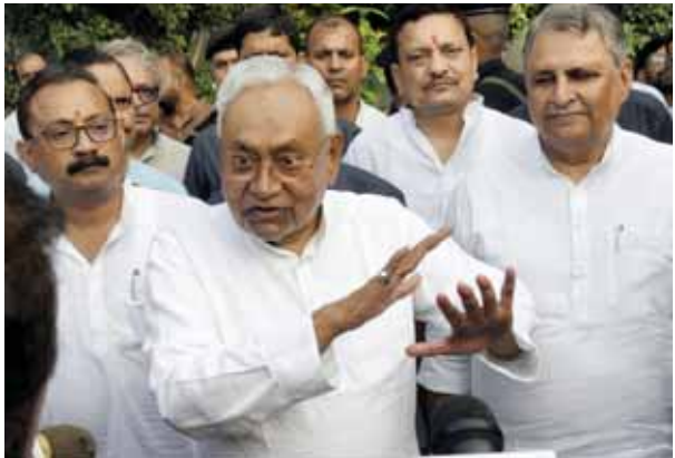
Bihar Chief Minister Nitish Kumar speaks with the media regarding the caste-based census report in Patna on Monday

The Opposition BJP, however, voiced dissatisfaction with the caste survey, stressing that it did not give an idea of the