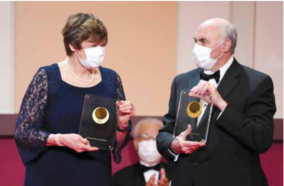
The Nobel Prize in medicine has been awarded to Hungarian-American biochemist Katalin Kariko and American physician-scientist Drew Weissman for enabling development of mRNA COVID-19 vaccines. In the photo above, Katalin Kariko, left, and, Drew Weissman pose with their trophies during the Japan Prize presentation ceremony in Tokyo on April 13, 2022