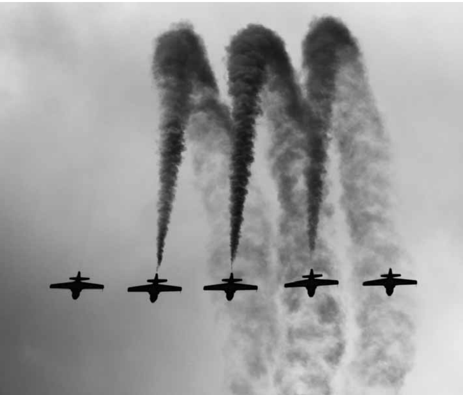
An aerial acrobatics team, the Canadian Snowbirds, performs during the Pacific Airshow at Huntington Beach, California, on Sunday

Security camera footage on Sunday showed the vehicle stopping in front of the ministry, with a man exiting it and rushing toward the entrance of the building before blowing himself up. A second man is seen following him.