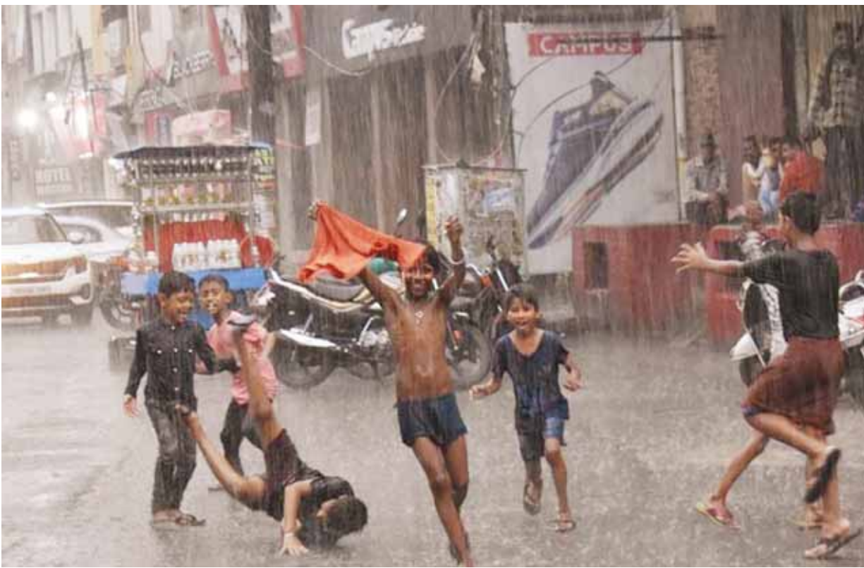
Children enjoying incessant rain in Varanasi on Tuesday.