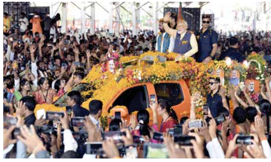
Prime Minister Narendra Modi waves at supporters as he arrives for an event organised for laying of foundation stone of various developmental projects, in Nizamabad on Tuesday

Prime Minister Narendra Modi on Tuesday slammed the Congress over its pitch for a nationwide caste census and accused the grand old party of trying to divide Hindus, and sought to know if it wants to curtail the rights of Muslims by advocating population-based distribution of resources. Modi said for him the poor formed the biggest chunk of population in the country and they should have the first right over resources irrespective of which caste or community they belong to, and accused the Congress of dividing society on caste lines for vote bank politics. The PM's statements came a day after the Nitish Kumar Government released a caste survey, which revealed OBCs and EBCs constitute a whopping 63 per cent of Bihar's total population. Congress leader Rahul Gandhi, whose party is a constituent of the ruling bloc in the northern State, hailed the Bihar caste survey, saying the country needs a caste-based census to give people their rights as per their proportion in population. Addressing the "Parivartan Mahasankalp" rally of the BJP at Jagdalpur, the headquarters of Bastar district in poll-bound Chhattisgarh, Modi alleged the Congress has entered into a