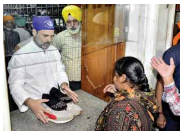
Congress leader Rahul Gandhi during 'sewa' at Gurudwara Sri Harmandir Sahib (the Golden Temple) in Amritsar on Tuesday

not going well. In between I was even doing throws of 54m and I thought if I was doing so bad, I would quit. But I told myself that I will not give up so soon and fight till the end." The Uttar Pradesh athlete's earlier best this season was 59.24m which fetched her a gold at the Federation Cup in May. She has been under tremendous pressure after a string of poor shows. She has a personal best of 63.82m, which is the national record. Continued on Page 2