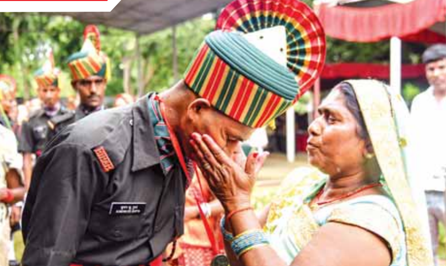
An Agniveer soldier of the second batch celebrates with his mother after the passing out parade in Patna