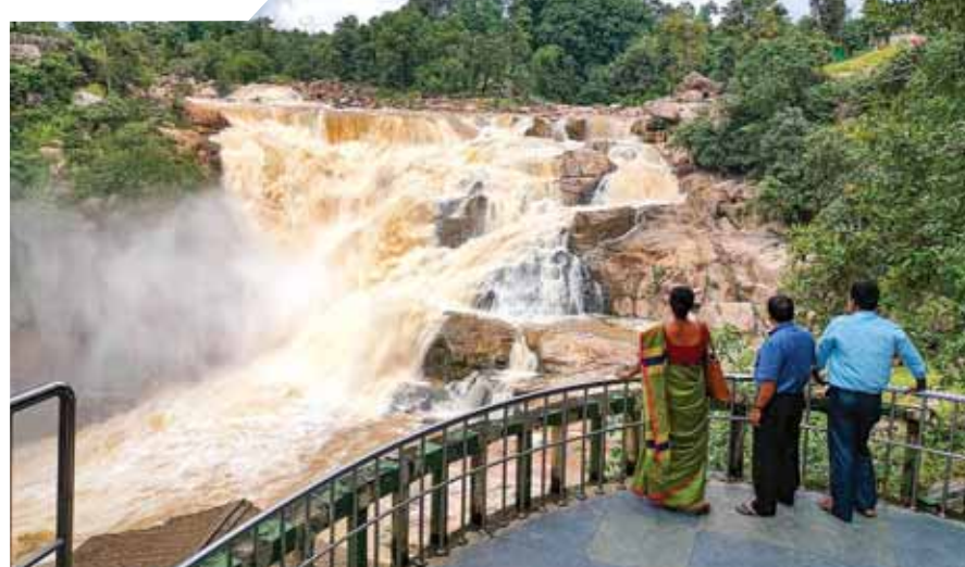
People watch the overflowing Dassam Falls, after continuous rains, in Ranchi