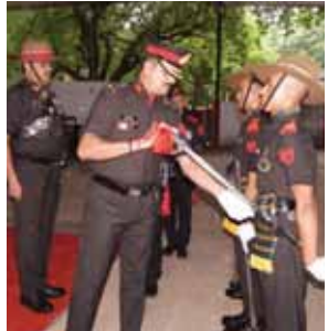
Brigadier Rajeev Nagyal at passing out parade of Agniveers at 39-GTC.

After 31 weeks of basic and advanced military training,