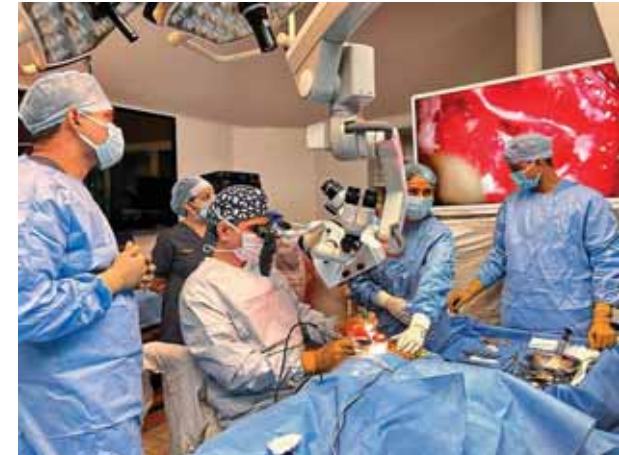
Army Hospital (R&R) doctors conducted 50 bilateral simultaneous cochlear implants in the last 18 months, becoming the only government hospital across the country to accomplish these many successful implants

both ears (bilateral). These implants are often placed in both ears at the same time in children with bilateral severe hearing loss, particularly for infants and children who are learning to speak and process language. Children get only one cochlear implant in most of the government-funded programmes. The cost of the equipment has always been a concern, making its outreach limited. "The cost of the equipment has always been a concern, making its outreach limited. Children get only one cochlear implant in most of the government-funded programmes. The benefit of hearing in both ears far outweighs the cost involved and the Armed Forces Medical Services were quick to realise this," the Defence Ministry said in a statement.