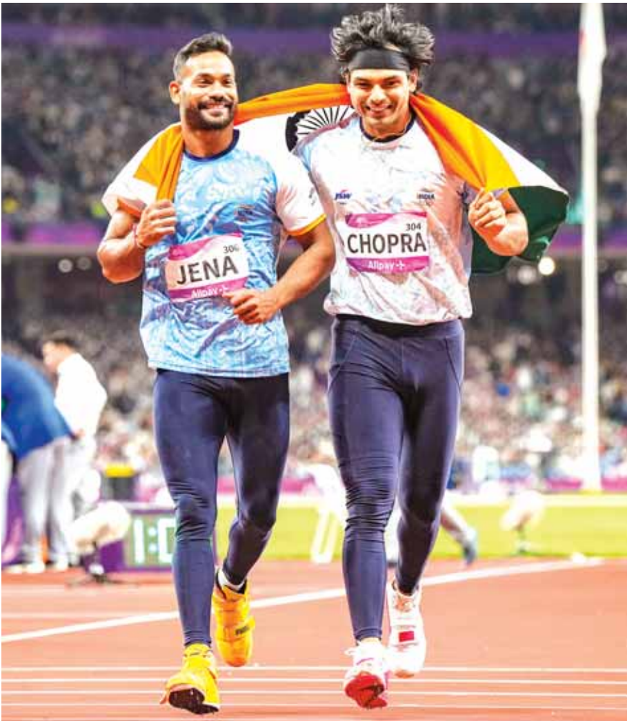
Neeraj Chopra and Kishore Kumar Jena wave the national flag after securing gold and silver medal respectively in the Men's Javelin Throw Final event at the 19th Asian Games in Hangzhou in China on Wednesday

which I enjoyed thoroughly. We are used to such high level competition. "When he took the lead it became very interesting. We have to keep telling ourselves that we can overcome the challenge and emerge as best," Chopra said after winning gold. With his stunning effort Kishore thus sealed his berth for the Paris Olympics. The qualification mark was 85.50. Chopra has already qualified for the 2024 Games with a throw of 88.77 at the World Championships in Budapest in August this year. Indian quartet of Anas Muhammed Yahya, Amoj Jacob, Muhammed Ajmal Variyathodi and Rajesh Ramesh also sealed the gold for India in the men's 4x400m relay with a timing of 3:01.58. Indian quartet of Vithya Ramraj, Aishwarya Mishra, Prachi and Subha Venkatesan also claimed a silver in women's 4x400m relay. Harmilan Bains and Avinash Sable won a silver medal each in women's 800m and men's 5000m respectively. Earlier during the day, Indian race walkers Manju Rani and Ram Baboo won the bronze medal in the inaugural 35km mixed team event. Tokyo Olympic medallist Lovlina Borgohain put up a lacklustre display to settle for a silver as Indian boxers signed off with a haul of five medals at the Asian Games here on Wednesday.