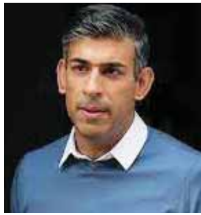
Street in three generations," he said.

Rishi Sunak addressed his first Conservative Party conference as party leader in Manchester on Wednesday and used his own elevation as the country's first Indian-origin Prime Minister as proof that the UK is not a racist country and that his skin colour was not a "big deal". Dubbed as the most important speech of his political career nearly a year after he took charge as Tory leader, there was a lot riding on the 43-year-old leader's address to the governing party activists ahead of a general election expected next year.