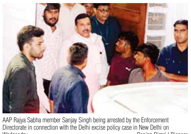
AAP Rajya Sabha member Sanjay Singh being arrested by the Enforcement Directorate in connection with the Delhi excise policy case in New Delhi on Wednesday

The Enforcement Directorate (ED) on Wednesday arrested Aam Aadmi Party (AAP) Rajya Sabha member Sanjay Singh in connection with alleged corruption in the Delhi excise policy "scam". Sanjay is the second high-profile leader in the AAP to be arrested in the excise case after Manish Sisodia, the then Delhi Deputy Chief Minister. ED officials reached Sanjay's official residence at North Avenue in the morning to conduct searches. After day-long questioning, Sanjay was placed under arrest under the Prevention of Money Laundering Act (PMLA). Sisodia, who is the prime accused in the excise policy case, was arrested by the ED as well as the CBI. Sanjay is expected to be produced before a designated court on Thursday where the agency will seek permission for his custodial interrogation. The developments stirred a political slugfest between the AAP and the BJP with Delhi Chief Minister Arvind Kejriwal terming it as a desperate measure by the BJP ahead of the