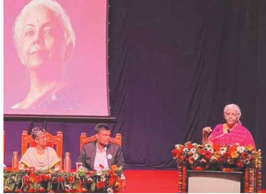
Union Finance Minister Nirmala Sitharaman addressing students of IIT (BHU) in Varanasi on Sunday.

"It can be anybody in a position where they feel left out, not wanted or maybe feel that they don't belong to the position where they've reached," she said, appealing to the students to never give up as it is a trial for them and they should have to navigate it. "No one can help you, as such. It's