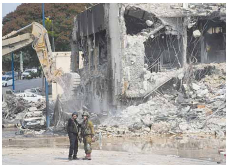
(From left) Palestinians walk by the rubble of a building after it was struck by an Israeli airstrike, in Gaza City, on Sunday; Palestinian kids take religious books out of a mosque destroyed in an Israeli air strike in Khan Younis, Gaza Strip, on Sunday; a digger removes the rubble from the police station that was overrun by Hamas