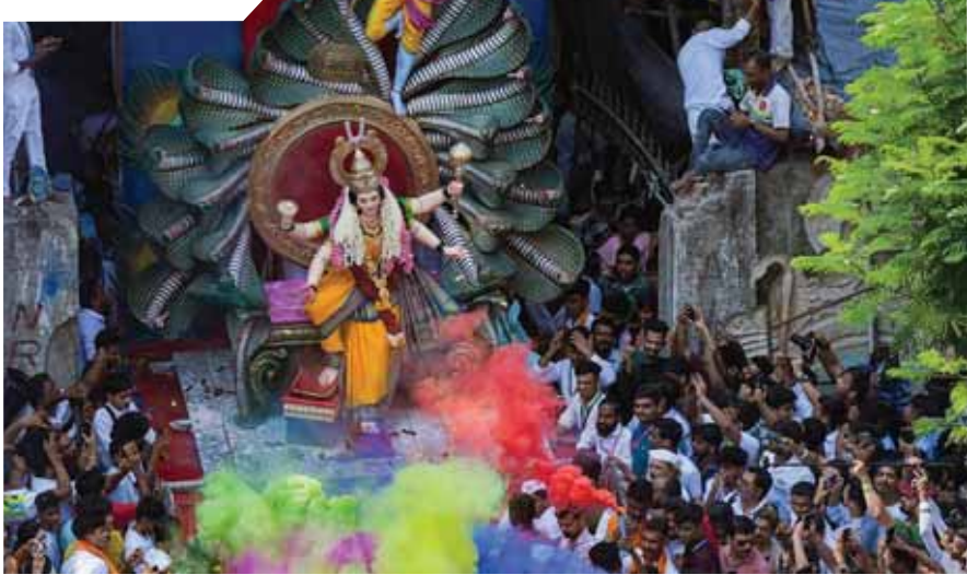
Devotees carry an idol of Goddess Durga to a puja pandal ahead of the Navratri festival, in Mumbai.