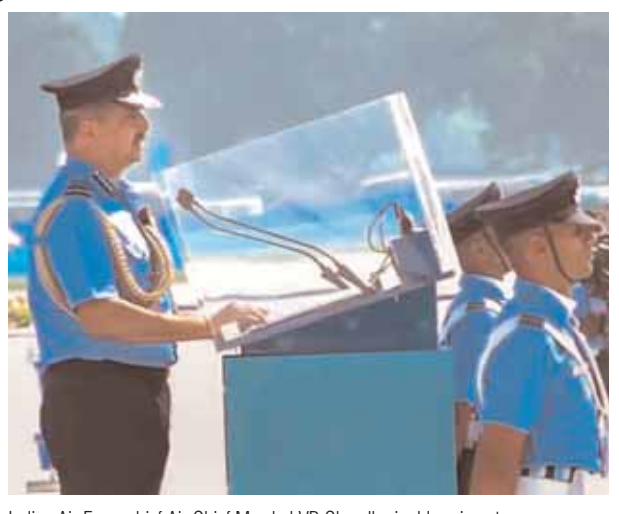
Indian Air Force chief Air Chief Marshal VR Chaudhari addressing at the 91st anniversary day celebrations of Indian Air Force in Prayagraj on Sunday

The Air Chief Marshal said the IAF has continuously evolved in the last nine decades. Today it is one of the best air forces in the world. But, is this enough? If India is on track to become a developed nation by 2047, then by the