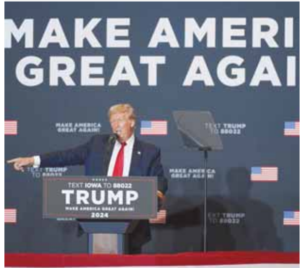
Former President Donald Trump speaks during a campaign rally, Saturday, in Cedar Rapids, Iowa.

India and Canada are embroiled in a diplomatic standoff following allegations by Prime Minister Justin Trudeau in the Canadian Parliament last month that "Canadian security agencies have been actively pursuing credible allegations of a potential link between agents of the government of India and the killing" of Khalistani extremist Hardeep Singh Nijjar on Canadian soil on June 18 in British Columbia, a charge angrily rejected by New Delhi as "absurd" and "motivated".