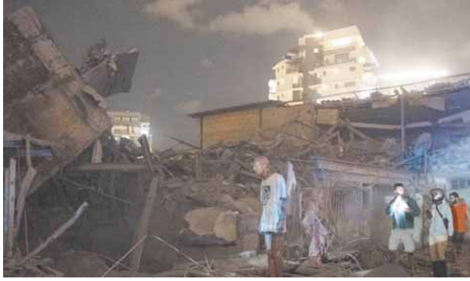
People look at the damage from a rocket fired from the Gaza Strip in Tel Aviv, Israel

Ministers criticised Chief of Staff Herzi Halevi claiming