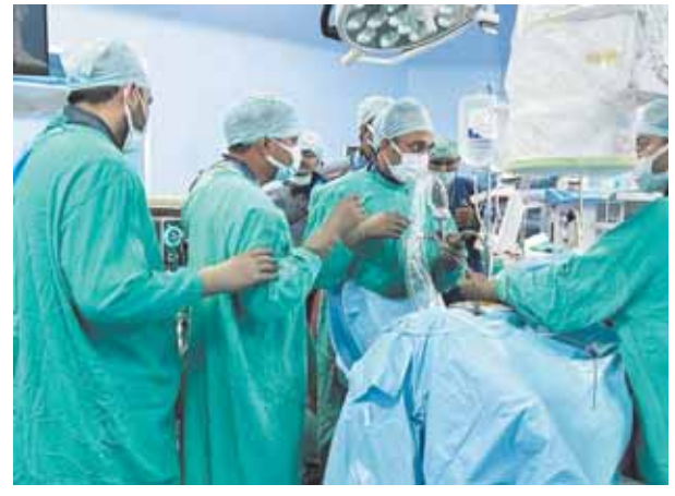
SSH BHU doctors performing a rare endoscopic surgery in Varanasi recently.