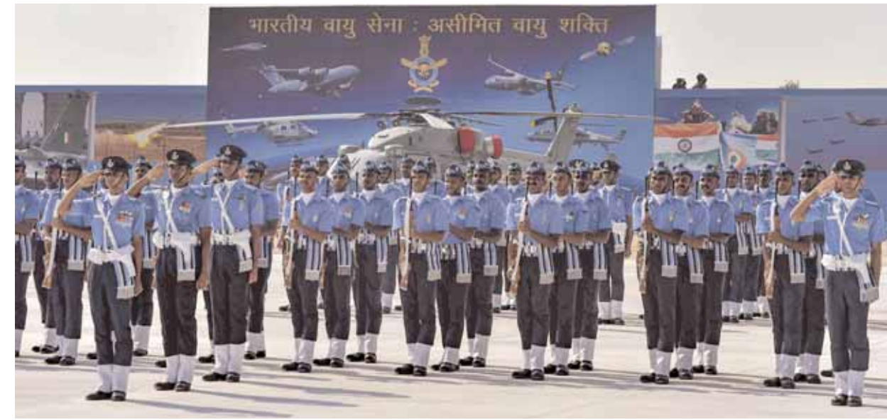
Air Force personnel during the 91st Air Force Day celebrations, at Bamrauli headquarters of Central Air Command in Prayagraj on Sunday