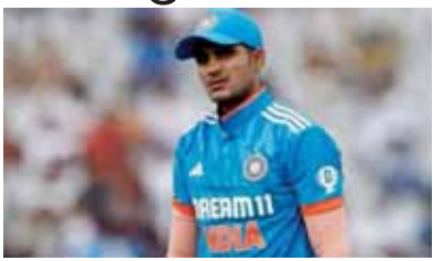
"He will stay back in Chennai and will be under the supervision of the medical team."

"The opening batter who missed the team's first fixture in the ICC Men's Cricket World Cup 2023 against Australia in Chennai is set to miss the team's next fixture against Afghanistan in Delhi on the 11th of October.