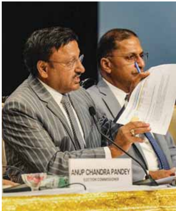
recently brought out a proforma for parties and States to explain how and when the promises made by them in

their poll manifesto will be implemented.