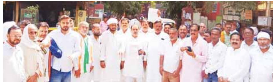
The delegation of Congress Party coming out from Collectorate after submitting memorandum.

The delegation termed it as a part of conspiracy of the state government against Rai who never bowed down to the OM and the CM and continued raising voice against the faulty policies of both the central and the state governments.