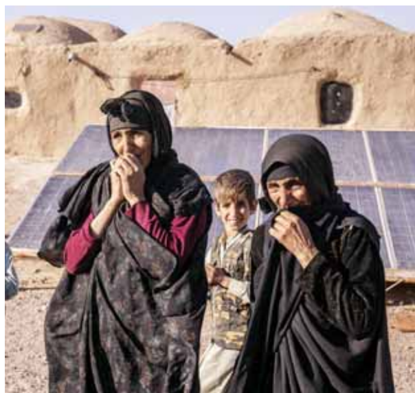
Afghan women mourn for relatives killed in an earthquake to a burial site after an earthquake in Zenda Jan district in Herat province, western of Afghanistan on Sunday.

People in Herat freed a baby girl from a collapsed building after she was buried