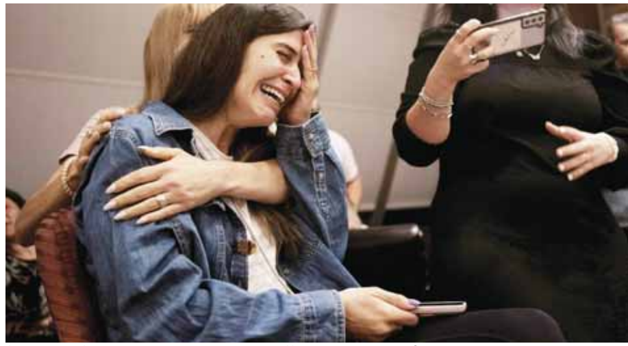
A relative of an Israeli missing since a surprise attack by Hamas militants near the Gaza border, is overcome by emotion during a press conference in Ramat Gan, Israel, Sunday.

Israeli communities on either side of the festival grounds also came under attack, with Hamas gunmen abducting dozens of men, women and children — including elderly and disabled people — and killing scores of others in Saturday's unprecedented surprise attack. The staggering toll of the festival was becoming clear early Monday, as Israel's rescue service Zaka said paramedics had recovered at least 260 bodies. Festival organisers said they were helping Israeli security forces locate attendees who were still missing. The death toll could rise as teams continue to clear the area. As the carnage unfolded before her, Alper pulled a few disoriented-looking revelers into her car from the street and accelerated in the opposite direction. One of them said he had lost his wife in the chaos and Alper had to stop him from breaking out of the car to find her. Another said she had just seen Hamas gunmen shoot and kill her best friend. Another rocked in his seat,