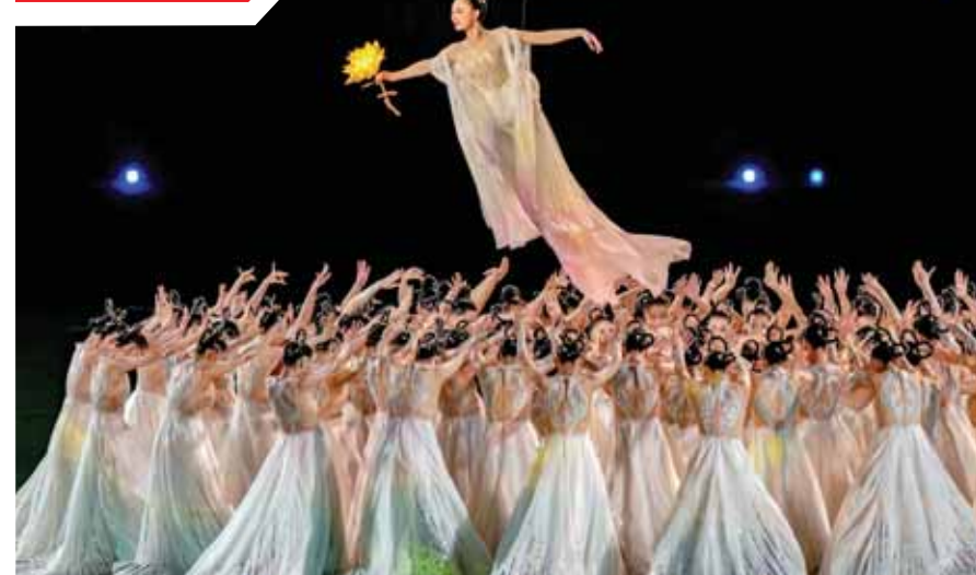
Artists perform during the closing ceremony of the 19th Asian Games, in Hangzhou, China