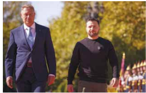
Ukraine's President Volodymyr Zelenskyy, right, attends a welcoming ceremony at the Cotroceni Presidential Palace together with Romanian President Klaus Iohannis, in Bucharest, Romania, on Tuesday

Ukrainian President Volodymyr Zelenskyy met with his counterpart in Romania Tuesday for talks on regional security and to strengthen bilateral ties against the backdrop of Russia's invasion of his country. He described the partnership between the two countries as key to "stability for Europe and beyond" on the social media platform X, formerly known as Twitter, after meeting with President Klaus Iohannis in the capital, Bucharest. The two discussed security in the Black Sea region, economic cooperation, shared infrastructure projects, and Ukraine's requests for military support, Zelenskyy told reporters after the meetings. He also thanked Romania for providing both military and humanitarian support to his war-torn country. Earlier on Tuesday, the Ukrainian president described the NATO and European Union member country as "a friend who came to our help on our darkest day and whose support gets stronger with time," on X. In recent weeks, Russia has carried out sustained attacks on Ukraine's Danube