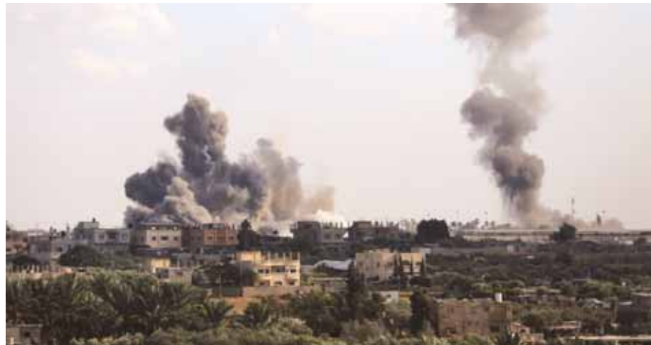
Smoke rises from an explosion caused by Israeli air strikes on the border between Egypt and Rafah, in Gaza Strip

A looming question is whether Israel will launch a