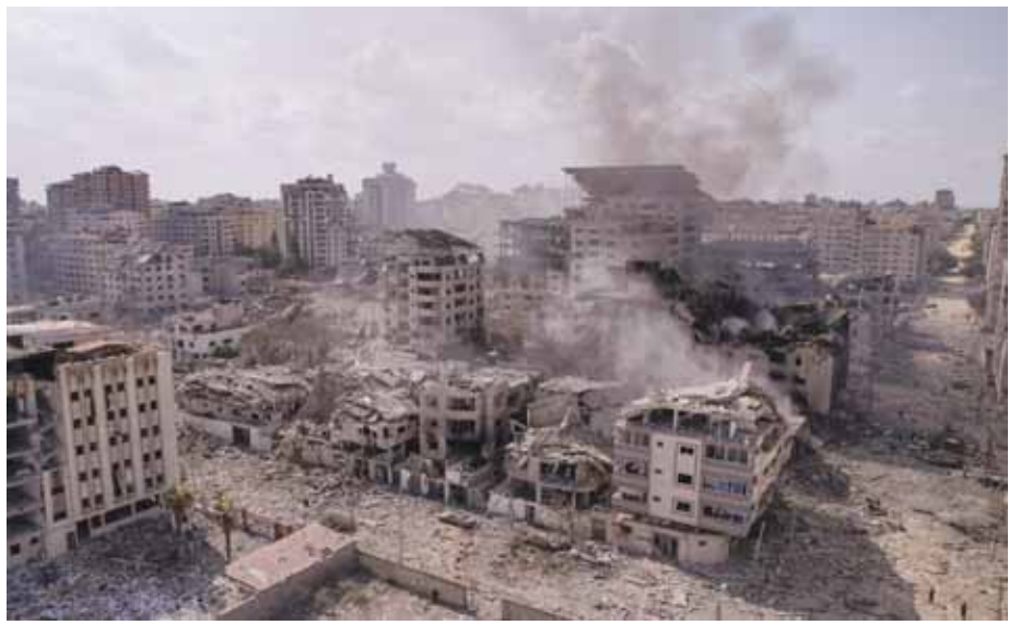
A view of the rubble of buildings hit by an Israeli airstrike, in Gaza City, Tuesday.

"The people who support Hamas are fully responsible for this appalling attack.