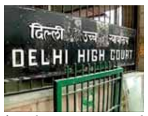
festivals in envisaging and enforcing protective mechanisms, aimed at ensuring safety of students participating or attending the event". "Thus, in view of the afore-noted episode, this Court deems it appropriate to take suo motu cognisance of the issue of security breaches, particularly in respect of female attendees, at the festivals organised by colleges/universities in Delhi-NCR," said the bench, also comprising Justice Sanjeev Narula. The court issued notice to IIT Delhi, IP University and Delhi University and asked them to submit a report indicating their existing policy qua security measures during college festivals held at their premises. With respect to the recent incident at IIT Delhi, the court directed the police here to file a status report in two weeks stating the action taken against the accused.

The Delhi High Court has taken suo motu cognisance of security breaches at college festivals and demanded action by authorities after several female Delhi University students alleged that they were secretly filmed while changing in an IIT-Delhi washroom for a fashion show at the institute's fest. A bench headed by Chief Justice Satish Chandra Sharma, in an order passed on Monday, stated it was imperative that adequate security measures are put in place to allow students to attend such events without any impending fear of experiencing such acts of violation. The court, which earlier also dealt with the incident of alleged sexual harassment of girl students during a cultural festival at the all-women Gargi College of Delhi University in February 2020, observed that "unfortunately" it has been confronted with several cases of student harassment during such festivals. Such "recurrent instances", it said, show the "lackadaisical approach of authorities organising such