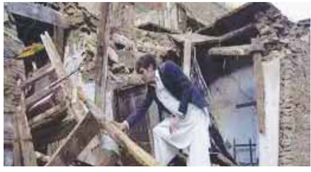
who had joined hundreds of volunteers to help the locals.