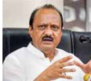
Ajit Pawar speaking at a podium.

Claiming the legacy of late Congress leader YB Chavan whom his uncle Sharad Pawar considers as his mentor, Maharashtra's Deputy Chief Minister Ajit Pawar said on Tuesday that after considering the current political and social situation in the State, he had taken a decision to join the Eknath Shinde-led Shiv Sena-BJP alliance Government on July 2, 2023.