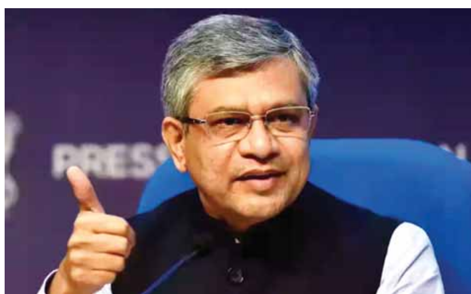
Rajan in a social media post a few months back had raised questions on value addition taking place in electronics manufacturing. The minister said telecom equipment was being imported into the country for a long time, and it was unimaginable to manufacture and export telecom equipment from the country.

for the telecom industry," Vaishnaw said. He was speaking during the virtual inauguration of a production line to manufacture 4G and 5G connectivity modules and data cards for US-based Telit Cinterion by domestic firm VVDN. "Very complex manufacturing has started, and young girls are getting trained in handling complex machines. This is the success of Make in India, and this is the success of our Prime Minister's vision," Vaishnaw said. VVDN is one of the companies shortlisted under the PLI scheme. In a veiled attack on former RBI governor Raghuram Rajan, the minister said critics of "Make In India" should visit VVDN plants to see the depth that the country is acquiring in telecom and electronics manufacturing.