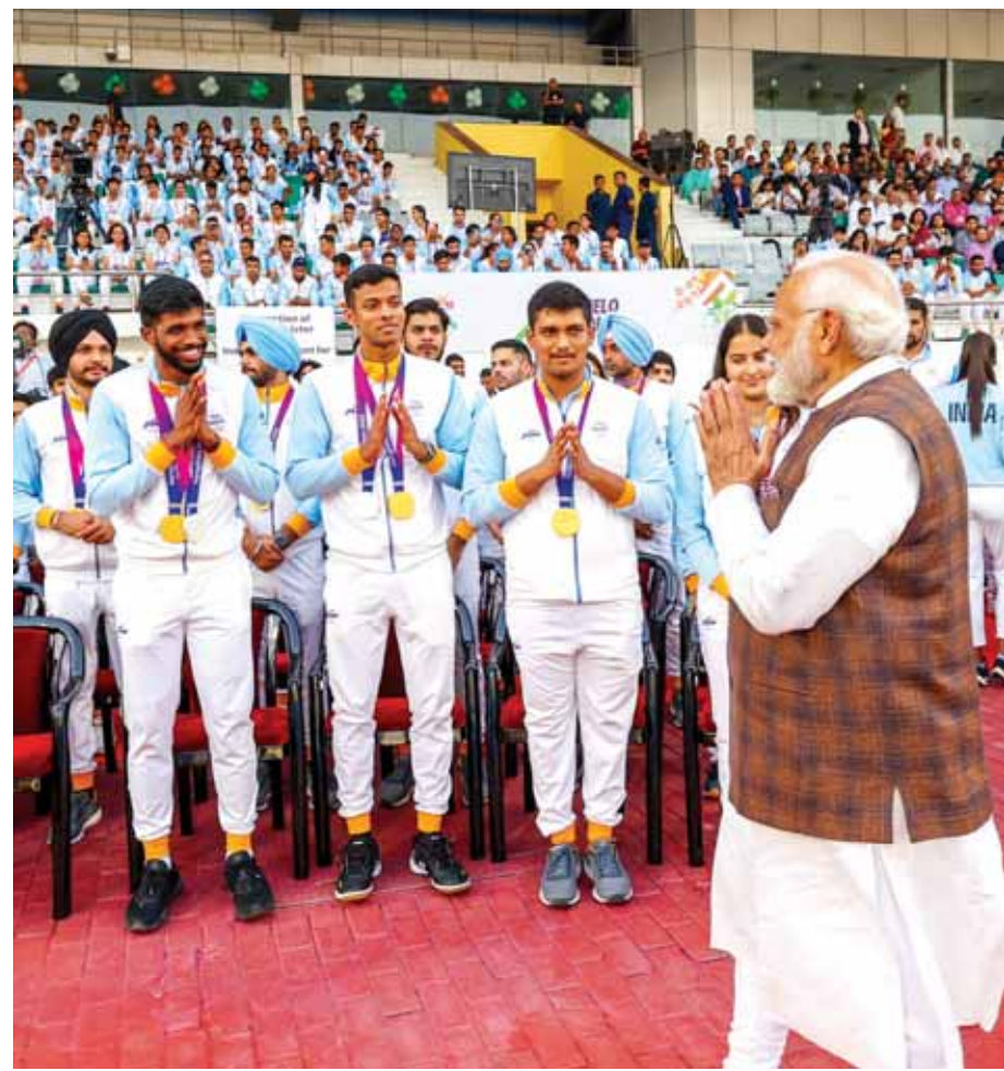
Prime Minister Narendra Modi with hockey players while meeting with Asian Games medal winners at Major Dhyan Chand National Stadium in New Delhi on Tuesday. The Prime Minister assured all possible help to Indian athletes in their endeavour to achieve greater heights and expressed confidence that the country will better its performance in the next edition of the Asian Games. The Indian athletes produced their best-ever performance at the continental games, bringing home 107 medals, including 28 gold as the country finished fourth on the medals table. (Report on Page 4) PTI

In a way, Chabad House is a community centre for the Jewish community, where they are provided all kinds of help and facilities. Be it children's education, employment or helping the elderly. Programmes like special classes, workshops, lectures are organised at Chabad House for Israelis and Jews. Lectures are also given on religious subjects.