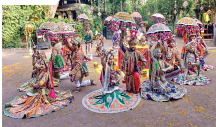
People in traditional attire during rehearsals for 'Garba', ahead of the upcoming Navratri festival, in Ahmedabad.