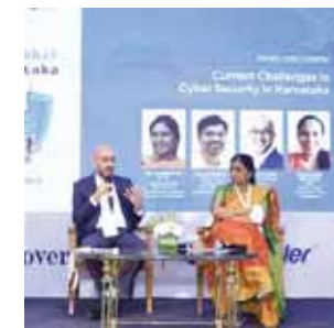
Testing, Network Protocols and Data Flows and Digital Forensics.

As cyber is gaining importance in all spheres and may pose a security threat, the Government has organized a 12-day hybrid exercise ending October 20 to train senior management and technical personnel of Government, critical sector organizations and public and private agencies on contemporary cyber threats and handling cyber incidents and response.