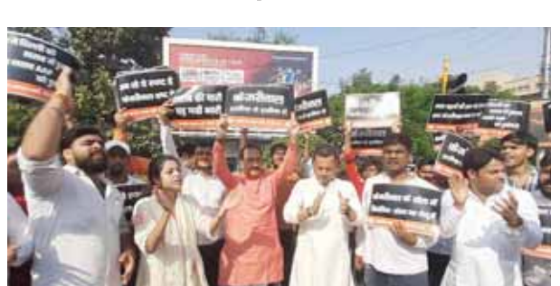
Bhari, Ab tou Yeh Spasht Hai Kejriwal Bhrasat Hai. Delhi BJP president Virendra Sachdeva, attended a demonstration at ITO and said the real face of AAP and Kejriwal has been "exposed". Citing an Enforcement Directorate (ED) raid on AAP MLA Amanatullah Khan's residence early on Tuesday, Sachdeva said, "AAP is a family of the corrupt and Kejriwal will also go to jail like other leaders of his party." Sachdeva said that after the raid on Amanatullah Khan's house,

The national Capital on Tuesday witnessed protests and counter protests by the AAP and the BJP over the excise policy scam. The BJP's Yuva Morcha held demonstrations at 31 locations in Delhi under a campaign against alleged corruption of the Arvind Kejriwal government while the AAP workers held a demonstration on the DDU Marg to protest the Enforcement Directorate's action against its leaders. The BJP's Yuva Morcha protesters assembled at major intersections and other prominent locations with placards bearing slogans against the AAP government's alleged corruption, including the "liquor scam". Under the campaign, youth workers stood at various places carrying placards on which slogans were written like - Sharab ki Yaari Paad Rahi