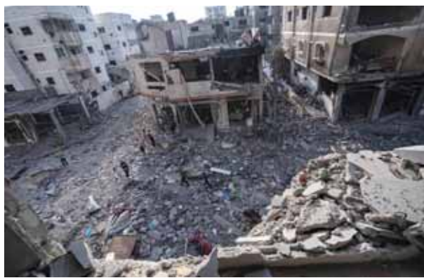
Palestinians walk through the destruction by Israeli bombing in Gaza City on Wednesday.

AP ■ JERUSALEM Israeli air strikes on Wednesday smashed entire Gaza Strip neighbourhoods to rubble and left unknown numbers of bodies beneath mounds of debris. The bombardment raged on even though Hamas militants are holding an estimated 150 people snatched from Israel — soldiers, men, women, children and older adults.