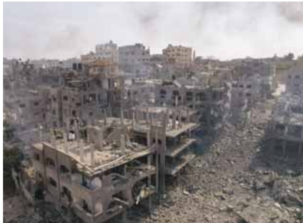
A view of the rubble of buildings hit by an Israeli airstrike, in Jabalia, Gaza strip, Wednesday.