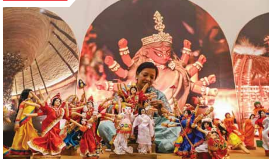
An artist gives final touches to the miniature idols of Goddess Durga at an exhibition 'Durga Puja Art-2023,' in Kolkata