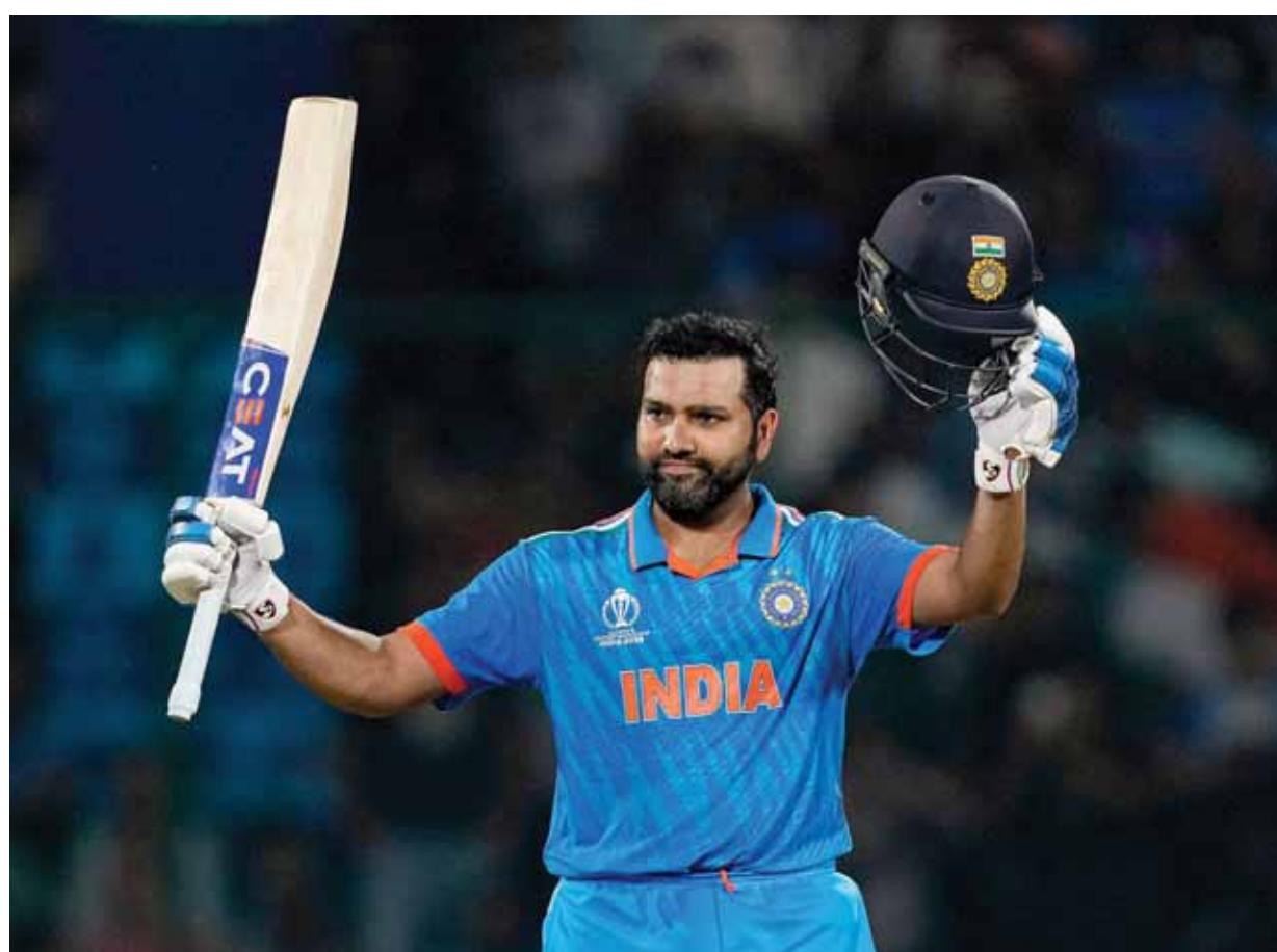
Captain Rohit Sharma celebrates his century during the ICC Men's Cricket World Cup 2023 match between India and Afghanistan at Arun Jaitley Stadium in New Delhi on Wednesday. India skipper Rohit (131 off 84) was unstoppable and flaunted his enviable range of strokes. His record seventh World Cup hundred off 63 balls helped India gun down the target in 35 overs, giving a big boost to their net run rate ahead of their fixture against archrival Pakistan on October 14.

Brief Score: Afghanistan: 272 for 8 in 50 overs (Hashmatullah Shahidi 80, Azmatullah Omarzai 62; Bumrah 4/39). India: 273 for 2 in 35 overs (Rohit Sharma 131, Virat Kohli 55 not out, Ishan Kishan 47; Rashid Khan 2/57).