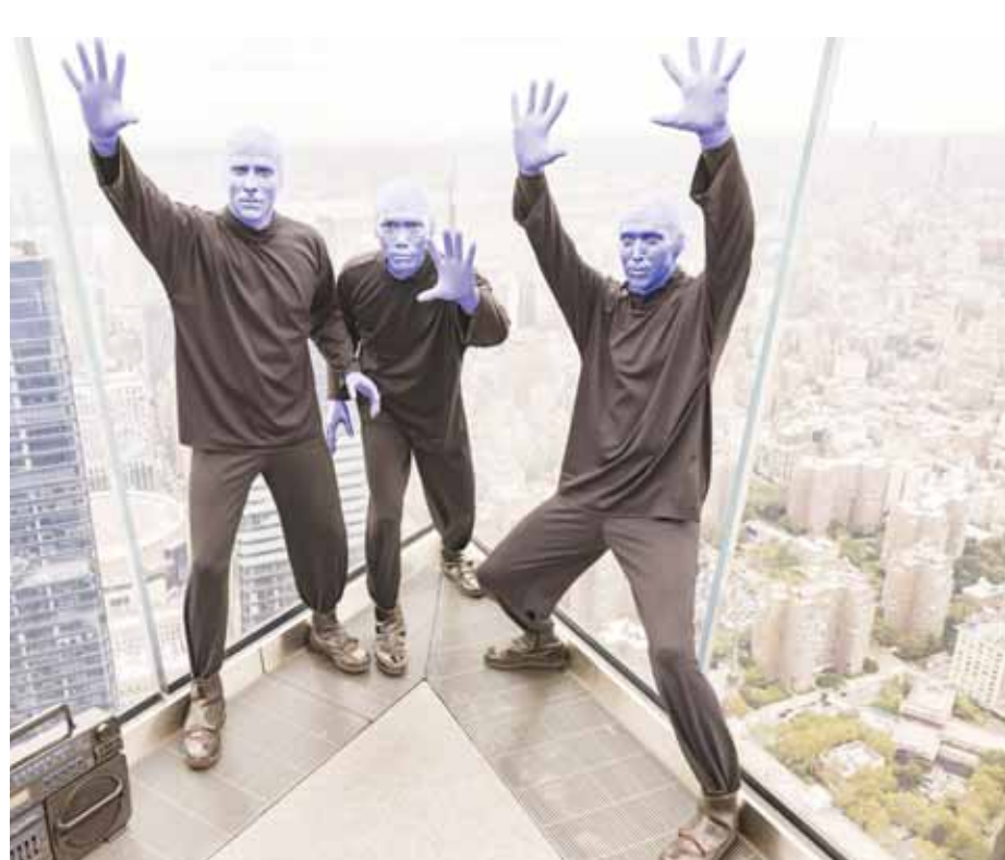
Blue Man Group appears at Edge New York to celebrate 17,000 performances on Tuesday in New York.

Stones from seven different countries, including India, Bulgaria, Italy, Greece and Turkey were used in the temple construction.