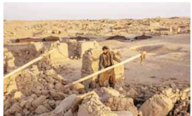
A man cleans up rubble after an earthquake in Zenda Jan district in Herat province, western Afghanistan, Wednesday.

It also flattened all 700 homes in Chahak village, which was untouched by the tremors of previous days. There are mounds of soil where dwellings used to be. But there were no deaths initially reported in Chahak because people have taken shelter in tents this week, fearing for their lives as tremors