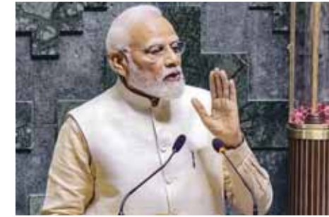
PIONEER NEWS SERVICE ■ NEW DELHI

Prime Minister Narendra Modi will inaugurate on Friday the meeting of Presiding Officers of Parliaments of G20 member nations that will deliberate on critical global issues such as gender equality and transforming lives through public digital programmes. Lok Sabha Speaker Om Birla will kick-start the three-day summit on Thursday by chairing a Parliamentary Forum on LiFE (Lifestyle for Environment), a movement proposed by Modi to advocate sustainable lifestyles to safeguard the environment. The Parliamentary Forum on LiFE will bring together parliamentarians from G-20 nations, along with invited countries and international organizations, to deliberate on strategies for advancing sustainable lifestyles and combating climate change, a Lok Sabha Secretariat state-