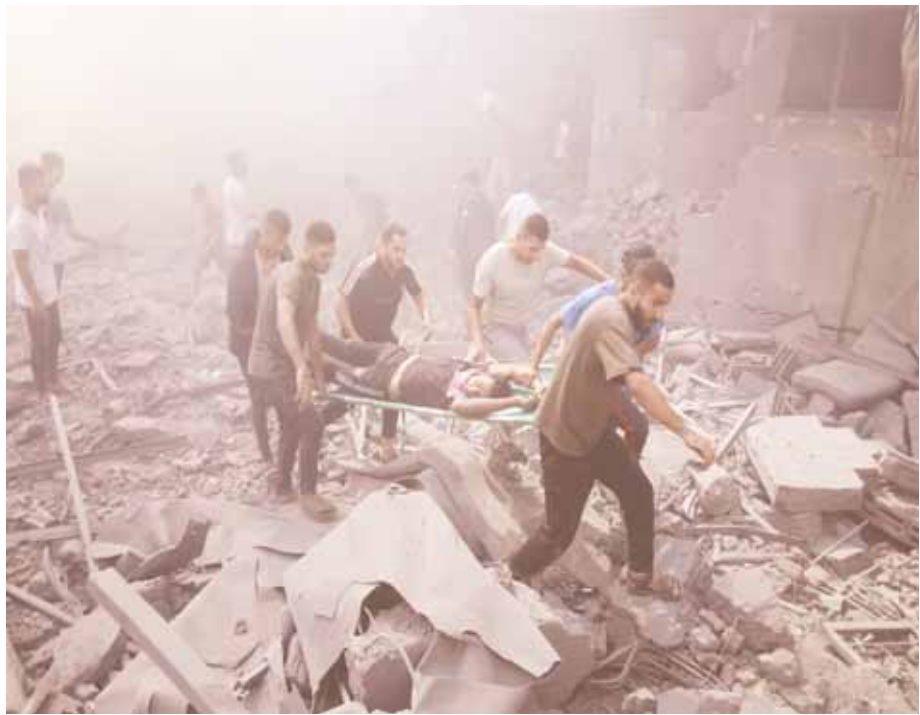
Palestinians evacuate wounded after an Israeli airstrike in Rafah refugee camp, southern Gaza Strip on Thursday.