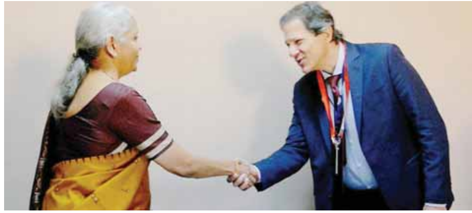
Finance Minister Nirmala Sitharaman (left) and Brazilian Minister of Economy Fernando Haddad (right) shake hands after their meeting in New Delhi.