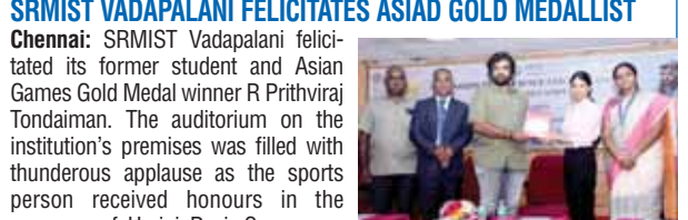
A group of people at a felicitation ceremony, honoring a gold medalist.