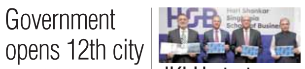
Officials in a meeting, likely related to the city gas bid round.