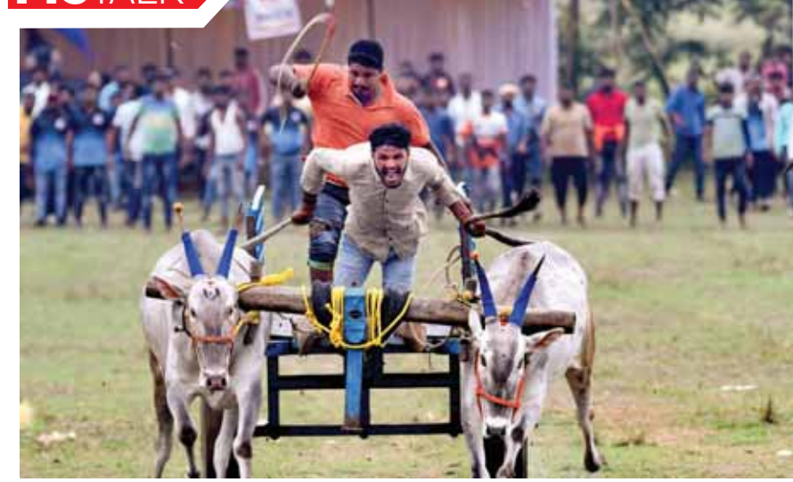
Participants at a state level bullock cart race at Hiremagalur near Chikmagalur