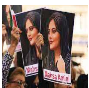
Mahsa Amini, the 22-year-old Kurdish-Iranian woman who died in police custody in Iran last year, sparking worldwide protests against the country's conservative Islamic theocracy...