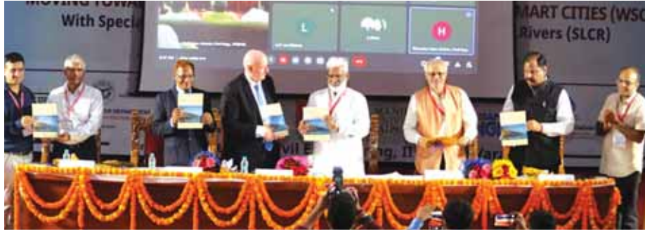
UP Jal Shakti Minister Swatantra Dev Singh at inaugural function of a conference on river health in Varanasi on Friday.

Uttar Pradesh Jal Shakti Minister Swatantra Dev Singh praised the achievements of the current government in managing the currently available water resources of the nation. He was addressing the inaugural function of three-day 3rd international conference on River Health: Assessment to Restoration (RHAR), 2023, with a Special Session on Indo-Danish Smart Laboratory on Clean Rivers (SLCR), being organised under the auspices of Indian Institute of Technology (Banaras Hindu University) at Swatantrata Bhawan in BHU here on Friday. The minister talked about the need and importance of education in nation and how it can benefit the country in achieving sustainable goal in future. Singh gave some key points by which citizens can have a more harmonious approach towards each other. Speaking as the guest of