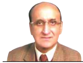
K S TOMAR

Assembly polls outcome in five states may impact 2024 Lok Sabha polls as it would reveal if the strategies employed by the political parties worked to their advantage