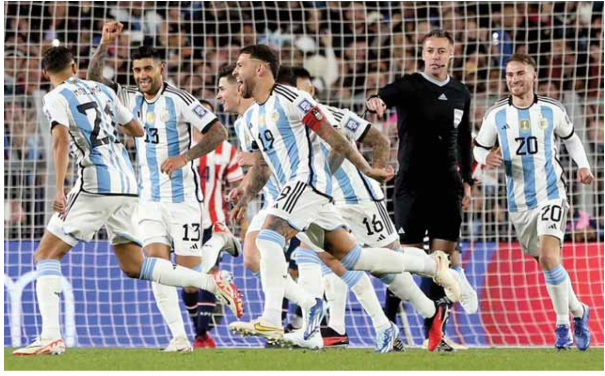
The next round will offer the following matchups: Peru vs. Argentina, Uruguay vs. Brazil, Ecuador vs. Colombia, Paraguay vs. Bolivia and Venezuela vs. Chile. ARGENTINA 1, PARAGUAY 0 The only goal of the match at the Monumental de Nunez Stadium came in the third minute after a corner kick that found Nicolás Otamendi free from marking in the penalty box. The defender smashed the ball into the net with a left-foot volley. The 36-year-old Messi has felt muscular pains in his right leg that have sidelined him for several matches at his club Inter Miami. Coach Lionel Scaloni picked Nico Gonzalez as his replacement. The star substituted Julian Alvarez in the 52nd minute.

AP ■ SAO PAULO Lionel Messi hit a post twice after he came off the bench but struggled to deliver a strong performance following his return from injury. Still, Argentina beat Paraguay 1-0 in a South American World Cup qualifying match. But Argentina's biggest South American rival left the pitch to some jeers at Cuiabá, Brazil after the home side and Venezuela drew 1-1. The result put pressure on new Brazil coach Fernando Diniz and kept Argentina as the sole leaders of the round-robin competition with their third victory in three matches. The next World Cup in the United States, Mexico and Canada is expanding to a 48-team format, meaning direct entry to the top six teams in South America. The seventh-place team will contest an intercontinental playoff for a berth. Argentina leads South American World Cup qualifying with 9 points, followed by Brazil (7), Colombia (5), Uruguay (4), Chile (4), Venezuela (4), Ecuador (3), Paraguay (1), Peru (1), and Bolivia (0). All 10 teams will play the fourth round on Tuesday.