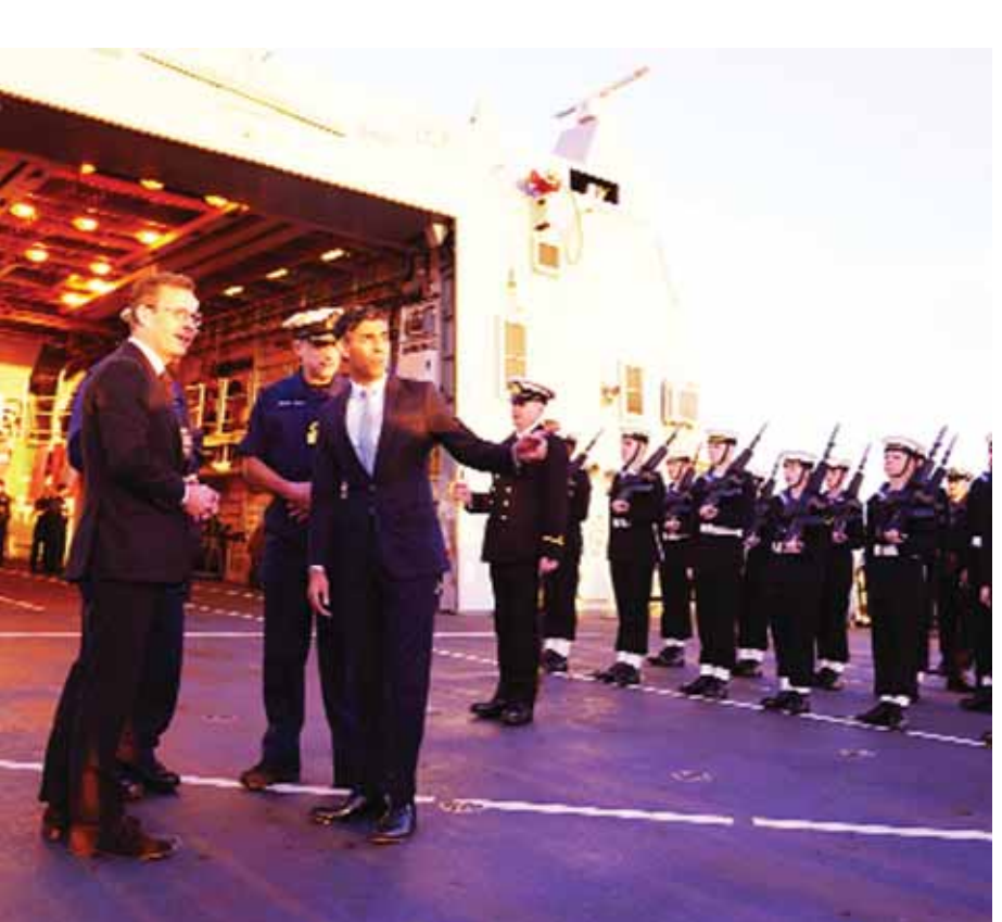
Britain's Prime Minister Rishi Sunak, centre left, welcomes Swedish Prime Minister Ulf Kristersson, left, aboard HMS Diamond before holding bilateral talks ahead of the Joint Expeditionary Summit (JEF) on the Baltic island of Gotland, Sweden, on Friday

Beijing (AP): The European Union's top foreign policy official warned Friday that public sentiment in Europe could turn more protectionist if the region's trade deficit with China is not reduced.