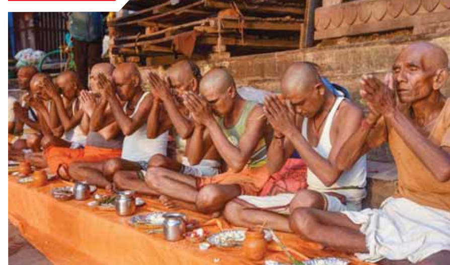
Devotees perform 'Tarpan' rituals at the bank of River Ganga during the 'Pitru Paksha', in Varanasi