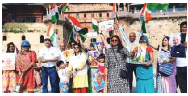
Ganga aarti being performed in Varanasi on Friday for India's win over Pak in World Cup cricket

The activists of Namami Gange, who inspire the people for the cleanliness of river Ganga every day, performed Ganga aarti near the Ganga Dwar of Shri Kashi Vishwanath Dham (corridor) for the victory of Indian team over Pakistan in the World Cup Cricket scheduled to be played on Saturday in Ahmedabad. Carrying the national flag with the pictures of Bharat Mata, cricket kits, bats, helmets, pads, gloves etc, they prayed for the thumping victory of the Indian team over Pakistan. They also raised slogans like