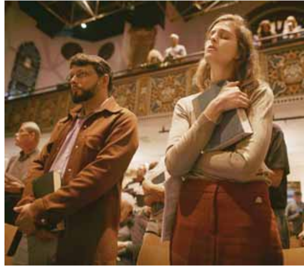
Jews pray during a communal prayer to honor and offer support for the victims in Israel at B'nai Jeshurun Synagogue on Thursday in New York.