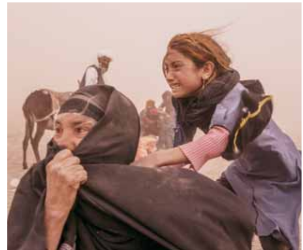
An Afghan girl and woman receive aid, while they are scared and crying from the fierce sandstorm, after an earthquake in Zenda Jan district in Herat province, western of Afghanistan on Thursday. Another strong earthquake shook western Afghanistan on Wednesday morning after an earlier one killed more than 2,000 people and flattened whole villages in Herat province in what was one of the most destructive quakes in the country's recent history.