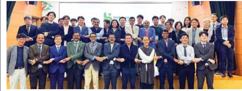
BHU Ayurveda Faculty team in South Korea recently.