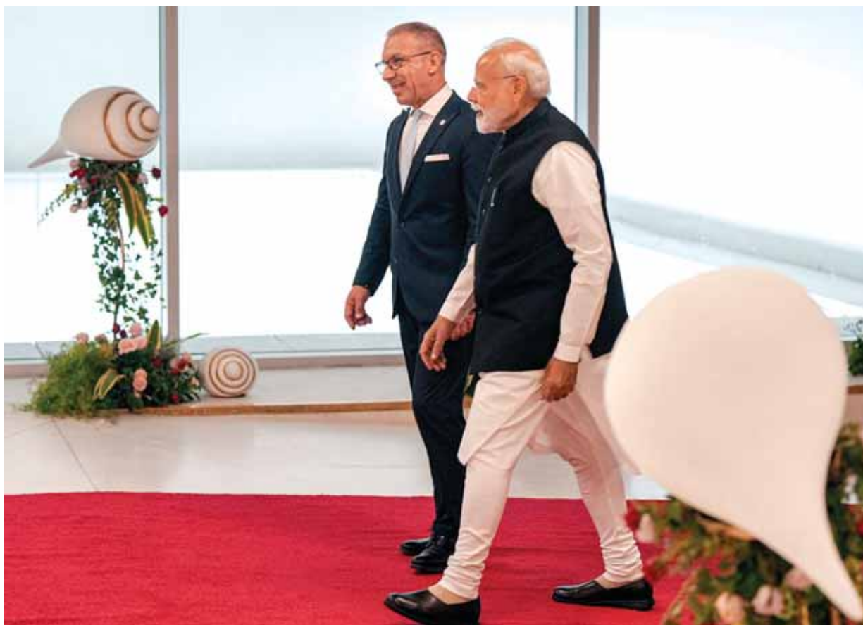
Prime Minister Narendra Modi with President of the Inter-Parliamentary Union Duarte Pacheco arrives for the inauguration of the 9th G20 Parliamentary Speakers' Summit (P20) at Yashbhoomi Convention Centre in New Delhi on Friday

ism is for the world. Terrorism, wherever it may be, for whatever reason, in whatever form, is against humanity. In such a scenario, we will have to adopt a tough approach in dealing with terrorism," he said. Modi lamented that there is no unanimity on the definition of terrorism even in the United Nations. "Everyone is aware of what is happening in various parts of the world. The world is grappling with conflicts and confrontations. Such a world full of conflicts and confrontations is not in anyone's interest. A divided world cannot provide solutions to the big challenges before humanity. Today also, in the UN, the international convention on combating terrorism is waiting for consensus," the PM said in his address at the newly constructed Yashbhoomi Convention Centre in the national Capital. Modi said Parliaments and representatives across the globe will have to think about how they can work together in this fight against terrorism. The PM also underlined that there can be no better medium than public participation to deal with the world's challenges. Modi called for looking at the world with the sentiment of one earth, one family, one future. The thematic session at the P20 Summit is focussed on four subjects of transformation in people's lives through public digital platforms, women-led development, accelerating