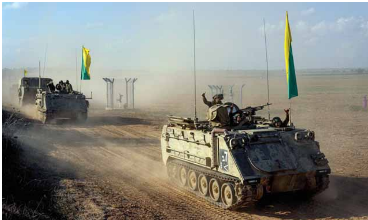
Israeli armored personnel carriers head toward the border with the Gaza Strip in southern Israel