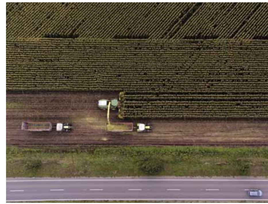
A harvesting machine mows down rows of corn in fields near Dingelstaedt, Germany, on Monday