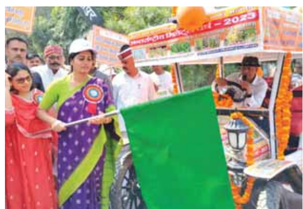
Union Minister of State for Commerce and Industry Anupriya Patel flagging off the millet awareness rally at Vikas Bhawan on Sunday

Flagging off the awareness rally taken out by the Agriculture department the minister appealed to farmers to