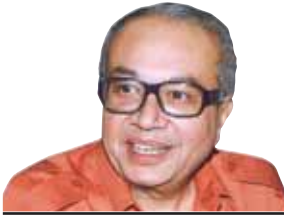
PROF. PRAFULL GORADIA

Religiosity woven into war has the automatic effect of rendering the ensuing bloodshed all the more bitter. The results are devastating