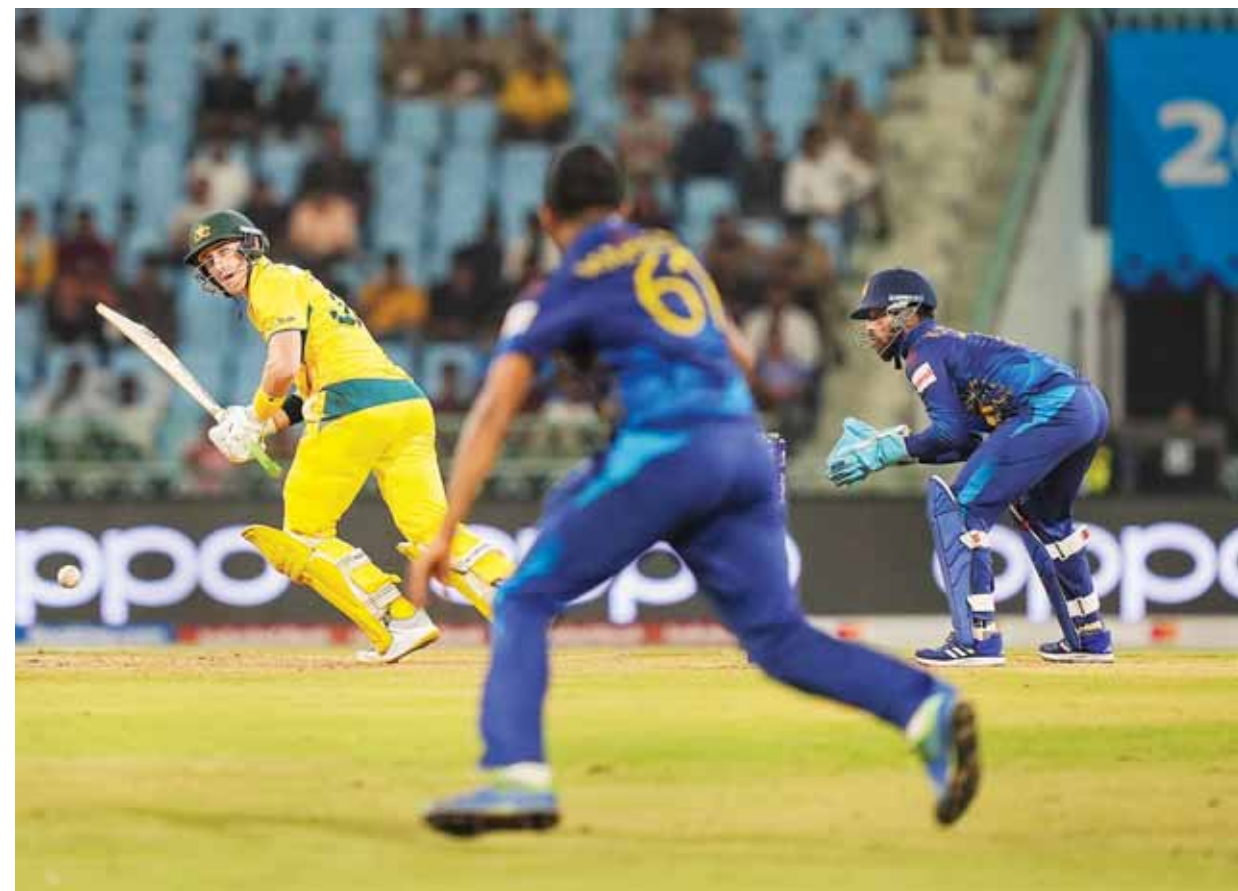
Australia's batter Marnus Labuschagne plays a shot during the ICC Men's Cricket World Cup 2023 match between Sri Lanka and Australia at Bharat Ratna Shri Atal Bihari Vajpayee Ekana Cricket Stadium in Lucknow on Monday. Australia beat Sri Lanka by five wickets in their ICC World Cup match here on Monday. Sent in to bowl, Australia dismissed Sri Lanka for 209 in 43.3 overs and then returned to overhaul the target in 35.2 overs, scoring 215 for five in a match that was briefly interrupted by rain. This was Australia's first win of the ongoing tournament.

The RRTS trains have been designed with an aerodynamic profile, featuring long noses and plug-in doors to minimize air resistance at higher speeds. Passengers will relish panoramic views through expansive window panes, enhancing their travel experience.