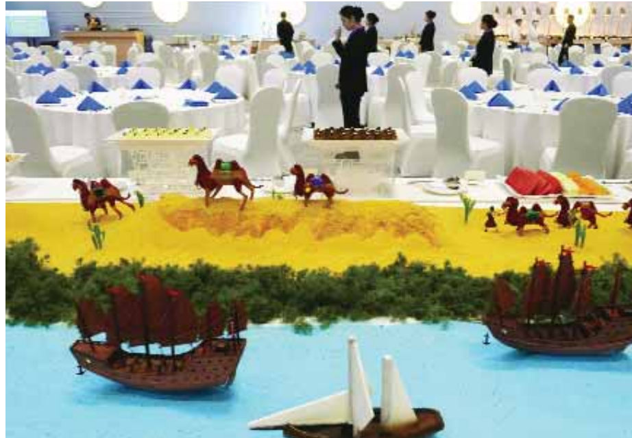
Waitresses prepare for meal time at the media center near a display depicting China's Silk Road during the Third Belt and Road Forum held at the China National Convention Centre in Beijing, on Monday

"Our own ideas on the development of the Eurasian Economic Union, for example, on the construction of a Greater Eurasia, fully coincide with the Chinese ideas proposed within the framework of the Belt and Road Initiative," he told Chinese state broadcaster CCTV, according to a transcript posted on the Kremlin website.