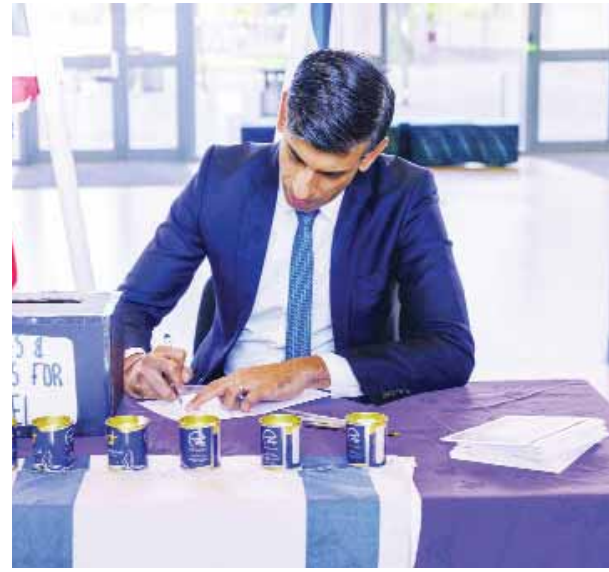
Britain's Prime Minister Rishi Sunak signing messages and prayers for Israel during a visit to a school in north London, England Monday.

"I stand with all of you, the Jewish community, not just today, tomorrow but always, and I really mean it. Like many of you, I am different; I come from a different background, and our society is strongest when that diversity is respected. There are people who are trying to stir up hatred and division, and I will always strive very hard to protect that diversity," he said.