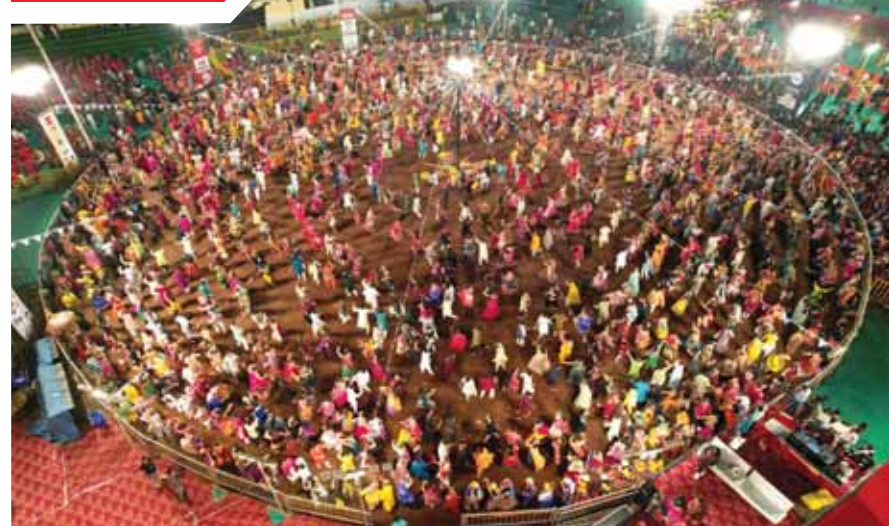
Devotees take part in a 'Garba' performance during nine-day long Navratri festival in Bhopal