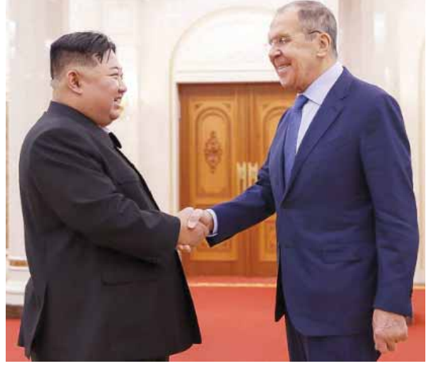
North Korean counterpart, Choe Son Hui, earlier Thursday and lauded deepening bilateral collaboration.