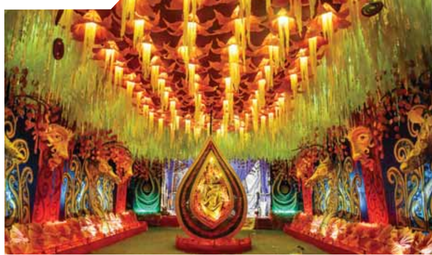
A community 'puja pandal' ahead of Durga Puja festival, in Prayagraj