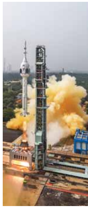
ISRO's TV-D1 test flight of Mission Gaganyaan lifts off from Satish Dhawan Space Station in Sriharikota on Saturday

India on Saturday successfully completed the first unmanned test flight in its ambitious human space flight mission Gaganyaan, less than two hours after the launch was aborted with just four seconds to go for the lift-off. Following the successful launch, Prime Minister Narendra Modi in a post on X, said, "This launch takes us one step closer to realising India's first human space flight program, Gaganyaan. My best wishes to our scientists at ISRO." After some tense moments following a system monitoring anomaly and two weather-related holds, the Indian Space Research Organisation (ISRO) said scientists simulated an abort situation for the Crew Escape System (CES) to carry the Crew Module (CM) out of the test vehicle TV-D1. The module to test the safety of crew in emergency situations descended using parachutes for a splashdown into the Bay of Bengal with planned precision, the space agency said. ISRO chief S Somanath said the crew module has been fully recovered from the sea and it has been brought to Chennai port. "Eastern Naval Command units recovered the Crew Module — a path paved by