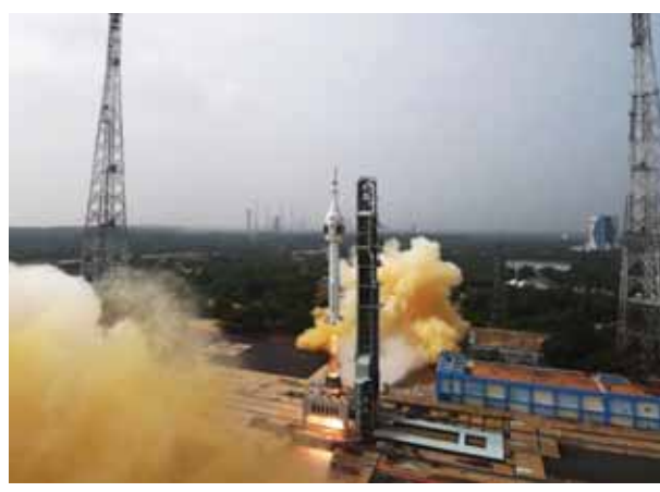
The test vehicle mission was aimed at studying the safety of the crew module and crew escape system in bringing astronauts back to Earth in the eventual mission.

entists at the Mission Control Center. "After the successful launch of the Chandrayaan-3, our nation is ready to take its next giant stride in the realm of space. Today the @isro launched #Gaganyaan's TV-D1 Test Flight into space scripting another remarkable space odyssey," Home Minister Shah said. "My heartfelt congratulations to our scientists and our citizens on this momentous occasion of success and fulfilment," Shah said in a post on X. The Gaganyaan programme aims to send humans into space on a Low Earth Orbit of 400 km for three days and bring them back safely to Earth.