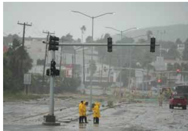
Mexican soldiers and rescue team remove mud and sludge from an avenue flooded by the rains of Hurricane Norma in San Jose del Cabo, Mexico on Saturday.

Residents of Mexico's Los Cabos resorts rushed to prepare as Hurricane Norma headed toward the southern tip of Mexico's Baja California Peninsula for an expected landfall on Saturday, while in the Atlantic, Hurricane Tammy threatened to batter the islands of the Lesser Antilles. Businesses in Cabo San Lucas nailed up sheets of plywood over their windows, and government personnel hung up banners warning people not to try to cross gullies and stream beds after Norma regained strength and once again became a major storm Friday. By early Saturday, Norma had weakened and was downgraded to Category 1 on the hurricane wind scale. It was located just offshore 25 miles west of Cabo San Lucas storm with winds of 85 mph (140