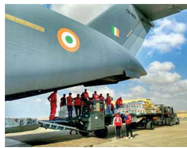
An IAF C-17 flight carrying medical aid and disaster relief material for the people of Palestine before departing for El-Arish airport in Egypt