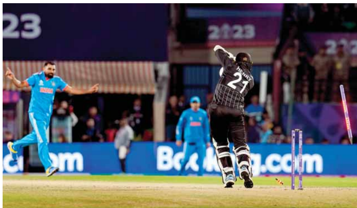
Mohammed Shami celebrates the wicket of New Zealand's batter Matthew James Henry during the ICC Men's Cricket World Cup 2023 match between India and New Zealand at the HPCA Stadium in Dharamshala on Sunday

Rohit looked in ominous touch as he just planted his foot forward and lap-swept Henry to the backward square leg boundary and then followed it up with a six over mid-off two balls later. Rohit was lucky as he was dropped by New Zealand skipper Tom Latham behind the stumps off Mitchell Santner in the next over and he punished the left-arm spinner by tonking him over deep midwicket for a six the very next ball. But Rohit failed to cash in as he dragged a Lockie Ferguson delivery onto the stumps in the next over to end the dangerous-looking 71-run opening stand. Ferguson dealt another blow to India in his next over in the form of Gill, who was caught by Mitchell at deep third-man boundary. Kohli then took the innings forward with the help of Iyer (33 off 29) and KL Rahul (27 off 35). However, two quick wickets of Rahul and Suryakumar Yadav made things little difficult for India before Kohli bailed out the hosts with a 78-run sixth-wicket stand with Jadeja (39 not out). While Rahul fell LBW to Mitchell Santner, Surya was a victim of an unnecessary mix up with Kohli as India slumped to 191 for 5. Kohli, however, failed to match Sachin Tendulkar's record of 49