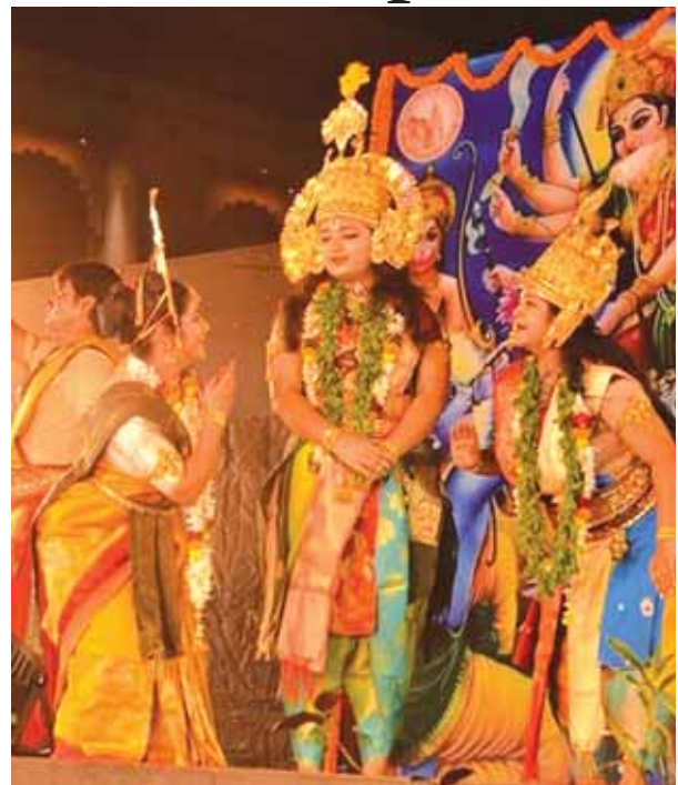
'Ram Ki Shakti Puja' play being staged at Kashi Vishwanath Temple premises in Varanasi on Saturday evening.

On the other hand, a fierce battle is going on under the leadership of Laxman, Hanuman etc, on the other hand the worship of Ram is going on. He had resolved to offer 108 Neelkamals to the Goddess, but the Goddess