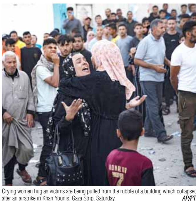
Crying women hug as victims are being pulled from the rubble of a building which collapsed after an airstrike in Khan Younis, Gaza Strip, Saturday.

President Joe Biden said Friday he thought Hamas was motivated to attack Israel in part by a desire to stop that country from normalising relations with Saudi Arabia. "One of the reasons... why Hamas moved on Israel, is because they knew I was about to sit down with the Saudis," Biden said at a campaign fundraiser. The US president indicated that he thinks Hamas militants launched a deadly assault on Oct 7 because, "Guess what? The Saudis wanted to recognise Israel" and were near being able to formally do so. Jerusalem and Riyadh had been steadily inching closer to normalisation, with Biden working to help bring the two countries together, announcing plans in September at the Group of 20 summit in India to partner on a shipping corridor. Israeli Prime Minister Benjamin Netanyahu met with Biden on the sidelines of the UN General Assembly in September and told him, "I think that under your leadership, Mr. President, we can forge a historic peace between Israel and Saudi Arabia."