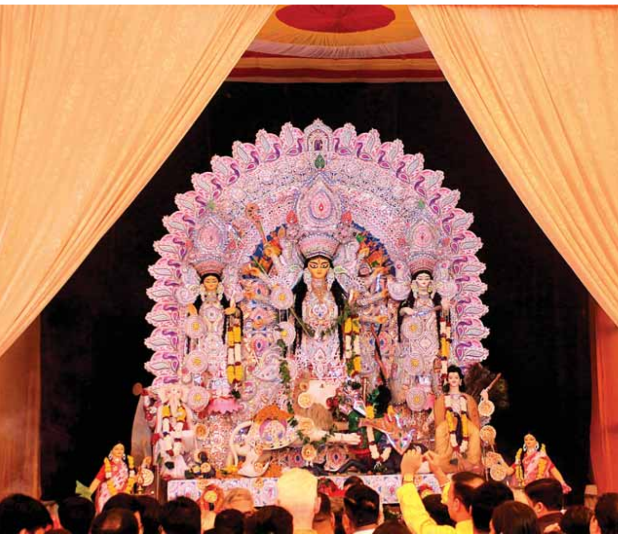
Devotees flock to Kashmir Gate Durga Puja pandal on Sunday. The Durga Puja pandal in Kashmir Gate, which boasts a history spanning over a century, stands as one of the largest and most ancient such installations in the national Capital

hands. "Shami took the opportunity with both hands. He's got class and so much experience and he used the conditions really well," Rohit said. "At one stage NZ put up a big partnership there. Dew came in as well. But we have to give credits to the bowlers in the back end. Good start to the tournament but job is half done." Rohit had nothing much to say on Kohli's masterful knock as the maestro has been doing it for the country time and again. "Nothing much to say about Virat. We have seen him do this for so many years. He backs himself to do the job," said the captain. "Towards the end there was a bit of pressure with a few wickets lost, but Kohli and Jadeja took us home." On his own performance, Rohit, who made 46 off 40 balls at the top of the batting order, said, "Shubman and I compliment each other quite well in the middle. Couldn't get big enough runs ourselves but happy to win." India dropped a few catches in a rare shoddy fielding show but Rohit was not too concerned about it. "Fielding is something we pride ourselves on. It wasn't as clinical as we'd like to. Couple of dropped catches but those guys are good. Jadeja is among the best in the game," he said.