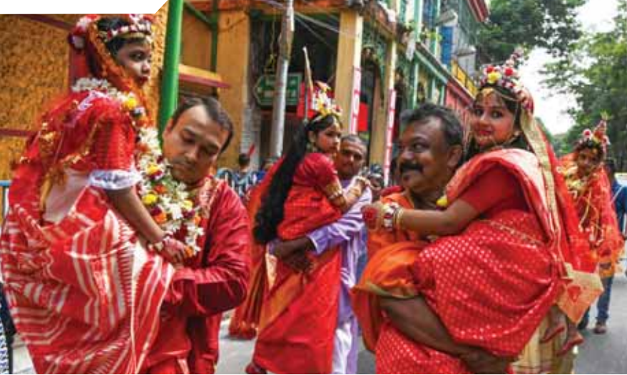
Devotees carry girl children to a puja pandal for 'Kumari Puja' on 'Maha Ashtami' of the Durga Puja in Kolkata