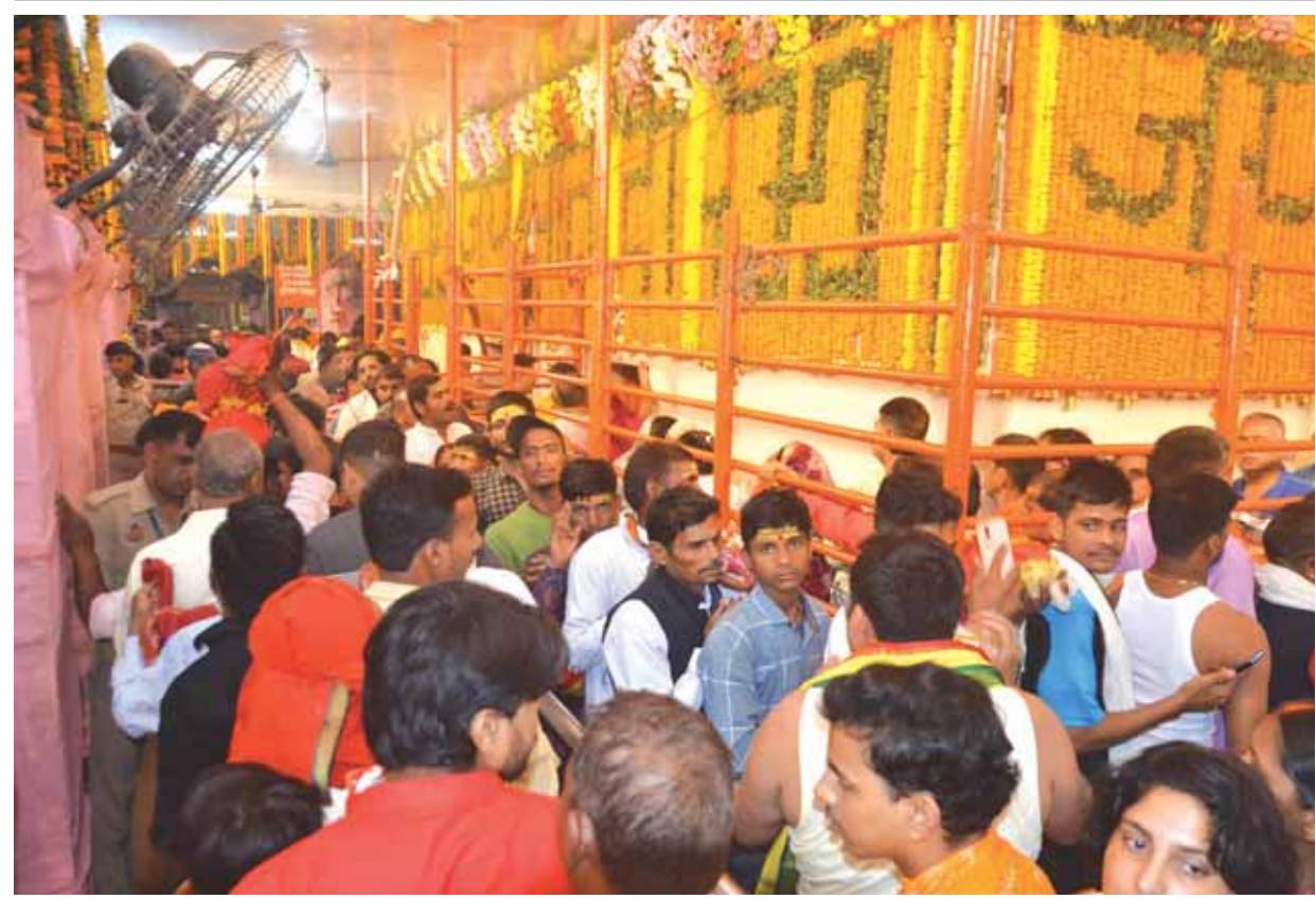
Devotees wait in queues to offer prayers at Vindhyaasini temple on the occasion of 'Maha Ashtami' during Navratri festival, in Mirzapur on Sunday

The faces of students lit up after receiving the smart phones. The scheme was started by UP CM Yogi Adityanath this year.