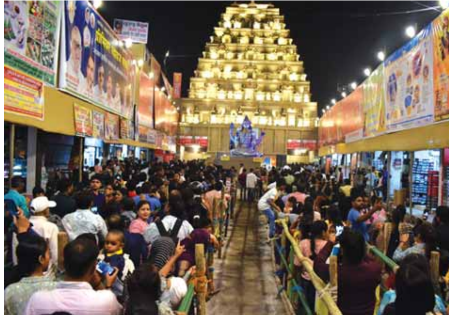
Heavy rush of people thronging Durga Puja pandal at Hathua Market in Varanasi on Sunday evening.

The rush was mainly seen in Lahurabir, Sigra, Luxa, Godowlia, Sonarpura, Bhelupur, Maidagin and many areas in the trans-Varuna area including Shivpur, Pandeypur, Orderly Bazar, Pahadiya and some others. In many pandals, all the traditional rituals were performed by the puja samiti members. The Bangiya Samaj, which generally gives its major focus on its idols, performed all their rituals with traditional gaiety. At many pandals, on the beat of nagaras, the people were seen dancing to please the Goddess of Shakti (strength). At several places, Kanya Puja programmes were also organised. At Ramakrishna Mission, a girl decorated as Goddess was offered prayers as per the tradition and then the people sought her blessings. At several places, bhajans and other