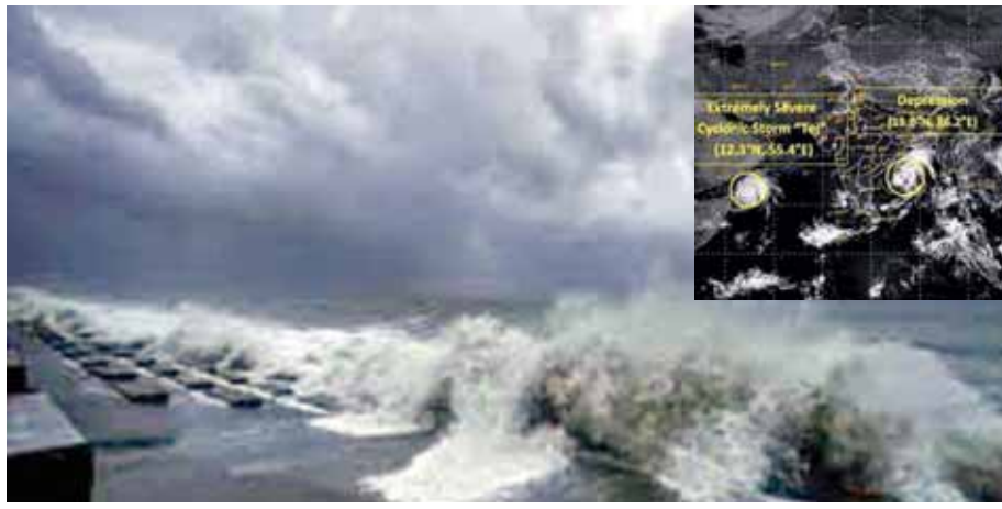
which formed in the Arabian Sea in June and initially moved in a north-northwest direction before changing course to make landfall between Mandvi in Gujarat and Karachi in

the Yemen-Oman coasts. The cyclonic storm is predicted to move northwards and cross the Yemen-Oman coasts between Al Ghaidah (Yemen) and Salalah (Oman), close to the east of Al Ghaidah in the early hours of October 25 as a very severe cyclonic storm with wind speeds of 115-125 kmph, gusting to 140 kmph. The last cyclone to make landfall in this region was Cyclone Mekunu, over 5 years ago in 2018. However, meteorologists caution that at times, storms may deviate from the predicted track and intensity, as seen in the case of cyclone Biparjoy,