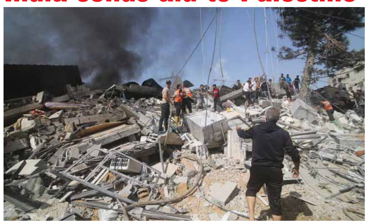
Palestinians look for survivors of the Israeli bombardment of the Gaza Strip in Rafah on Monday

including some 2,000 minors and around 1,100 women, have been killed, Ashraf al-Qidra, a