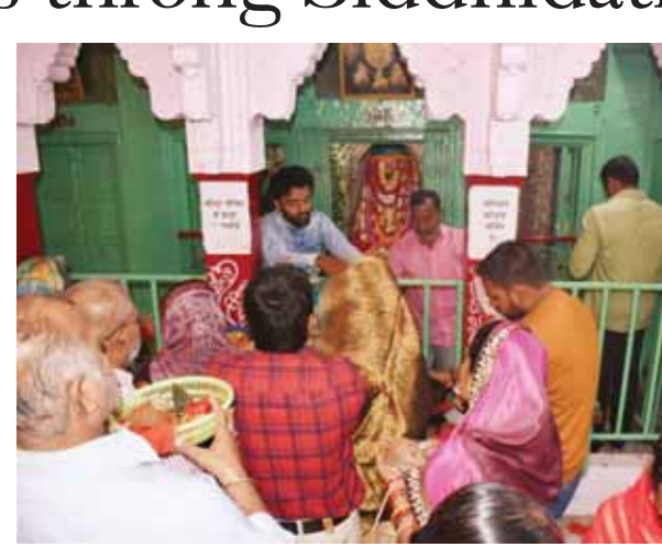
Devotees offering prayers at Siddhidatri Temple on the occasion of Navami in

Besides, heavy rush was also seen throughout the day at Durga Mandir (Durga Kund) as usual. Due to rush, several