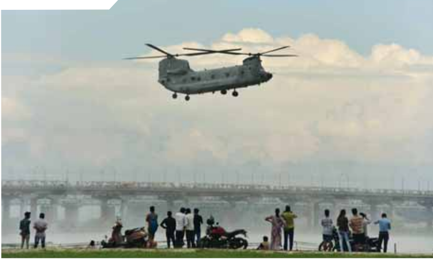
Fighter jets fly over Sangam area during a rehearsal ahead of the upcoming 91st Air Force Day in Prayagraj