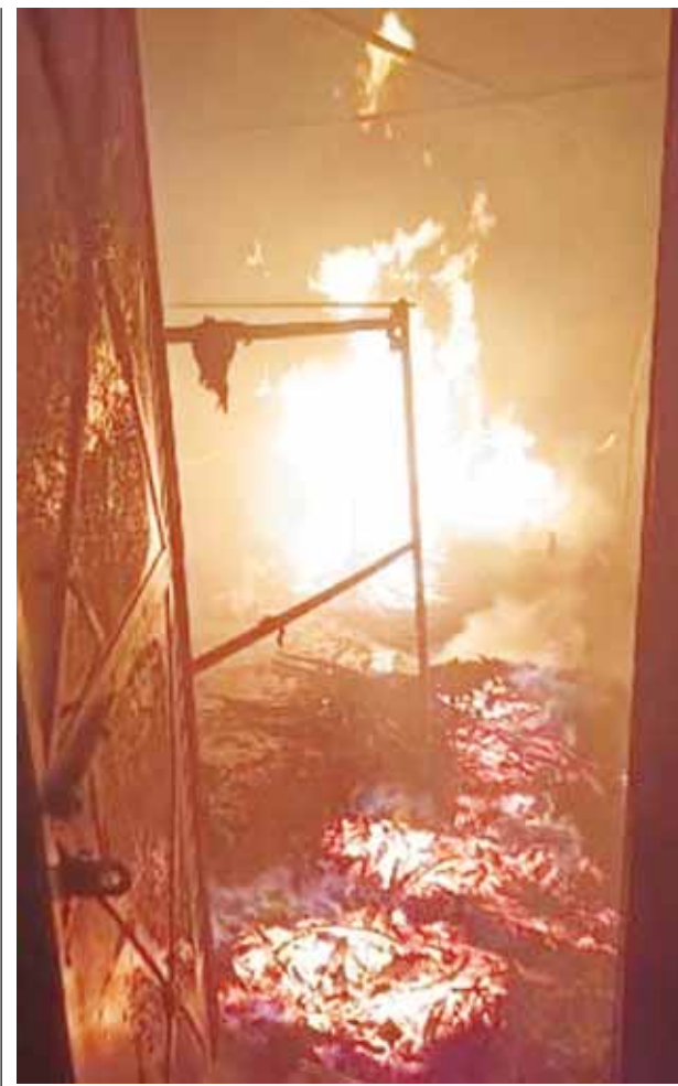
Flames leaping high after a fire broke out at a seawain manufacturing factory near Ring Road police outpost in Thakurganj on Thursday