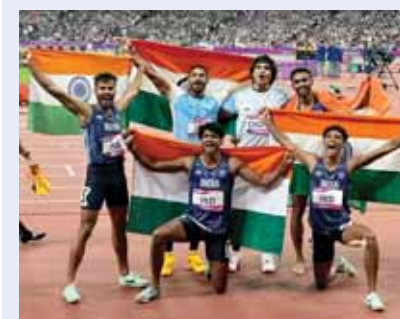
The will to be progressive helped the Indian Juggernaut roll on and cross the platinum jubilee (the 75 magic figure). Till now, in

Asiad-2023 (at Hangzhou), India has won 76 medals (16 gold, 28 silver, 32 bronze), the largest ever in an ASIAD outing, ranking fourth out of 45 participating nations. (The 2018 Jakarta record of 70 medals is now a thing of the past). Indians have often proved that where there is a will, there is a way.