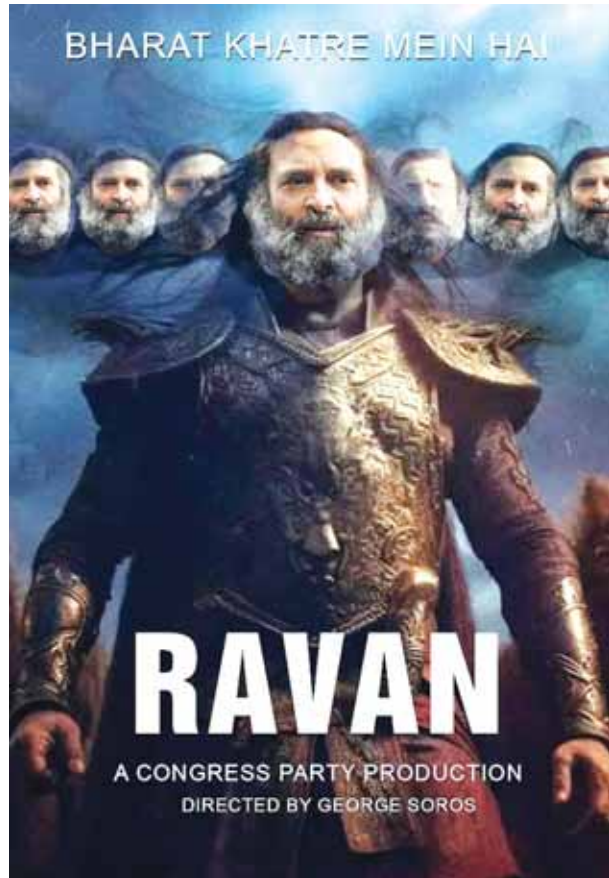
BJP shared the poster of Congress leader Rahul Gandhi on social media

As the battle lines between the two main parties get drawn