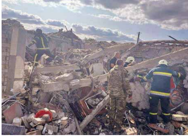
In this photo provided by the Ukrainian Presidential Press Office, emergency workers search the victims of a Russian rocket attack that killed at least 49 people in the village of Hroza near Kharkiv, Ukraine on October 5, 2023.

The UK Foreign Office cited intelligence suggesting that Russia may lay sea mines in the approach to Ukrainian ports to target civilian shipping and blame it on Ukraine. "Russia almost certainly wants to avoid openly sinking civilian ships, instead falsely laying blame on Ukraine for any attacks against civilian vessels in the Black Sea," it said, adding that the UK was working with Ukraine to help improve the safety of shipping. Speaking in Granada, Zelensky emphasized the need