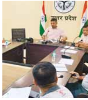
PIONEER NEWS SERVICE ■ KANPUR