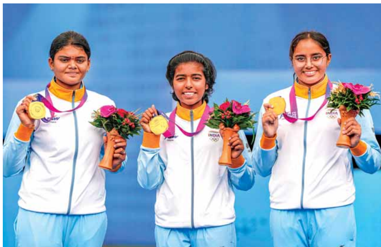
Jyothi Surekha Vennam, Aditi Gopichand and Parneet Kaur pose with their gold medal during the presentation ceremony of team compound archery event at the 19th Asian Games in Hangzhou in China on Thursday

India has confirmed at least five medals in archery at the continental showcase as