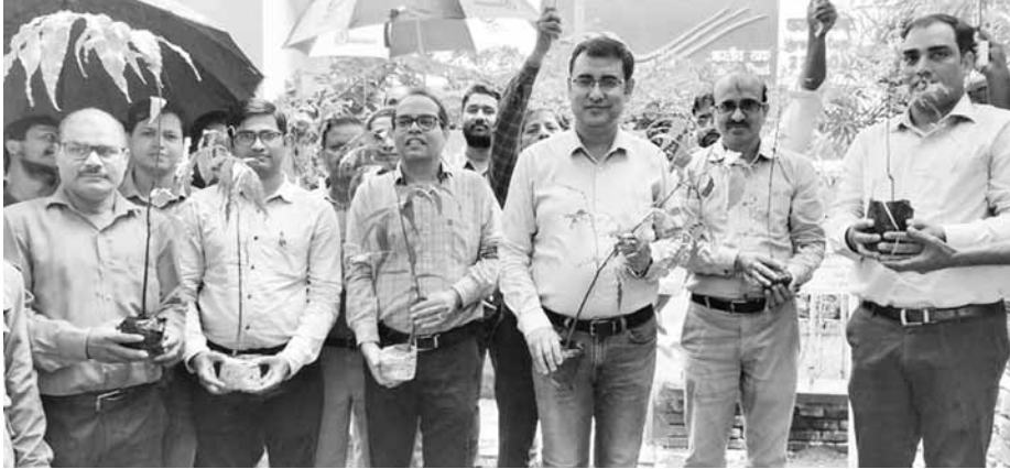
PMG KK Yadav launching a special cleanliness campaign 3.0 in Varanasi on Monday.

He also gave a call for active participation in the cleanliness campaign, which will run till October 31. He also delivered the message of environment protection by planting saplings of Rudraksha, Aawala and Ashoka in the Head Post Office premises