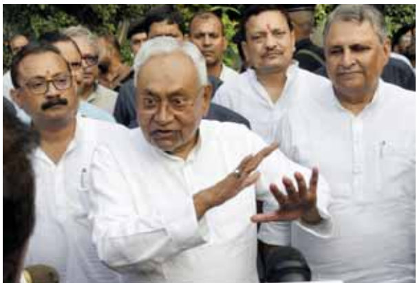
Bihar Chief Minister Nitish Kumar speaks with the media regarding the caste-based census report in Patna on Monday

The Opposition BJP, however, voiced dissatisfaction with the caste survey, stressing that it did not give an idea of the