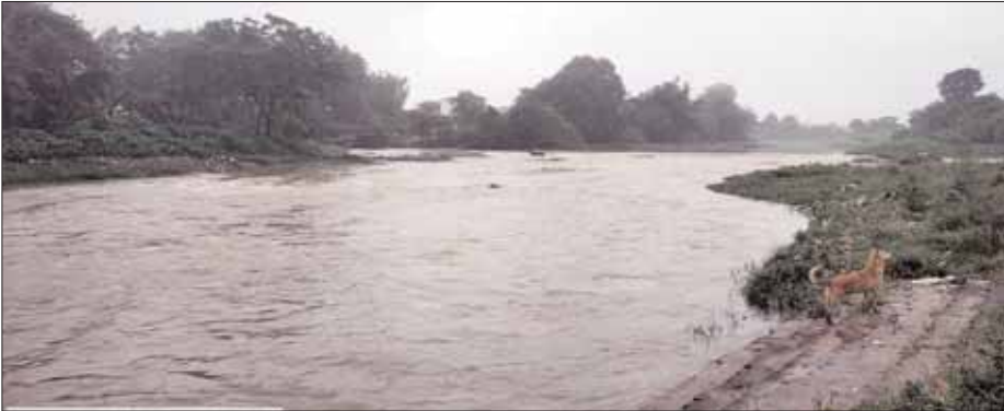
Swollen Swarnrekha river after heavy rainfall, in Ranchi on Monday.

The Meteorological Department has issued an