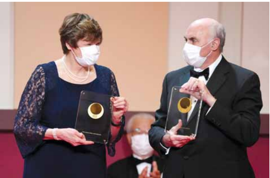
The Nobel Prize in medicine has been awarded to Hungarian-American biochemist Katalin Kariko and American physician-scientist Drew Weissman for enabling development of mRNA COVID-19 vaccines. In the photo above, Katalin Kariko, left, and, Drew Weissman pose with their trophies during the Japan Prize presentation ceremony in Tokyo on April 13, 2022