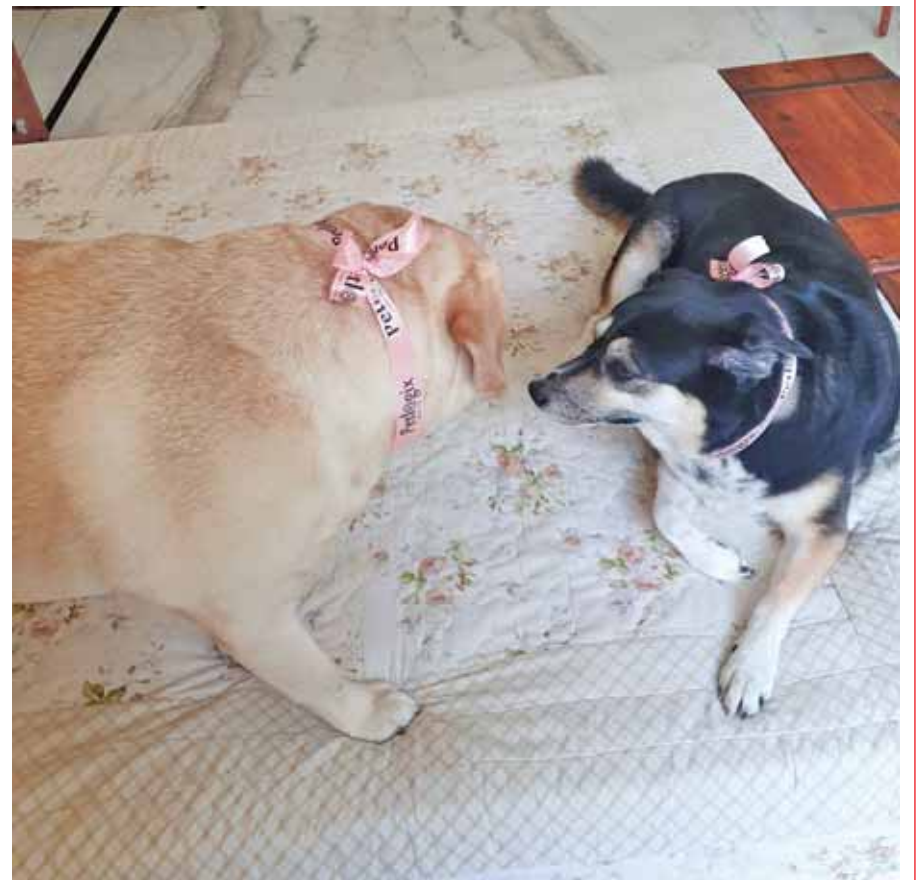
People from different walks of life participated in a rally to raise voice against cruelty to animals at Jantar Mantar on the eve of the birth anniversary of Mahatma Gandhi. During the rally, signatures for a petition addressed to Prime Minister Narendra Modi seeking his attention on the issue were also collected, an official statement from the organisers said. The rally was organised by India Unites For Animal Rights, a citizen-led movement. As many as 43 NGOs and animal rights groups, including People for Animals and Perroya Welfare Foundation, were part of the event