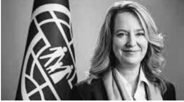
New head of UN’s migration agency Amy Pope

Governments who open up to migration often do so at their political peril: The Biden administration — which