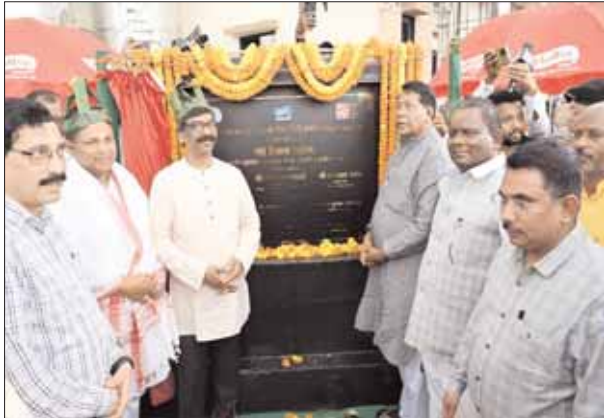
Chief Minister Hemant Soren, Ministers Rameshwar Oraon and Badal along with others during the inaugural ceremony of ultra-modern seventh Medha Dairy Plant in Medininagar on Wednesday.

The CM said that our challenges are also increasing due to the climate change happening today. Farmers are being affected the most by this. This change in weather is causing floods at some places and drought at other places. Because of this crop production is being affected. If we are not alert now, we will have to be prepared to face