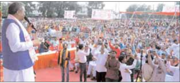
BJP State President Babul Marandi addresses a gathering during his 'Shankalp Yatra' at Hussainabad constituency in Palamau on Wednesday.