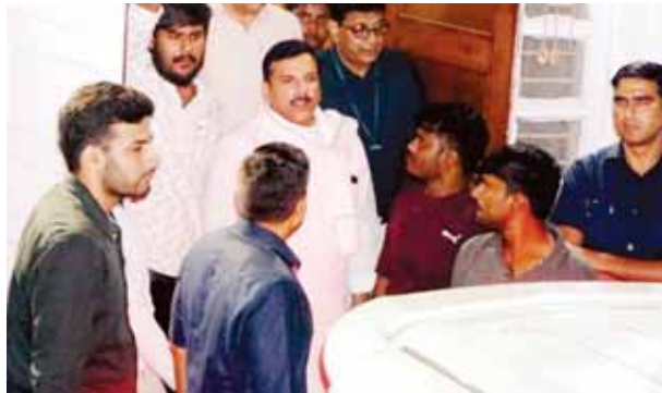
AAP Rajya Sabha member Sanjay Singh being arrested by the Enforcement Directorate in connection with the Delhi excise policy case in New Delhi on Wednesday

The developments stirred a political slugfest between the AAP and the BJP with Delhi Chief Minister Arvind Kejriwal terming it as a desperate measure by the BJP ahead of the