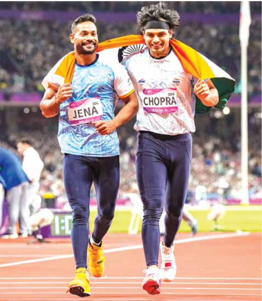
Neeraj Chopra and Kishore Kumar Jena wave the national flag after securing gold and silver medal respectively in the Men's Javelin Throw Final event at the 19th Asian Games in Hangzhou in China on Wednesday

Tokyo Olympic medallist Lovlina Borgohain put up a lacklustre display to settle for a silver as Indian boxers signed off with a haul of five medals at the Asian Games here on Wednesday.