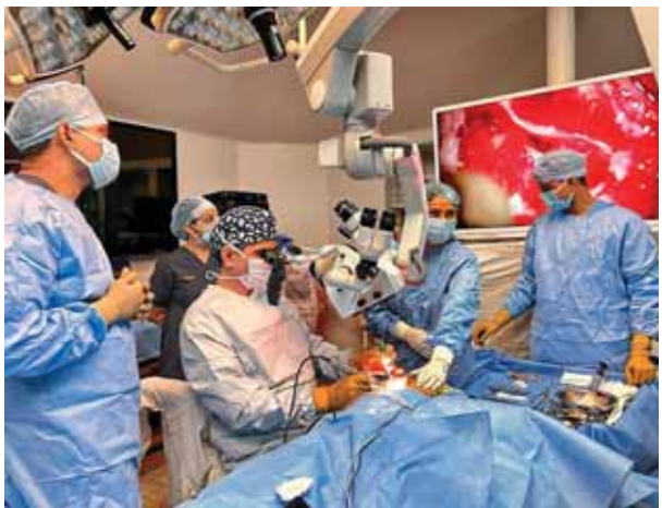
Army Hospital (R&R) doctors conducted 50 bilateral simultaneous cochlear implants in the last 18 months, becoming the only government hospital across the country to accomplish these many successful implants

"The cost of the equipment has always been a concern, making its outreach limited. Children get only one cochlear implant in most of the government-funded programmes. The benefit of hearing in both ears far outweighs the cost involved and the Armed Forces Medical Services were quick to realise this," the Defence Ministry said in a statement.