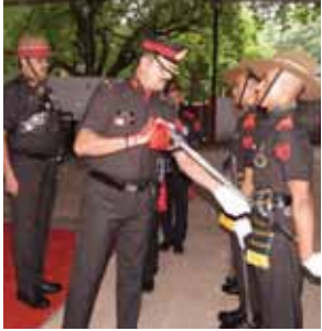
Brigadier Rajeev Nagyal at passing out parade of Agniveers at 39-GTC.

After 31 weeks of basic and advanced military training,