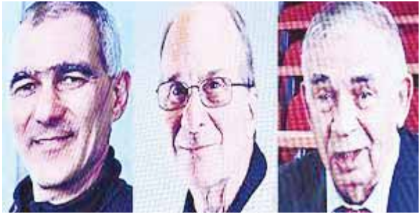
From left: Scientists Moungi Bawendi, Louis Brus, Alexei Ekimov

“They catalyze chemical reactions and their clear light