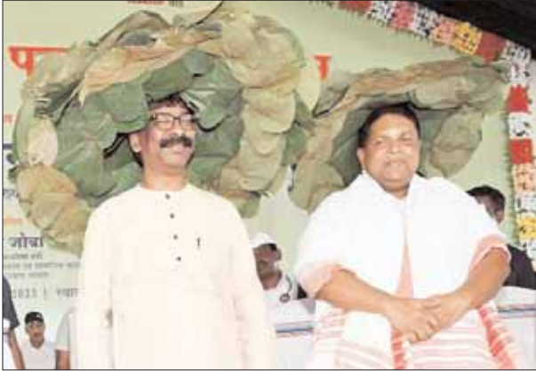
Chief Minister Hemant Soren alongwith Minister Badal Patralekh during inaugural ceremony of ultra-modern seventh Medha Dairy Plant in

The CM said that in view of the uncertainty that persists in the weather, the government has started the Birsa Green Village Scheme. Farmers should join this scheme and plant different types of fruit trees in their land. For this, along with planting trees, the govern-