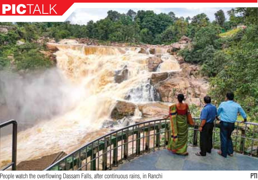
People watch the overflowing Dassam Falls, after continuous rains, in Ranchi