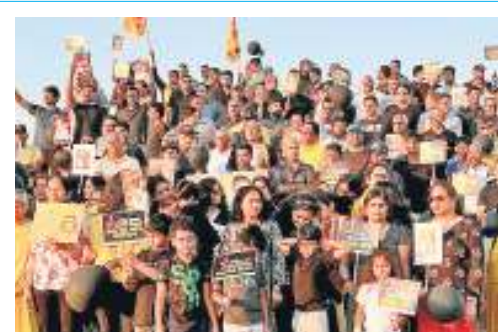
The Telugu diaspora in the United States and Australia has come together to express their solidarity with Chandrababu Naidu. Leading the charge in organising protests, the NRI community has taken a prominent stance. The NRI wing of the Jana Sena Party has also joined these demonstrations, resulting in coordinated protests across multiple states in the US, including California, Arizona, Dallas, Jersey, and Chicago.

Following the arrest of former chief minister N Chandrababu Naidu, who is also the president of the TDP, in a high-profile corruption case involving multi-crores, a groundswell of support, both at home and abroad, has emerged, condemning his detention as unlawful. The Telugu diaspora in the United States and Australia has come together to express their solidarity with Chandrababu Naidu. Leading the charge in organising protests, the NRI community has taken a prominent stance. The NRI wing of the Jana Sena Party has also joined these demonstrations, resulting in coordinated protests across multiple states in the US., including California, Arizona, Dallas, Jersey, and Chicago. Over the weekend, the NRI community has scheduled large rallies to demonstrate their unwavering support for Chandrababu Naidu and to