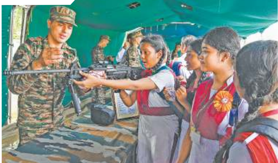
Army personnel briefs students about a weapon during an event of 'Veer Gatha', in Kolkata