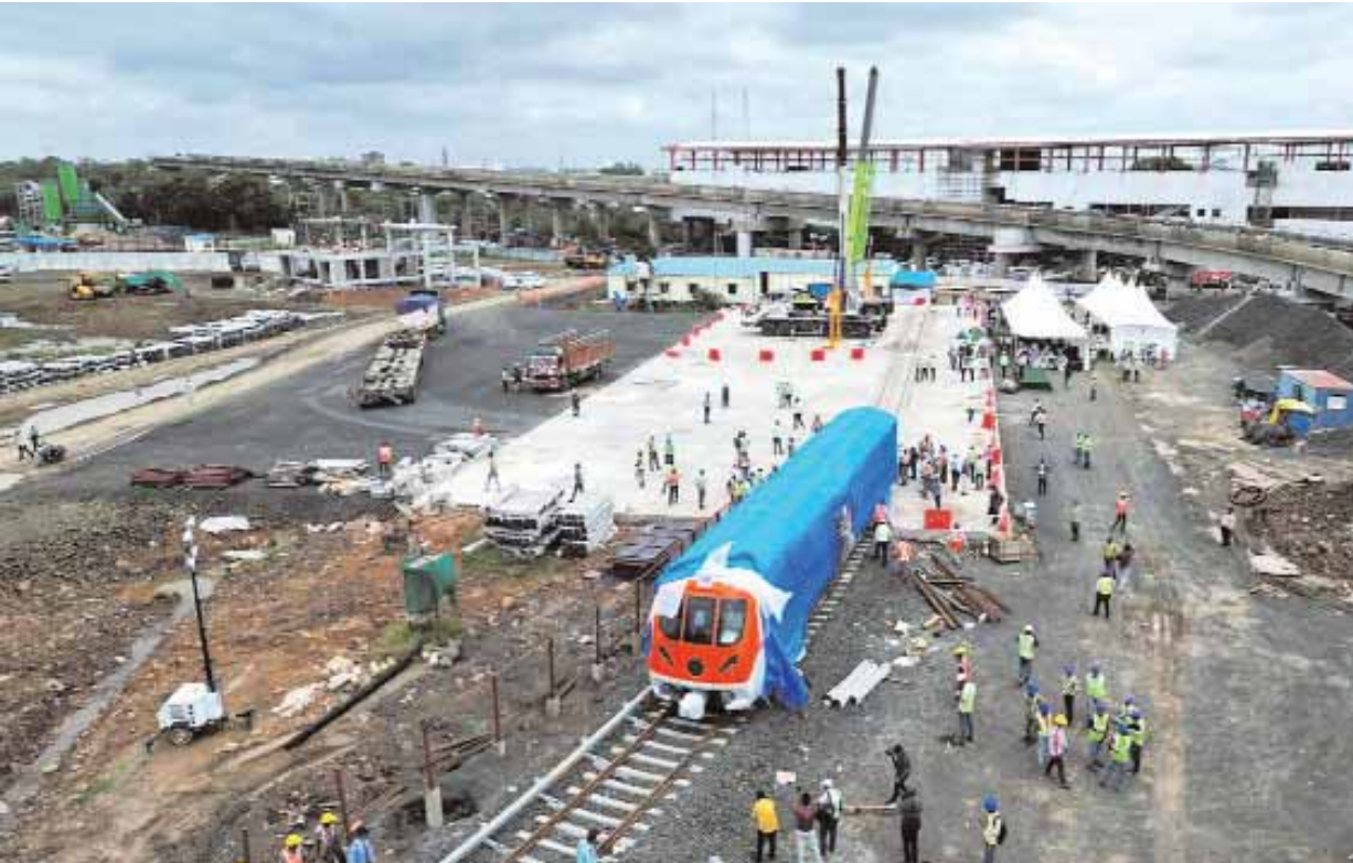
A coach of Bhopal Metro unloaded at Subhash Nagar depot ahead of its trial run, in Bhopal on Monday.