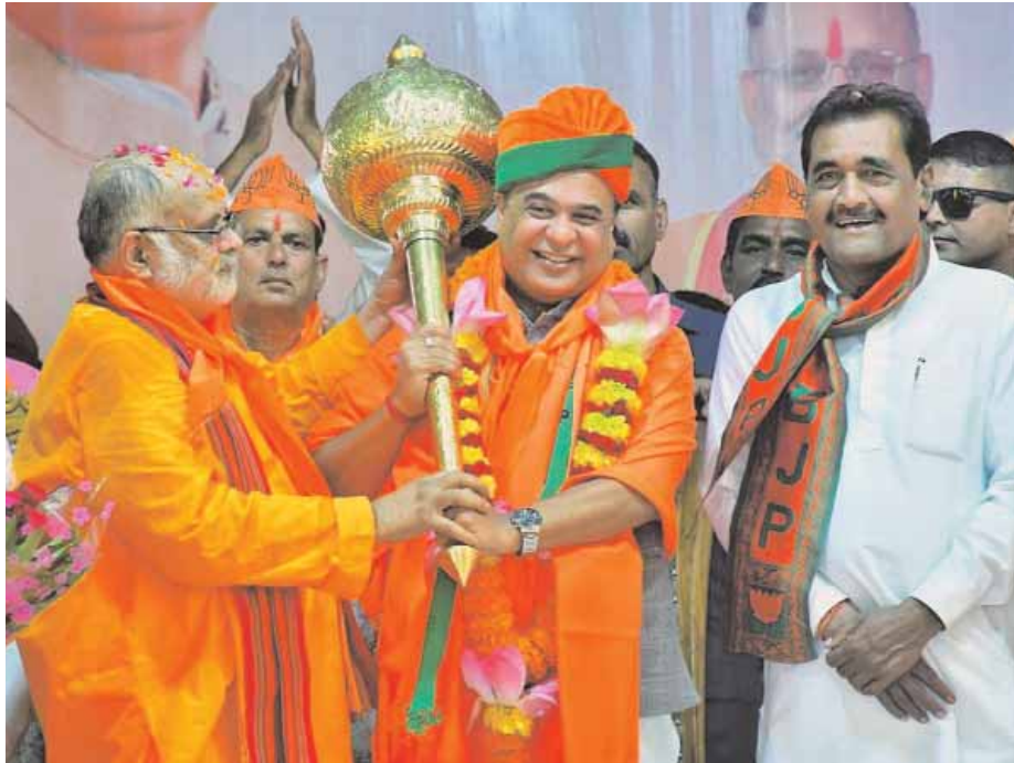
Assam Chief Minister Himanta Biswa Sarma during BJP's Jan Ashirwad Yatra in Sironi, Vidisha district Madhya Pradesh on Monday.