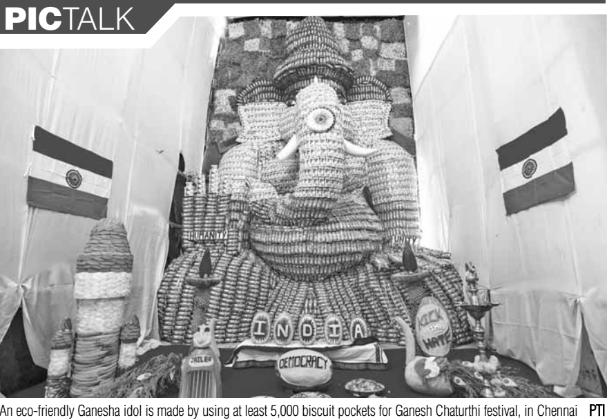
An eco-friendly Ganesha idol is made by using at least 5,000 biscuit pockets for Ganesh Chaturthi festival, in Chennai

Earlier, MoS (Parliamentary Affairs) Arjun Ram Meghwal had informed the MPs that Indian Parliament’s “journey of 75 years will be discussed throughout the day” but that did not happen. Instead, the day was all about speeches from the Treasury benches and the Opposition, mainly the Congress. Opposition leader Mallikarjun Kharge did not mince words in attacking the Government over its alleged misuse of CBI-ED in muzzling the dissenting voices. Quoting Nehru, he said he believed that the absence of a strong Opposition meant that there were significant drawbacks in the system. If there is no strong Opposition, it is not right. Now that there is a strong Opposition, the focus is on weakening it through ED and CBI, he claimed. The special session will include five sittings across five days, with a focus on discussing eight legislative items. Additionally, there will be deliberations on the “parliamentary journey of 75 years”, encompassing achievements, experiences, memories and learnings. However, how much business is actually transacted in the House remains to be seen. But the bleak possibility of the Government sneaking something up its sleeve and shocking the parliamentarians at a time suited to it appears dimmer each passing minute. We should also, as a responsible nation, not play into paranoia and celebrate the old yielding place to the new: It was simply about shifting from the old building to the new.