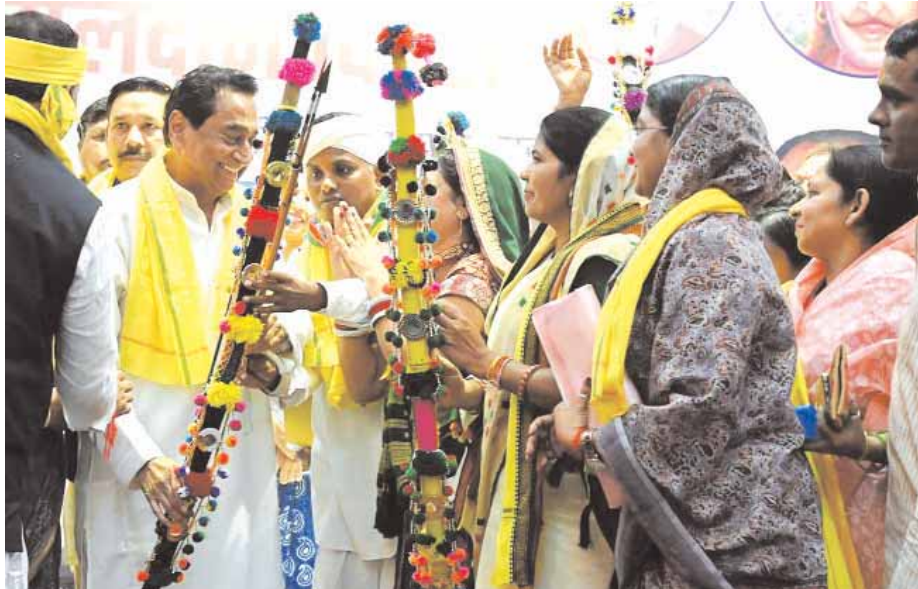
Madhya Pradesh State Congress President Kamal Nath during a programme to mark the martyrdom day of Tribal leaders Raja Shankar Shah and Raghunath Shah in Bhopal on Monday.

Apart from obtaining the draft genome structure of the Amla for the first time, the researchers also identified genes responsible for vitamin C biosynthesis and compared them with genes in other plants that bear vitamin C-rich fruits. The team found that Amla's exceptional antioxidant power comes from the adaptive evolution of certain genes involved in the production of antioxidants like vitamin C and flavonoids. Amla's abundant vitamin C content and the remarkable capacity of each tree to yield up to 100 kg of fruits make it superior to other vitamin C-rich fruits such as the West Indian cherry from Mexico and the camu camu fruit found in Brazil, Peru, Colombia, and Venezuela and makes it a perfect choice for switching from the synthetic to a natural source of Vitamin C.