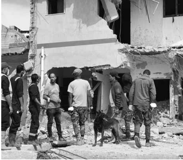
Rescue teams search for victims in Derna, Libya, on Sunday. Libyan authorities have opened an investigation into the collapse of two dams that caused a devastating flood in a Derna as rescue teams searched for bodies on Saturday, nearly a week after the deluge killed more than 11,000 people.

Seven of the surviving Greek rescue workers were in critical condition, the minister said. In a parallel statement, the