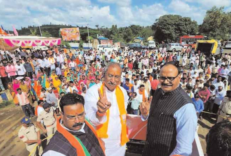
Uttar Pradesh Deputy Chief Minister Brajesh Pathak during BJP's Jan Ashirwad Yatra in Ghoradongri, Betul district Madhya Pradesh on Monday.