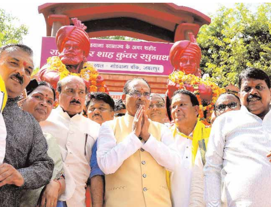
Madhya Pradesh Chief Minister Shivraj Singh Chouhan after paying tributes to freedom fighters and Tribal leaders Raja Shankar Shah and Raghunath Shah on their martyrdom day in Jabalpur, Madhya Pradesh on Monday.