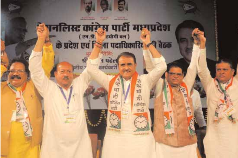
Nationalist Congress Party leader Praful Patel during a party workers convention at Shaheed Bhawan in Bhopal on Saturday.