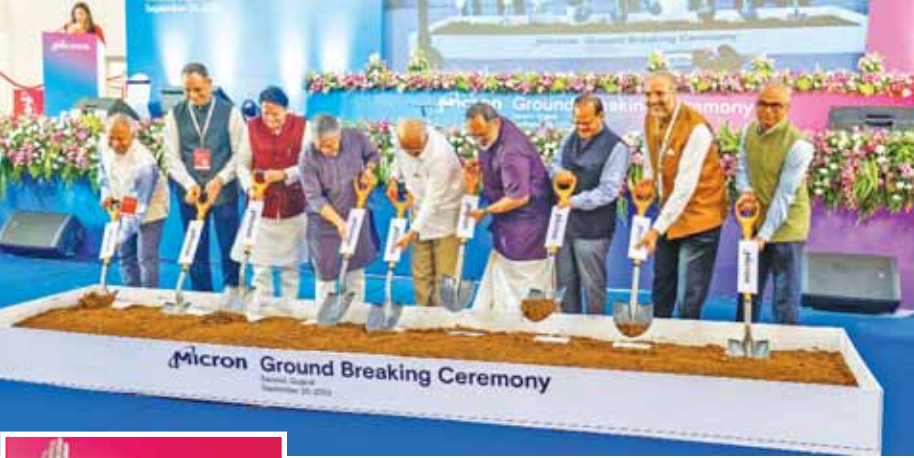
Union Minister for Railways and Electronics & Information Technology Ashwini Vaishnaw, leaders and officials from Micron Technology and Tata Project during a 'Ground Breaking Ceremony' at Micron Technology, in Sanand, Gujarat. (Insert) Vaishnaw addresses during the 'Ground Breaking Ceremony'

He said that there are some specific areas where India can take the lead and the focus of the semiconductor projects will be