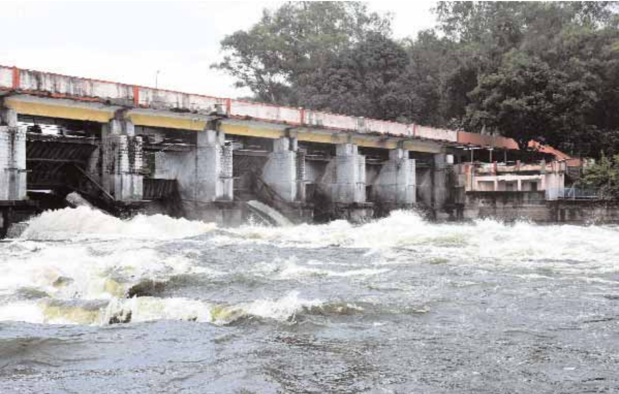
Water gushes out after the two sluice gates of Bhadbhada dam opened in Bhopal on Saturday.