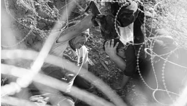
Migrants who crossed the Rio Grande from Mexico to the US work their way through concertina wire on Friday in Eagle Pass, Texas

Bárcena told a news conference in New York Friday that migrant shelters in Ciudad Juárez, across from El Paso, Texas, are 95 per cent full and that the Mexican government is 'very worried' about the border closures and the migrant surge, especially given Mexico's rocky relationship with Texas