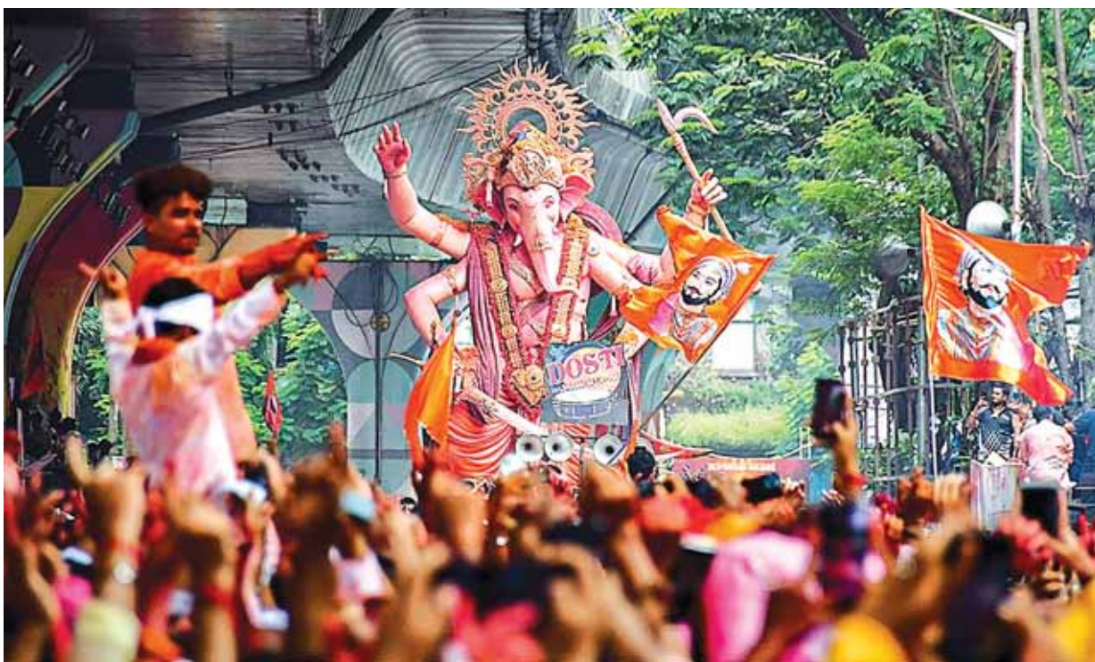
Devotees celebrate during the procession of Lalbaughcha Raja idol of Lord Ganesha before its immersion in Mumbai on Thursday

India had designated Nijjar as a terrorist in 2020. India has, however, strongly rejected Trudeau's allegations terming it as "absurd" and "motivated" and expelled a senior Canadian diplomat in a tit-for-tat move to Ottawa's expulsion of an Indian official over the case.