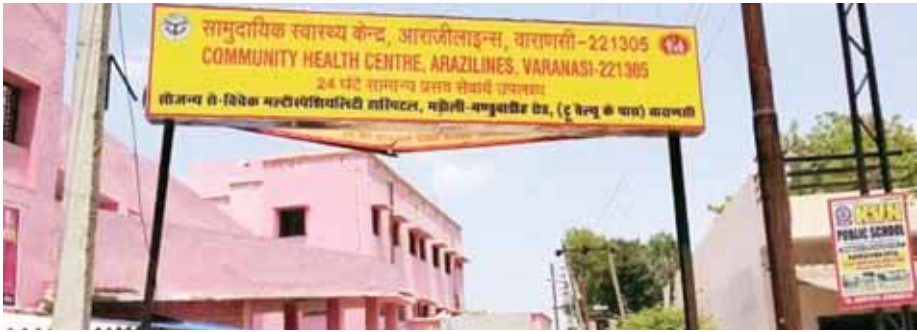
Arazilines CHC best in Varanasi as per UP Health-Ranking Dashboard.

“Along with this, it stood second in the state in temporary means of family planning (Antara, Chhaya, Copper-T,