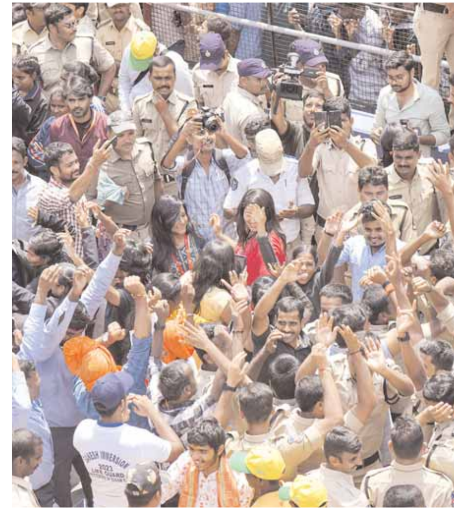
Policemen dance with devotees carrying Lord Ganesha idol for immersion on the conclusion of Ganesh Chaturthi festival, in Hyderabad, on Thursday

unfair and unreasonable in so far as the exception under PCA Act which permits cruelty to animals for the purposes mentioned in Section 11(3) (b) (destruction of stray dogs in lethal chambers), Section 11(3) (c) (extermination or destruction of any animal under the authority of any law for the time being in force) ...,” the plea said. It has also challenged sections 428 (Mischief by killing or maiming animal of the value of ten rupees) and 429 (mischief by killing or maiming cattle, etc., of any value or any animal of the value of fifty rupees) of the Indian Penal Code claiming that it is an instance of speciesism suggesting lack of moral worth or value in animals.