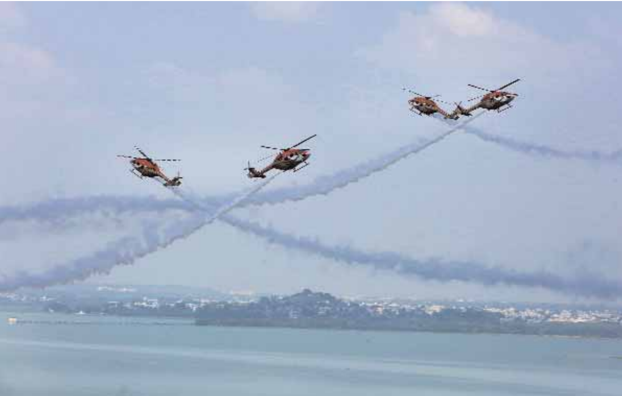
Indian Air Force choppers during final rehearsal over the upper lake ahead of an air show to commemorate 91st anniversary of IAF, in Bhopal on Thursday.