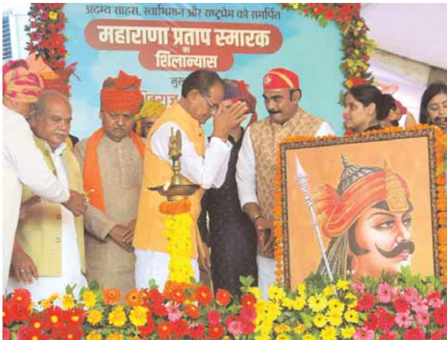
Chief Minister Shivraj Singh Chouhan with Union Minister for Agriculture and Farmers Welfare Narendra Singh Tomar during the foundation stone laying ceremony for the memorial of great warrior Maharana Pratap, in Bhopal on Thursday.