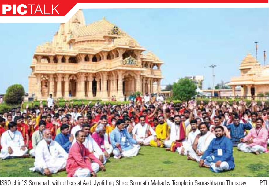
ISRO chief S Somanath with others at Aadi Jyotirlinga Shree Somnath Mahadev Temple in Saurashtra on Thursday

Impact of menopause on sleep can be debilitating It is imperative that both individuals and society recognise the significance of addressing sleep issues during menopause