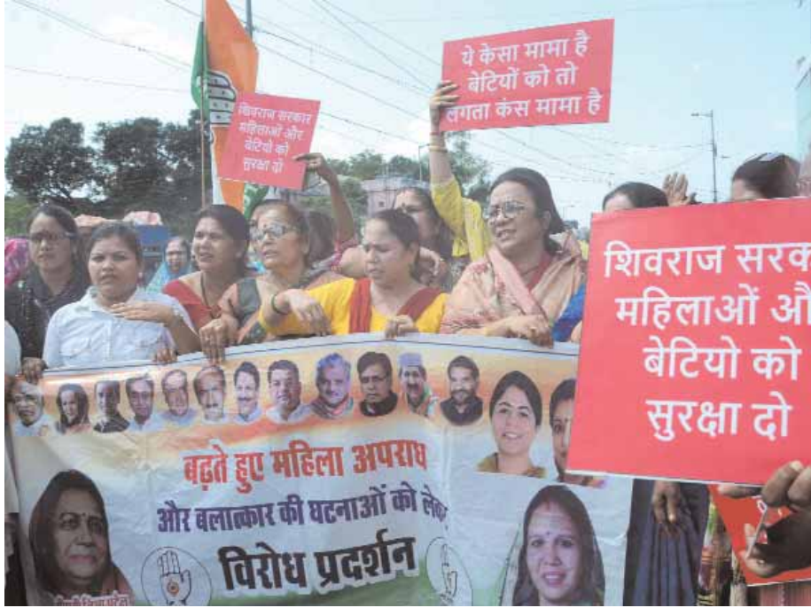
Madhya Pradesh Congress' women wing workers stage a protest against the incident of a minor girl raped in Ujjain, in Bhopal on Thursday.

Chief Minister Shivraj Singh Chouhan has said that the state government has sensitively taken important steps for the welfare of officers and employees of various cadres. Along with the regular employees, the interests of the staff engaged in other types of services have been taken care of. New suggestions received will also be implemented to benefit government servants. In this sequence, if necessary, a committee will be formed for grade pay and other suggestions. Chouhan was discussing with various representatives of officers and employees who came to meet him on Thursday.