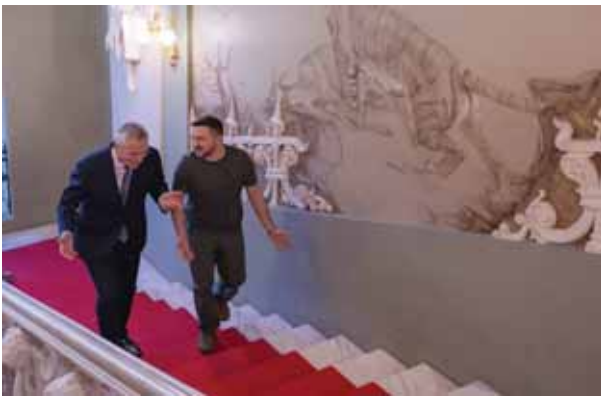
NATO Secretary General Jens Stoltenberg, left, and Ukrainian President Volodymyr Zelenskyy talk during their meeting in Kyiv, Ukraine, Thursday.

Zelenskyy said Stoltenberg agreed to make efforts to get NATO members to help provide additional air defense systems to protect Ukraine’s power plants and energy infrastructure that were badly damaged in relentless and deadly attacks by Russia last winter. He also reminded the secretary-general of the persistent attacks that often strike civilian areas, including 40 drone attacks overnight. “In the face of such intense attacks against Ukrainians, against our cities, our ports, which are crucial for