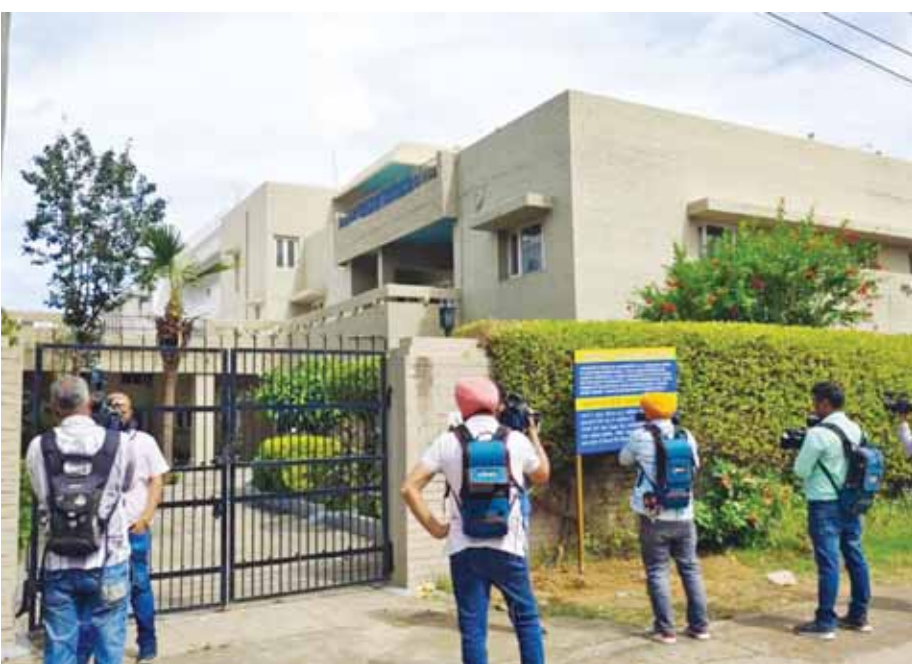
House of Gurbatwant Singh Pannu, chief of banned outfit Sikhs for Justice (SFJ), after the National Investigation Agency (NIA) confiscated his immovable properties in Chandigarh on Saturday

Recently, Pannu has been in the news for issuing blatant threats to senior Indian diplomats and government functionaries in public forums. He had also threatened Canadian Hindus a few days back, asking them to leave Canada and claiming that they had adopted a "jingoistic approach" by