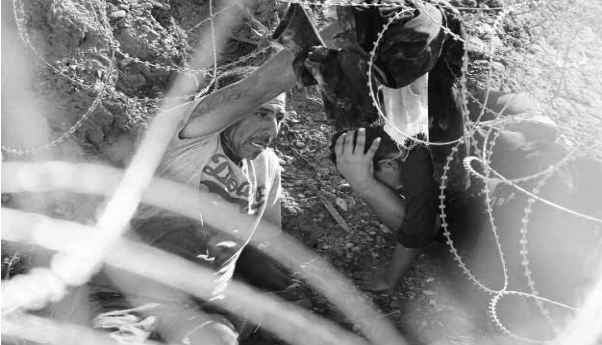
Migrants who crossed the Rio Grande from Mexico to the US work their way through concertina wire on Friday in Eagle Pass, Texas

Bárcena told a news conference in New York Friday that migrant shelters in Ciudad Juárez, across from El Paso, Texas, are 95 per cent full and that the Mexican government is 'very worried' about the border closures and the migrant surge, especially given Mexico's rocky relationship with Texas