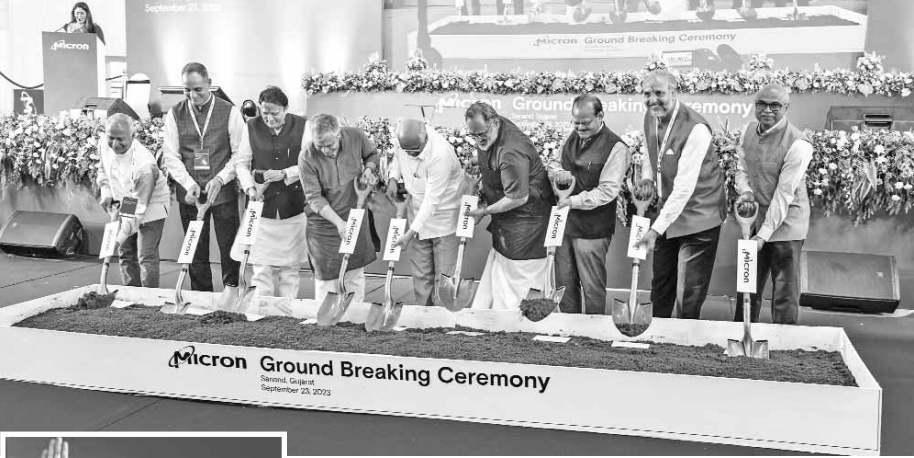
Union Minister for Railways and Electronics & Information Technology Ashwini Vaishnaw, leaders and officials from Micron Technology and Tata Project during a 'Ground Breaking Ceremony' at Micron Technology, in Sanand, Gujarat. (Insert) Vaishnaw addresses during the 'Ground Breaking Ceremony'

He said that there are some specific areas where India can take the lead and the focus of the semiconductor projects will be