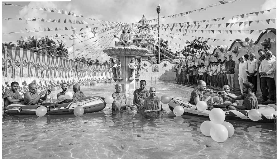
Saints Of Swaminarayan Gurukul pray to Lord Swaminarayan on the 'Jal Jilani Ekadashi, in Surat