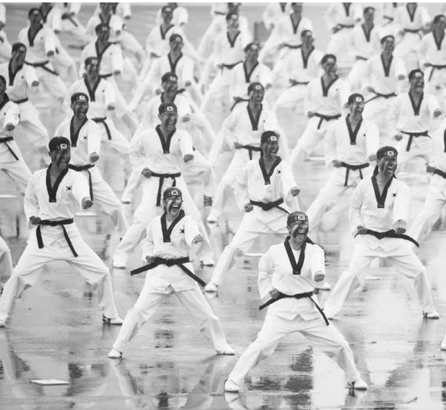
South Korean soldiers give a demonstration of their skills in the traditional Korean martial art of Taekwondo during a celebration to mark the 75th anniversary of Armed Forces Day in Seongnam, South Korea, Tuesday.

But Yoon says Seoul-Washington-Tokyo cooperation won't marginalise any particular nation.