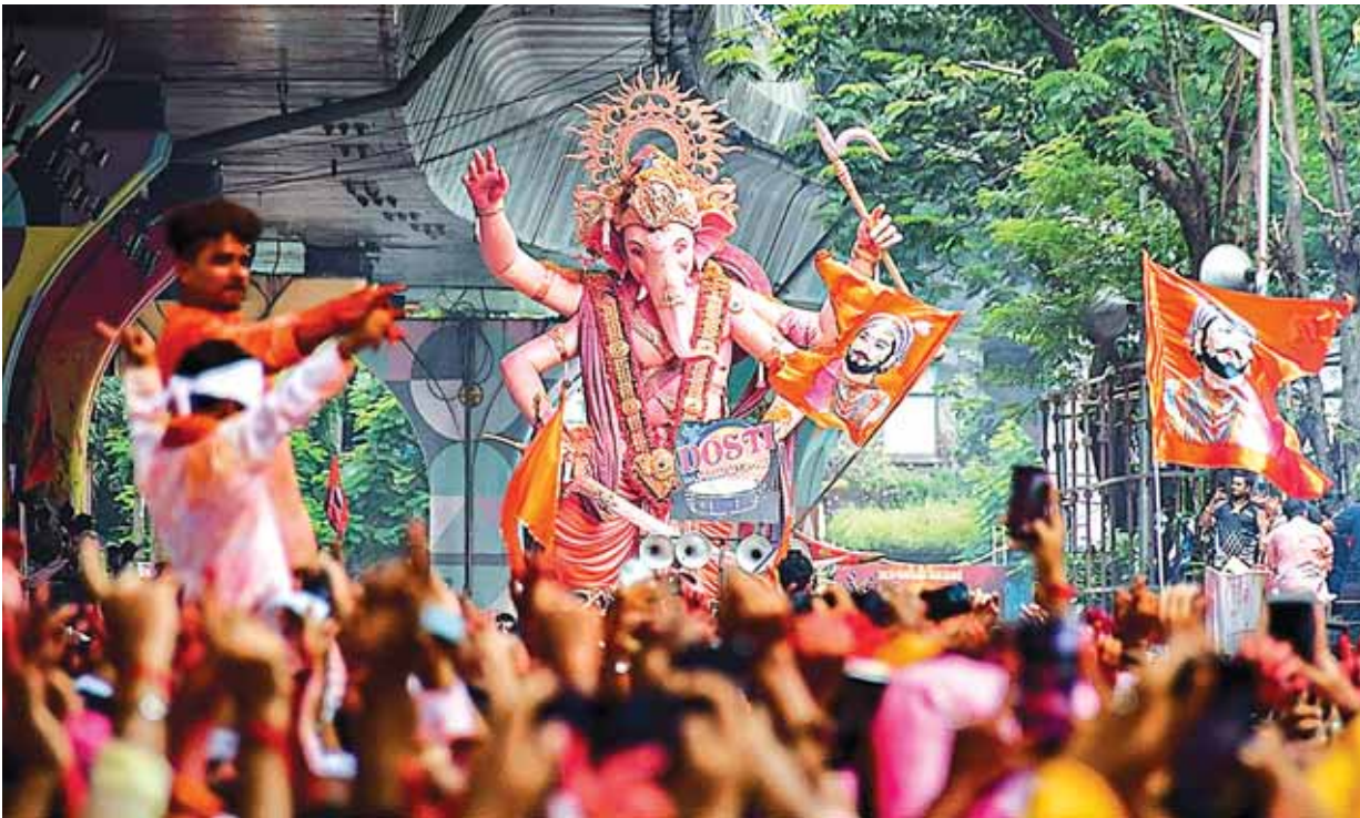
Devotees celebrate during the procession of Lalbaugha Raja idol of Lord Ganesha before its immersion in Mumbai on Thursday

India had designated Nijjar as a terrorist in 2020. India has, however, strongly rejected Trudeau's allegations terming it as "absurd" and "motivated" and expelled a senior Canadian diplomat in a tit-for-tat move to Ottawa's expulsion of an Indian official over the case.