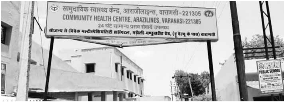
Arazilines CHC best in Varanasi as per UP Health-Ranking Dashboard.

“Along with this, it stood second in the state in temporary means of family planning (Antara, Chhaya, Copper-T,