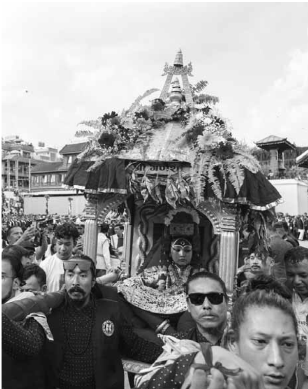
Living god Ganesh is carried on a chariot during Indra Jatra, a festival that marks the end of the rainy season, in Kathmandu, Nepal, Thursday, Sept. 28, 2023. According to a local myth, the god of rain Indra once disguised himself as a human to collect night jasmine for his mother but was captured by locals. In exchange for his release, it was agreed that the rain would be stopped and the souls of those departed in that year ascend to heaven.

tary cooperation with South Korea and Japan, accusing them of creating the “Asian version of NATO, the root cause of war and aggression.” “This is just the worst actual threat, not threatening rhetoric or an imaginary entity,” he said. Kim urged his diplomats to “further promote solidarity with the nations standing against the US and the West’s strategy for hegemony.” South Korea’s Unification Ministry, which handles relations with North Korea, said the North Korean constitutional amendment confirms Kim’s unwillingness to relinquish his nuclear weapons program and his unwavering commitment to advancing that arsenal. It said in a statement that South Korea will continue to expand its military cooperation with the US and Japan and work closer with other international partners to increase pressure on North Korea to abandon its nuclear ambitions.