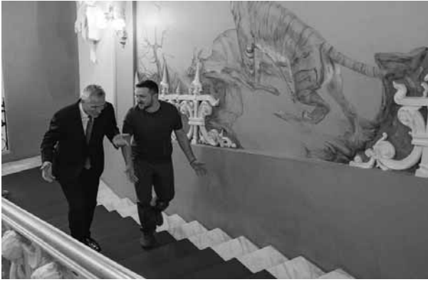
NATO Secretary General Jens Stoltenberg, left, and Ukrainian President Volodymyr Zelenskyy talk during their meeting in Kyiv, Ukraine, Thursday.

Zelenskyy said Stoltenberg agreed to make efforts to get NATO members to help provide additional air defense systems to protect Ukraine’s power plants and energy infrastructure that were badly damaged in relentless and deadly attacks by Russia last winter. He also reminded the secretary-general of the persistent attacks that often strike civilian areas, including 40 drone attacks overnight. “In the face of such intense attacks against Ukrainians, against our cities, our ports, which are crucial for