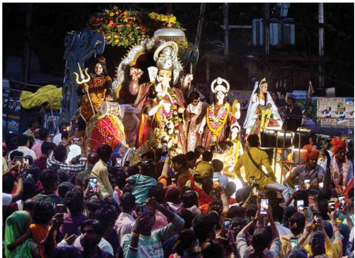
Devotees carry an idol of Lord Ganesha 'Bhopal Ke Raja' during a procession for immersion on the occasion of Dol Gyaras festival in Bhopal on Monday

Addressing a massive gathering of BJP workers, 'Karyakarta Mahakumbh', here, the PM tore into the Congress, equating the national party with "rusted iron" and alleging its functioning has been outsourced to "urban Naxals" and that the organisation is not run by leaders.