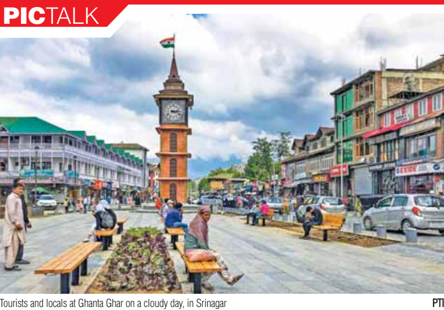
Tourists and locals at Ghanta Ghar on a cloudy day, in Srinagar

The State offers various incentives to attract industries, such as tax exemptions and subsidies. With fertile land and a large agricultural base, Uttar Pradesh offers excellent prospects for investment in agriculture and food processing industries. Initiatives like "One District, One Product" (ODOP) promote unique regional products and boost agro-based businesses. Investments in the tourism sector, including hospitality, travel and infrastructure, are poised for growth as the State promotes religious and cultural tourism with gusto. The Chief Minister has actively engaged with potential investors and made a compelling pitch to invite them to Uttar Pradesh. The State has introduced single-window clearances, industry-specific incentives and land acquisition reforms. Existing and upcoming airports, highways and state-of-the-art amenities for visitors add to the charm of Uttar Pradesh. Last but not the least, improved law and order has created a secure environment for businesses.