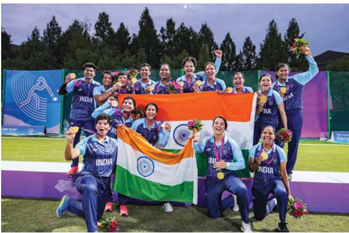
Indian players pose for photos after winning the gold medal in the women's cricket event at the 19th Asian Games in Hangzhou in China on Monday

"It was a great opportunity we got this time, and the fact that we were able to grab that