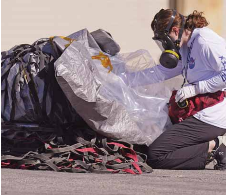
A recovery team member examines a capsule containing NASA's first asteroid samples before it is taken to a temporary clean room at Dugway Proving Ground in Utah on Sunday, September 24. The Osiris-Rex spacecraft released the capsule following a seven-year journey to asteroid Benu and back

The Russian Defence Ministry said its air defences downed three Ukrainian drones over the Kursk region of Russia and three others over the Bryansk region early Monday. It also reported that three drones were shot down over the Belgorod region. Kursk Gov Roman Starovoi said a downed drone over the centre of the city of Kursk damaged the roof of an administrative building and several private houses and shattered windows in an apartment building. Starovoi said there were no injuries. A day earlier, a Ukrainian drone damaged the roof of an administrative building in Kursk that some Ukrainian and Russian media reported housed the offices of the Federal Security Service, Russia's main domestic security agency.