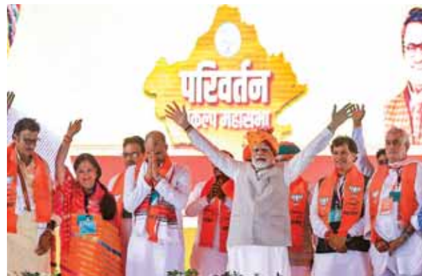
Prime Minister Narendra Modi during the 'Parivartan Sankalp Mahasabha' at Dadiya village in Jaipur on Monday

Addressing the well-attended rally, Prime Minister