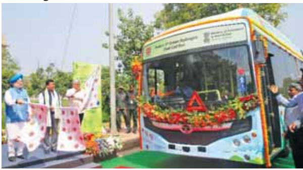
Union Minister for Petroleum & Natural Gas, Hardeep Singh Puri flags off 1st Green Hydrogen Fuel Cell Bus at India Gate in New Delhi on Monday

India's top oil firm IOC on Monday unveiled the nation's first green hydrogen-powered bus that emits just water as it takes the lead in bringing out unrivaled tools to replace fossil fuels. Indian Oil Corporation (IOC) will produce close to 75 kg of hydrogen by splitting water using electricity from renewable sources. This hydrogen will be used to power two buses which will ply across the national capital region for trial runs. Oil Minister Hardeep Singh Puri, flagging off the buses, said hydrogen will be India's transition fuel for moving away from fossil fuels. IOC's R&D Centre at Faridabad is producing green hydrogen for the pilot run. Four cylinders with a capacity of 30 kg can run the buses for 350 km. It takes 10-12 minutes for the four tanks to fill. Hydrogen when burnt emits only water vapour as a by-product. With three times the energy density and the absence of harmful emissions, hydrogen shines as a cleaner, more efficient choice to meet the energy requirement. As much as 50 units of renewable electricity and 9 kg of deionized water are needed for the production of one kilo of green hydrogen. Hydrogen can be used as a fuel for fuel cells. Puri said by the end of 2023, IOC will scale up the number of buses to 15. IOC will undertake opera-