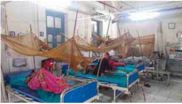
Champawat district, eight from Haridwar district, five from Chamoli district and two from Nainital district. A total of 15 persons have died in the State from dengue so far. Thir-

Out of the 98 cases reported in the State on Monday, 54 are from Pauri district, 14 from Dehradun district, nine from