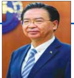
JAUSHIEH JOSEPH WU

Taiwan remains excluded from the UN due to China's misinterpretation of Resolution 2758, which only designates representation for China, not asserting Taiwan as part of China. This misrepresentation contradicts UN Charter principles and requires correction, as recognised by the international community and China's 1971 vote