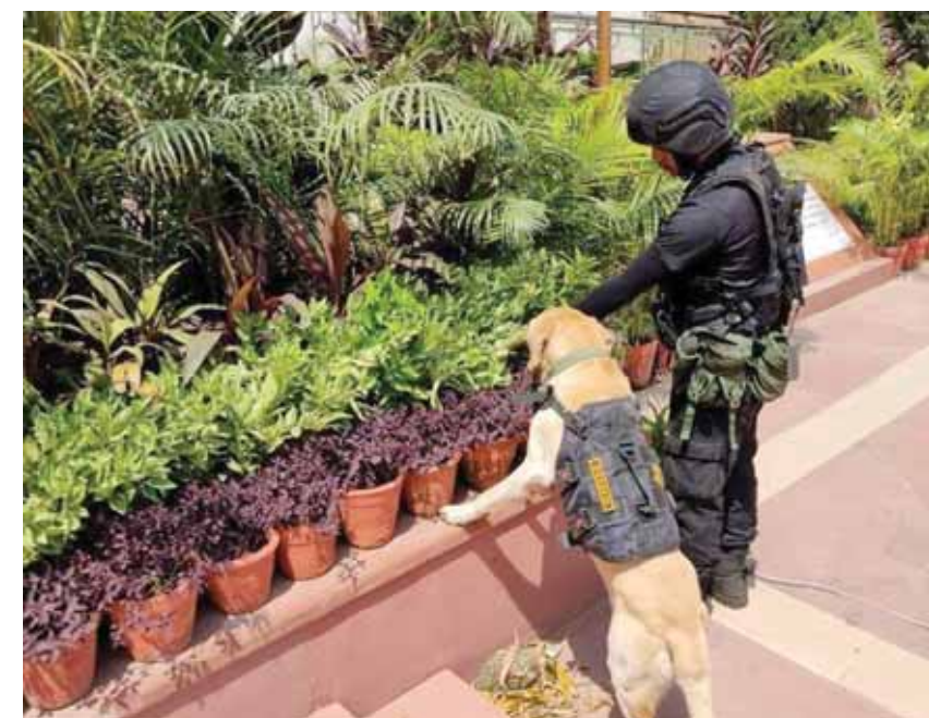
Security personnel stand guard for the upcoming G20 Summit in New Delhi on Saturday