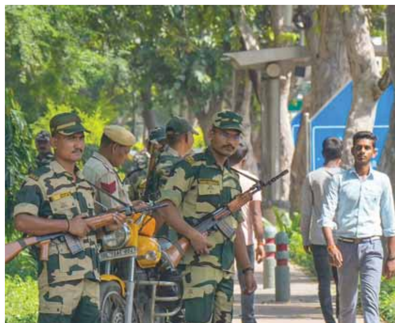
Security personnel stand guard during full dress carcade rehearsals for the upcoming G20 Summit, in New Delhi on Saturday