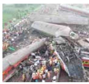
act or omission," the CBI said in a statement.

"They have been charged for offences relating to culpable homicide not amounting to murder and causing disappearance of evidence with common intention under the Indian Penal Code (IPC) and endangering safety of persons travelling by railways by wilful act or omission under the Railways Act, 1989 and endangering safety of passengers travelling by railways by wilful