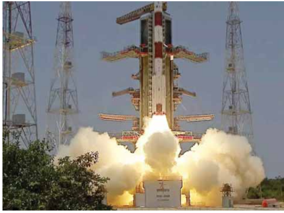
ISRO's launch vehicle PSLV-C57 rocket carrying India's first solar mission, 'Aditya-L1', lifts off from the Satish Dhawan Space Centre in Sriharikota on Saturday

The Sun is a giant sphere of gas and Aditya-L1 would study