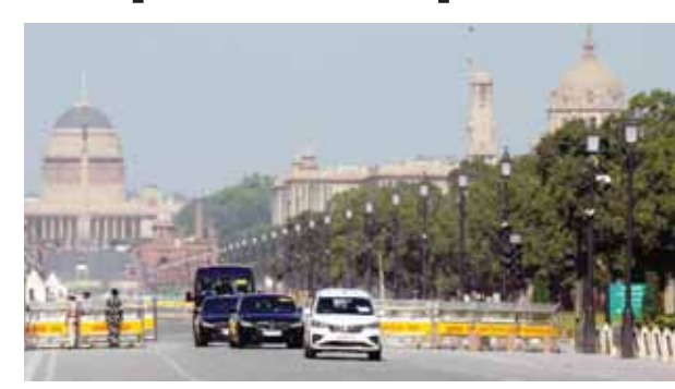
Security officials stand guard as a convoy moves past during full dress rehearsal for the upcoming G20 Summit in New Delhi on Saturday

Central Reserve Police Force (CRPF) commandos, deployed as Close Protection Team in the security of G20