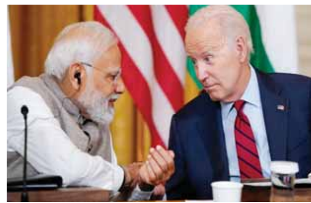
7), the President will travel to New Delhi, India to attend the G20 Leaders' Summit. On Friday, the President will participate in a bilateral meeting with Prime Minister Narendra Modi," the White House said.

On Saturday (September 9) and Sunday (September 10), the President will participate in the G20 summit, where he and G20 partners will discuss a range of joint efforts to tackle global issues, including the clean energy transition and combating climate change.