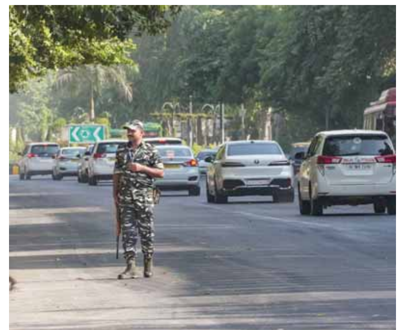
A convoy moves past on Man Singh Road during full dress carcade rehearsals for the upcoming G20 Summit, in New Delhi on Saturday