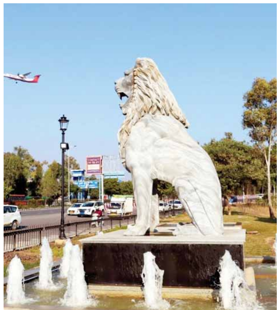
DELHI DECKS UP FOR G20: Fountains and statues of all shapes and sizes, street art depicting Indian history, mythology, art and culture, and a variety of plants have been installed all over the national Capital as the city is all set to roll out the red carpet for the G20 Summit. The impressive lion statue has been installed at the airport road.

The grouping comprises Argentina, Australia, Brazil, Canada, China, France, Germany, India, Indonesia, Italy, Japan, the Republic of Korea, Mexico, Russia, Saudi Arabia, South Africa, Turkey, the UK, the US and the European Union.