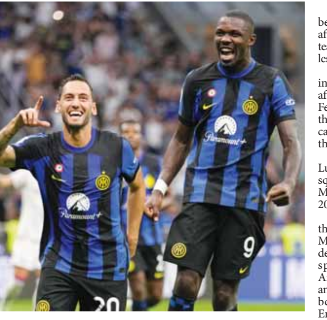
And Milan will be looking for revenge for a comprehensive defeat to their local rivals in last season's Champions League semi-finals. Martinez ended up with a brace to take his tally to five goals in three matches but it was Thuram who was crucial to seeing off woeful Fiorentina.

That match promises to be a blockbuster as both teams already look like strong contenders for the league title.