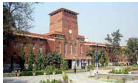
vented its conduct in 2022.

The DUSU election could not be held in 2020 and 2021 because of COVID-19, while possible disruptions to the academic calendar pre-