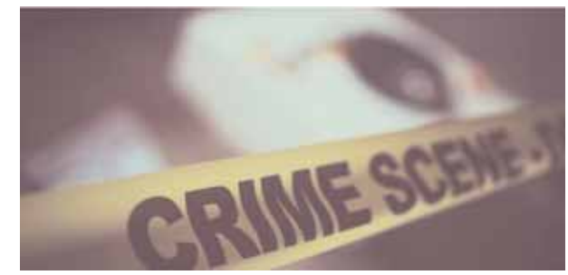
toilet complex, a senior police officer said.