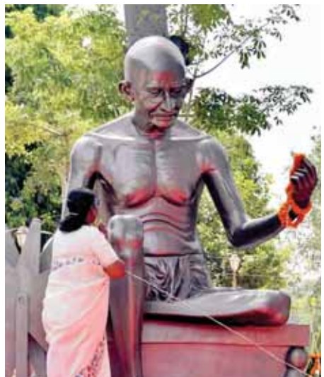
shown by him," said the president.

Murmu said the Gandhi statues at Gandhi Vatika will inspire the visitors, especially children. "The ideals and values of Babu (Mahatma Gandhi) are eternal. The goal of world peace can be achieved even now by following the path