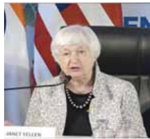
Russian oil exports and efforts to strengthen global food security in the face of restrictions on Ukrainian grain exports. At the same time, the Treasury said Yellen would work to deepen U.S. bilateral ties with India, viewing the country as an alternative to China for US investment and supply chains.

The Treasury said Yellen also will rally America's G20 allies to maintain economic support for Ukraine and increase costs on Russia over Moscow's continuing war in Ukraine. This includes supporting the G7-led price cap on