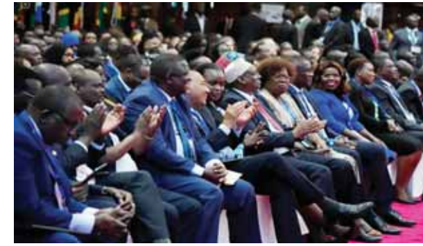
Delegates are seated during the official opening of the Africa Climate Summit at the Kenyatta International Convention Centre in Nairobi, Kenya on Monday.

"We are not here to catalog grievances," he said. And yet there is some