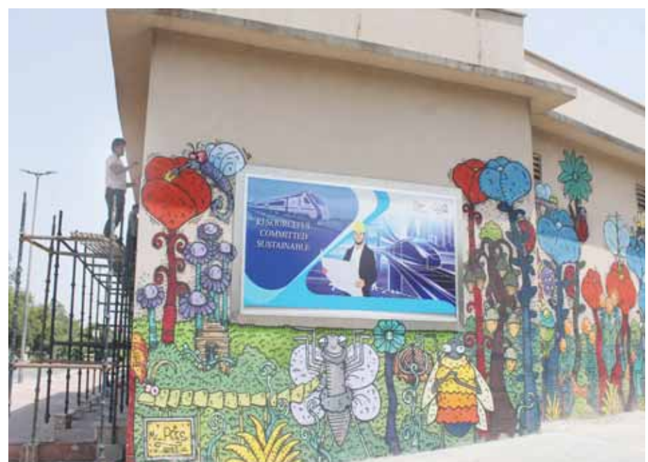
An artist paints graffiti at the Mandi House Metro Station ahead of the G20 Summit

"Dear Delhiites, don't panic at all! There is no lockdown. Just keep yourself updated with traffic information available on @dtpftraffic's Virtual Help Desk," the Delhi Police posted on X (formerly Twitter).