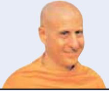
RADHANATH SWAMI MAHARAJ

Lord Krishna imparts invaluable guidance on leading a purposeful, spiritually enriched life