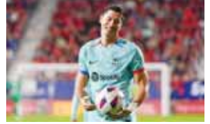
— they are two points behind their arch-rivals after four games. The coach started 16-year-old Lamine Yamal on the right wing again after his impressive display last weekend and his first call up to the Spanish national team on Friday. However it was veteran forward Lewandowski's penalty which was crucial for Barcelona this time.

Xavi brought on new loan signings Joao Cancelo and Joao Felix in the second half as Barcelona, third, stayed on league leaders Real Madrid's tail