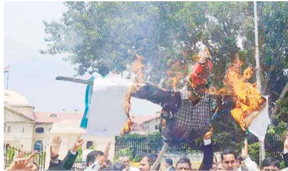
Advocates burning effigy of DGP at Allahabad High Court gate

DUPED: A retired army man was deprived of gold chain and rings in Georgetown area by four thugs who intro-