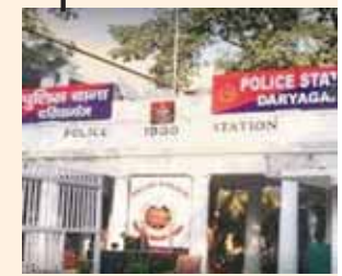
September 10 up to 10 pm for G20 Summit.

According to the order, which was released on Sunday, all government/private offices, shops, commercial establishments offices, cinema hall, vehicle parking, banks and schools, DTC/Cluster bus depot located at Rajghat, Asaf Ali Road, JLN Marg, Netaji Subhash Marg Nishad Raj Marg, Dayanand Road, Kedarnath Marg, Padamchand Marg and Ansari Raod Daryaganj and within the jurisdiction of Daryaganj police station were to be kept closed on September 7 from 10 pm to