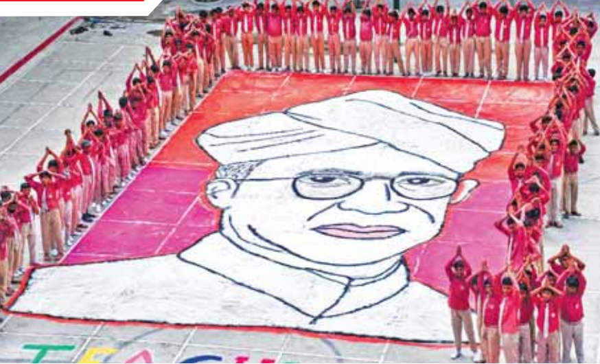
Students celebrate teacher's day with a 'rangoli' of former president Sarvepalli Radhakrishnan, in Moradabad