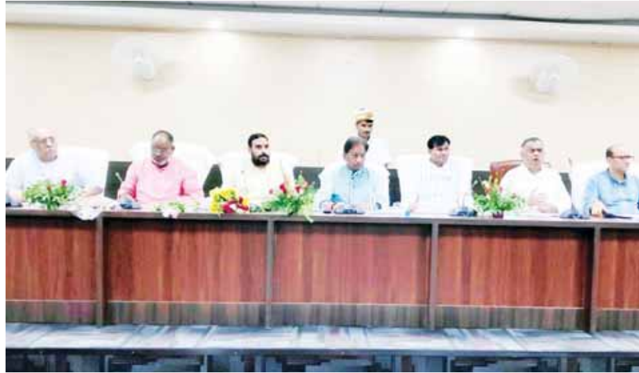
Legislative Council Committee holding a review meeting in Varanasi on Monday.

The committee instructed the VDA Secretary to give a beautiful look to Ravidas Park. It also raised the matter relating to an illegal colony on 6.05 acres near Chandua Satti and in reply, the VDA informed that action is being taken in this direction and it will be completely removed soon. Expressing displeasure over no action being taken till now in the proceedings related to illegal occupation and construction in Ramnagar's Bhatti since