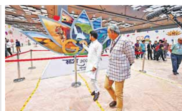
Union Minister Anurag Thakur inspects the arrangements at the International Media Centre ahead of the G20 Summit, in New Delhi.

8,000 electric buses on the roads of Delhi by the end of 2025. At that time there will be more than 10,000 buses in Delhi, of which 80 per cent will be electric. "Very soon Delhi will also be known all over the world for its excellent electric buses." "The number of electric buses has now gone up to 800 in Delhi. I want to congratulate Delhiites on this," Delhi Transport Minister Kailash Gahlot said at the flagging off event. Highlighting their features, Kejriwal said the buses can run up to 225 km on a single charge, have ramps for the differently abled, and are equipped with CCTV cameras and panic buttons for women's safety. "These buses provide two-way communication with the control room and each bus has a GPS unit for live tracking. The buses are equipped with disc brakes, and fire detection and suppression systems," he said.