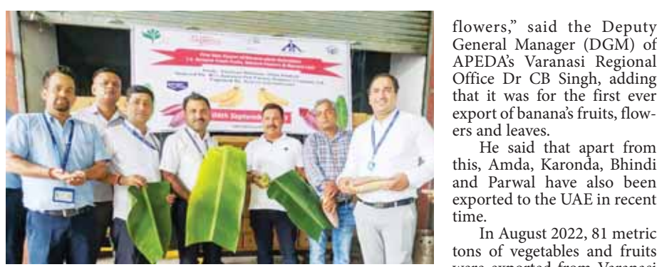
APEDA officers flagging off consignment of banana plant derivatives to UAE from Varanasi on Monday.

For the first time, Purvanchal (eastern UP) has exported banana plant derivatives to the United Arab Emirates (UAE). Not only fruits and vegetables but also its leaves and flowers were exported. The first consignment was exported from Ghazipur to the UAE. Agricultural and Processed Food Products Export Development Authority (APEDA) Chairman Abhishek Dev virtually flagged off the consignment from Lal Bahadur Shastri International (LBSI) Airport at Babatpur in Varanasi on Monday.