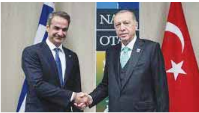
Turkish president Recep Tayyip Erdogan and Greek Prime Minister Kyriakos Mitsotakis

The foreign ministers of Greece and Türkiye agreed on Tuesday to revive high-level contacts between their countries and seek "new approaches" to problems as part of efforts to improve ties between the two NATO allies who are at loggerheads over a string of decades-old disputes. Discussions between Greece's Giorgos Gerapetritis and Türkiye's Hakan Fidan were held in a more friendly climate triggered by Greece sending assistance to Türkiye following a devastating earthquake earlier this year, and Türkiye offering condolences after a deadly train accident in Greece. "We have entered a new and positive period in our relations with Greece," Fidan told journalists at the end of their talks. "We reiterated our belief that our problems will be resolved through a constructive dialogue between the two neighbours and allies." The meeting came as Ankara, in the throes of an economic downturn, is seeking a reset of its often-troubled relations with Western nations. It follows a rare meeting between President Recep Tayyip Erdogan and Greek Prime Minister Kyriakos Mitsotakis on the sidelines of a NATO summit in Vilnius in July. According to a "roadmap" unveiled by the two ministers, Mitsotakis and Erdogan would meet again on the sidelines of the United Nations General Assembly in New York on September 18, followed by