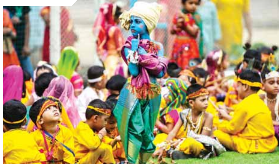
A student of Shivaji Shikshan Sanstha is dressed as Lord Krishna during Dahi Handi festival in Mumbai