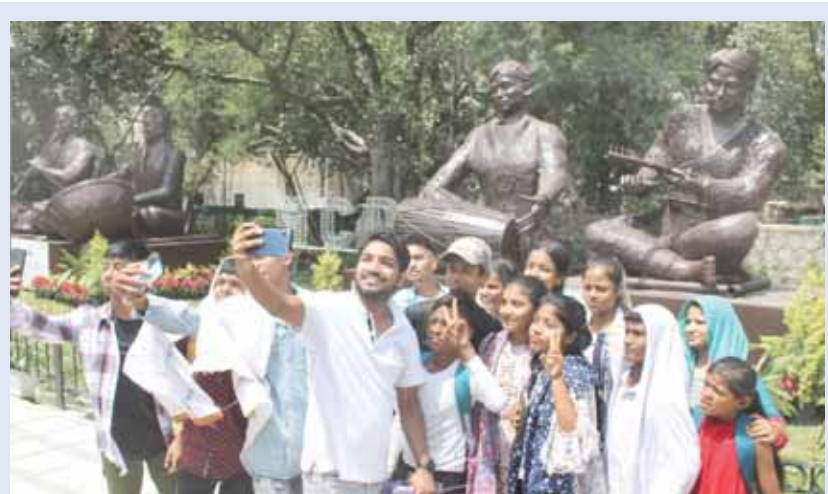
(Left to right): The walls of bridges and buildings in the national Capital have been covered in colourful paintings ahead of the forthcoming G20 Summit. (R) Young people take selfies with some of the sculptures in Delhi.