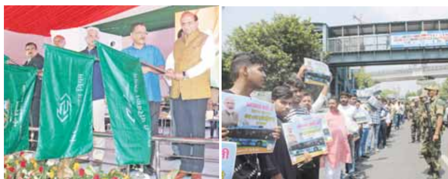
(Left) Delhi Lieutenant-Governor VK Saxena, Chief Minister Arvind Kejriwal and Transport Minister Kailash Gahlot flag off 400 new electric buses during a ceremony at IP Depot-5 (Right) BJP supporters hold placards outside the IP Depot during the flag-off ceremony of the 400 new electric buses.