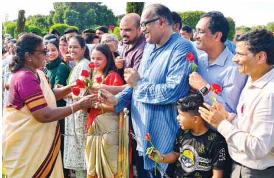
President Droupadi Murmu interacts with the teachers visiting 'Amrit Udyan' from various states on Teachers' Day, at Rashtrapati Bhavan on Tuesday