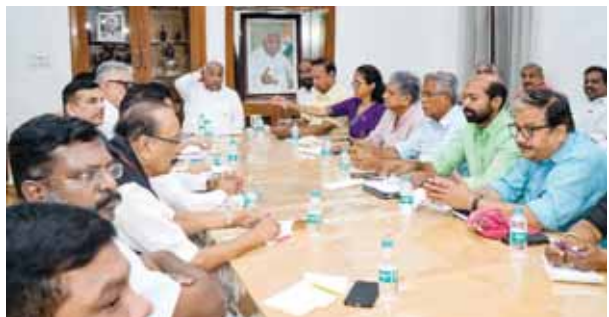
Congress president Mallikarjun Kharge chairs the floor leaders meeting of Opposition INDIA alliance at his residence in New Delhi on Tuesday

Sources indicate that the leaders at the INDIA bloc's strategy meeting, held ahead of