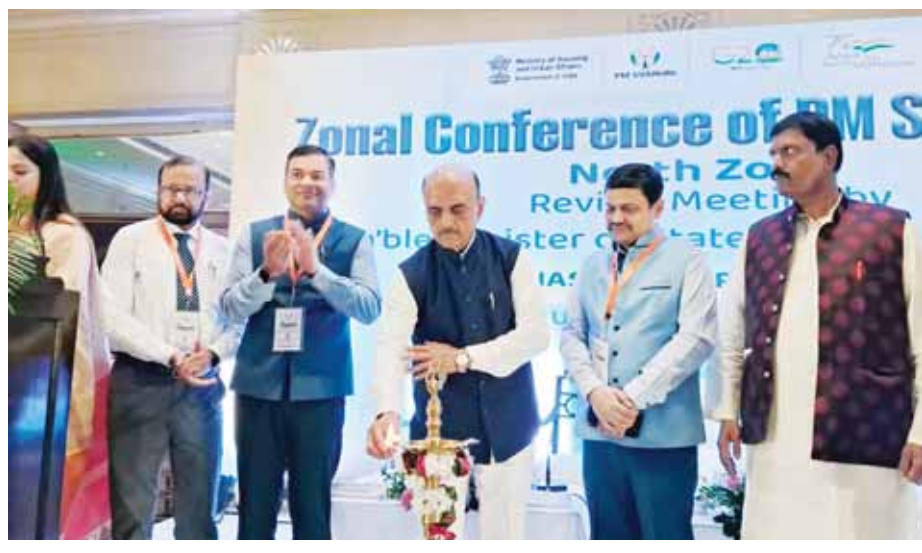
Union Minister of State for Finance Dr Bhagwat Kishanrao Karad inaugurating zonal conference of PM SAVNidhi Yojana in Varanasi on Tuesday.

Union Minister of State for Finance Dr Bhagwat Kishanrao Karad said that our target is to uplift all the poor street vendors with PM Street Vendor's AtmaNirbhar Nidhi (SVANidhi) Yojana which was launched by the Prime Minister Narendra Modi on June 1 in 2020 with an aim to re-establish the street vendors after the Covid pandemic period. He was addressing the conference of the Northern Zone of the PM SVANidhi Yojana here on Tuesday as the chief guest.