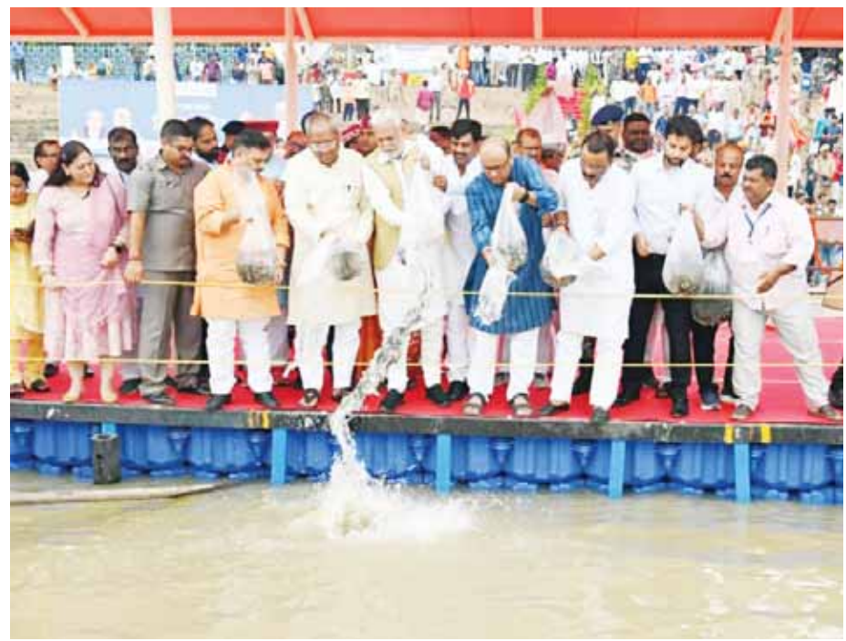
Guests releasing fingers of Chitala fish at a programme of river ranching of State Fish 'Chitala' held at Sant Ravidas Ghat in Varanasi on Tuesday.

For the first time in the country, the river ranching programme of fish was organised in Varanasi under which one lakh fingers of State Fish 'Chitala' was released into Ganga at Sant Ravidas Ghat here. The aim of river ranching of Chitala fish is to strengthen the ecosystem of the rivers, make the river free from pollution and double the income of fish farmers.