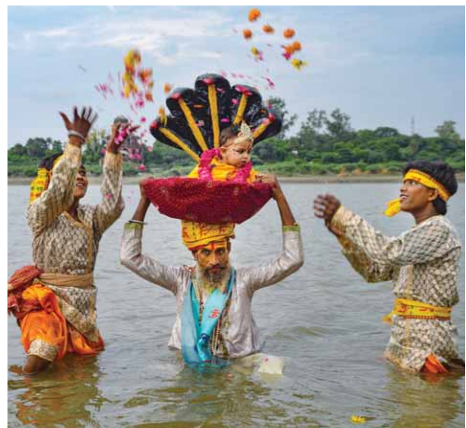
Devotees perform a ritual as they take out a tableau representing the story of Lord Krishna's birth in the River Yamuna on Janmashtami, in Agra on Wednesday.

Some ministers are expected to be on standby to assist world leaders who have already begun arriving for the summit. Union Minister of State for Health SPS Singh Baghel welcomed President of Nigeria Bola Ahmed Tinubu upon his arrival in Delhi on Tuesday. During an informal interaction prior to the Union Cabinet meeting, which lasted for nearly one hour, ministers were informed about the summit's significance for India and its global image.