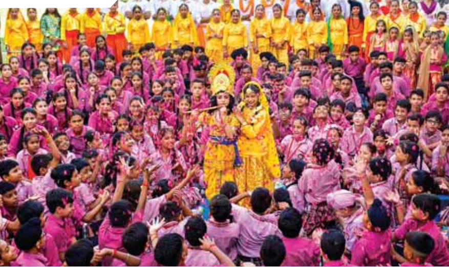
Children dressed as Lord Krishna and Radha during the celebrations on the eve of 'Janmashtami', in Amritsar.