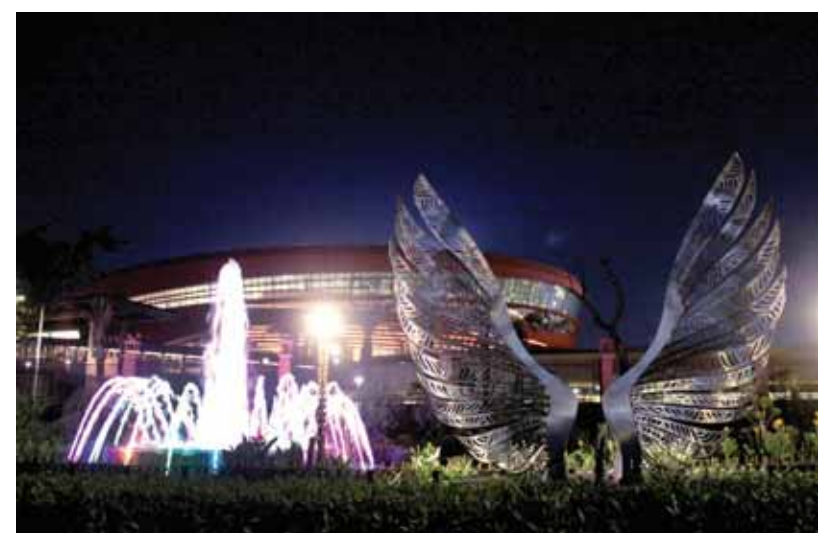
(Left to Right): Flags of countries participating in the G20 Summit in New Delhi on Wednesday. ■ A youth clicks photographs of a woman in front of the G20 logo and decorations in New Delhi on Wednesday. ■ A brightly lit Pragati Maidan ahead of the G20 Summit, in New Delhi on Wednesday.