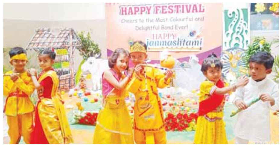
Children presenting a programme on Krishna Janmashtami at a school in Varanasi on Wednesday.

Shri Krishna Janmashtami was celebrated with all religious fervour and traditional gaiety at some places mainly in educational institutions here on Wednesday. Due to confusions over the dates of this famous festival, at several places the festival will be celebrated on Thursday. However, the festival was celebrated with all religious fervour in Banaras Hindu University (BHU) where Shri Krishna Janmashtami is celebrated with grandeur at different places.