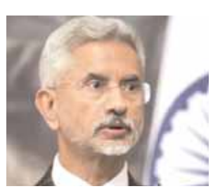
External Affairs Minister S Jaishankar.

Amidst ongoing war of words between the ruling BJP and the opposition following Rashtrapati Bhawan sending out invitations for a G20 dinner on September 9 on behalf of 'President of Bharat', External Affairs Minister S Jaishankar said India that is Bharat is mentioned in the Constitution. In an exclusive interview with ANI, the minister said the connotation of the word 'Bharat' is also reflected in the Constitution. "India that is Bharat, it is there in the Constitution. Please, I would invite everybody to read it," Jaishankar said. The minister was asked about the opposition parties' reaction and if the government is going to reposition India as Bharat coinciding with the G20 summit. "Look when you say Bharat in a sense, a meaning and understanding and a connotation that comes with it