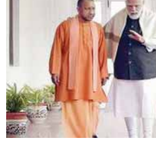
Prime Minister Narendra Modi and Uttar Pradesh Chief Minister Yogi Adityanath.

Uttar Pradesh Chief Minister Yogi Adityanath who met Prime Minister Narendra Modi on Tuesday, is understood to have given him a presentation on the ongoing construction of the Ram Temple in Ayodhya and developmental work underway in and around the city. According to sources, the Prime Minister was briefed on the infrastructure development projects that are currently underway, and those which are expected to be completed by January 2024 before the inauguration of the temple. It has been learnt that the Prime Minister, during the