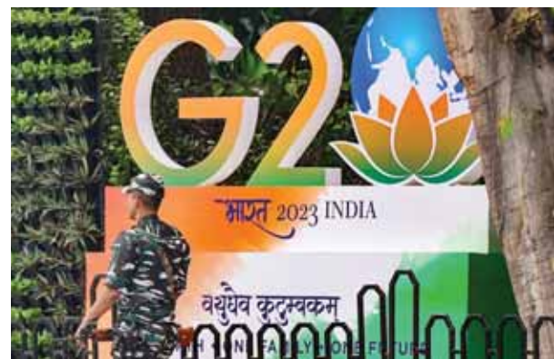
A security personnel stands guard opposite a G20 logo installed near Raisina Road as part of preparations for the summit in New Delhi, on Wednesday.

According to sources, ministers have been instructed to leave their official vehicles behind and rely on the shuttle service to reach Bharat Mandapam and other meeting venues. They are required to arrive at the Parliament Complex in their own vehicles, from where a shuttle will transport them to Bharat Mandapam, the location of the dinner. This measure has been implemented for security reasons.