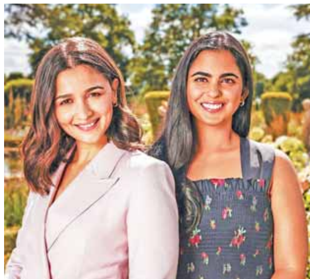
Ed-a-Mamma and its founder Alia Bhatt.

Reliance Retail has entered into a joint venture with a 51 per cent stake in Bollywood actress Alia Bhatt-promoted clothing brand of kids and maternity wear Ed-a-Mamma. Reliance Retail Ventures Ltd (RRVL), the holding company for retail operation of billionaire Mukesh Ambani-led Reliance Industries Ltd (RIL), in a statement said it aims to take the brand Ed-a-Mamma on a dynamic growth trajectory. It will be "closely collaborating with founder Alia Bhatt and leveraging the management strength of its subsidiary Reliance Brands Limited to spearhead the business. This partnership also marks a significant step forward in promoting sustainable fashion for the younger generation," said a joint statement.