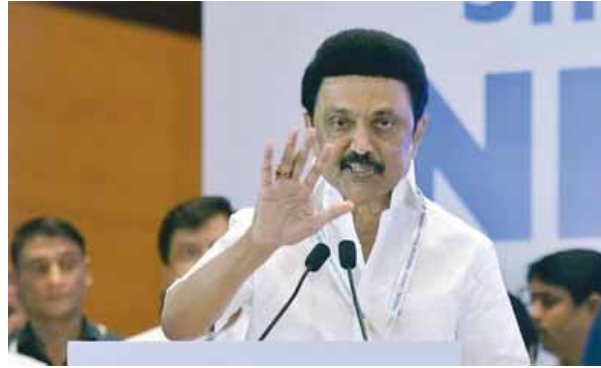
(DMK) provided the women what Sanatan denied them.

The chief minister said Tamil Nadu's ruling Dravida Munnetra Kazhagam the