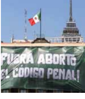
Opponents will continue the fight against expanded abortion access.