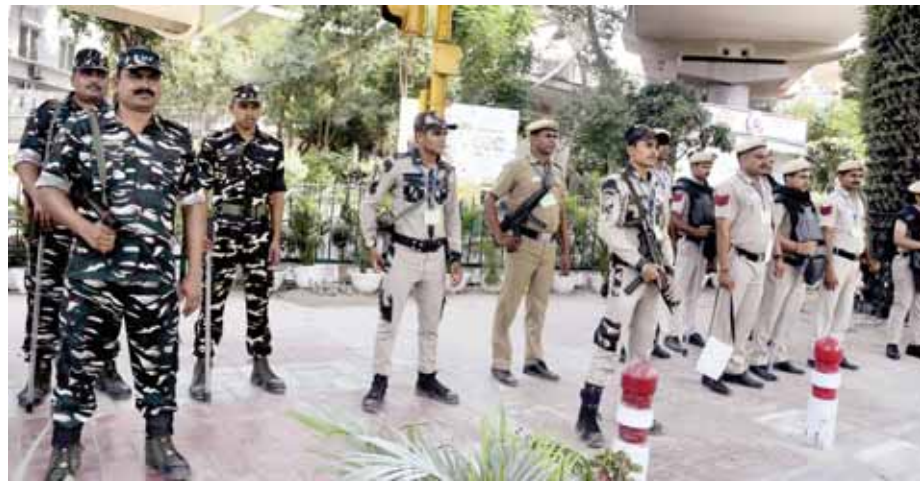
Security personnel stand guard near Pragati Maidan, ahead of the G20 Summit, to be held from September 8-10, in New Delhi on Thursday

Graffiti featuring legendary figures like Chhatrapati Shivaji Maharaj, Ahilyabai Holkar, Ahoms, Adi Shankaracharya, Maharana