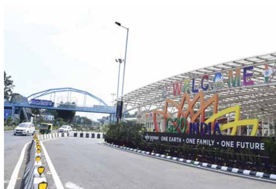
(Left to right) The newly-built International Exhibition Convention Centre at Pragati Maidan in New Delhi on Thursday remains lit up. Flyovers decked-up with paintings and welcome signs with G20 logo ready to greet world leaders ahead of the Summit in New Delhi on Thursday.