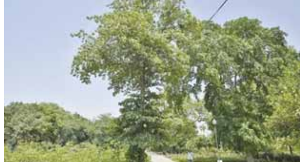
beautiful city forests and master plan greens of Delhi," the Delhi Development Authority (DDA) said in a statement. "Leg A of the 'cycle walk' project starting from Sangam Vihar to

The project, a pro-ecology initiative, is part of the government's climate change resilience efforts to serve the twin purpose of strengthening forests and green cover and creating a safe dedicated walking and cycling track for citizens to "engage meaningfully with the