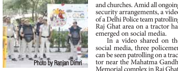
Jahangirpuri, Red Fort, Delhi University area, Adarsh Nagar, Model Town, and regions along the Outer Ring Road. In addition to these, the police have also enhanced patrolling around temples, mosques, gurdwaras, and churches. Amid all ongoing security arrangements, a video of a Delhi Police team patrolling Raj Ghat area on a tractor has emerged on social media.