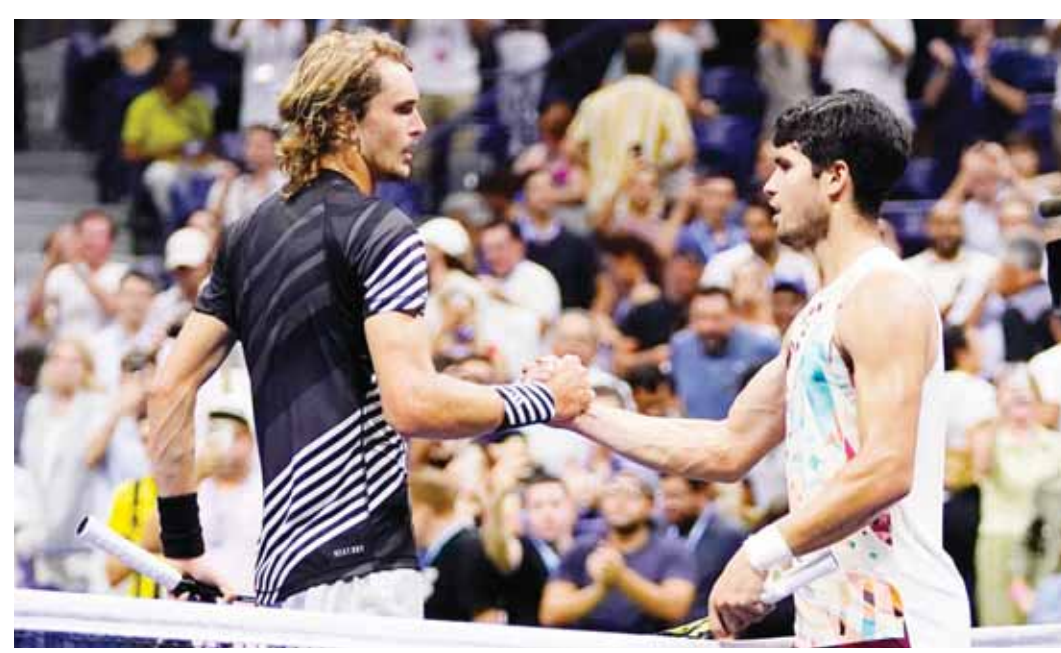
DANIIL WINS Daniil Medvedev defeated fellow Russian Andrey Rublev 6-4, 6-3, 6-4 in scorching conditions Wednesday to reach his fourth US Open semi-final and set up a meeting with defending champion Carlos Alcaraz. Third seed and 2021 champion Medvedev rallied from a break down in all three sets as he condemned a frustrated Rublev to a ninth straight Grand Slam quarter-final loss. Medvedev will play Alcaraz for a place in Sunday's final after an energy-sapping duel against the eighth-ranked Rublev as the temper-

going back to the start of last year's US Open. His only loss in that time came to Novak Djokovic in the French Open semi-finals. Zverev sensed an opportunity when he twice brought up break point in the seventh game, but Alcaraz held firm and then rubbed salt in the wound by smashing a volley at the net to dart 5-3 ahead. A comfortable service game earned Alcaraz the set and he didn't wait long till to hammer home his advantage, whipping a crunching backhand to break for a 2-1 lead in the second set. The top seed punished a Zverev double fault by breaking once more for 5-2, cemented with a one-two combination of blistering forehands. Alcaraz snuffed out a break point in the second game of the third set, thwarting Zverev twice more two games later -- continuing the theme of raising his game throughout when it mattered most. He needed no second invitation when another opening presented itself on Zverev's serve at 4-all, slashing a wicked forehand to close in on victory before serving it out for a spot in the semi-finals.