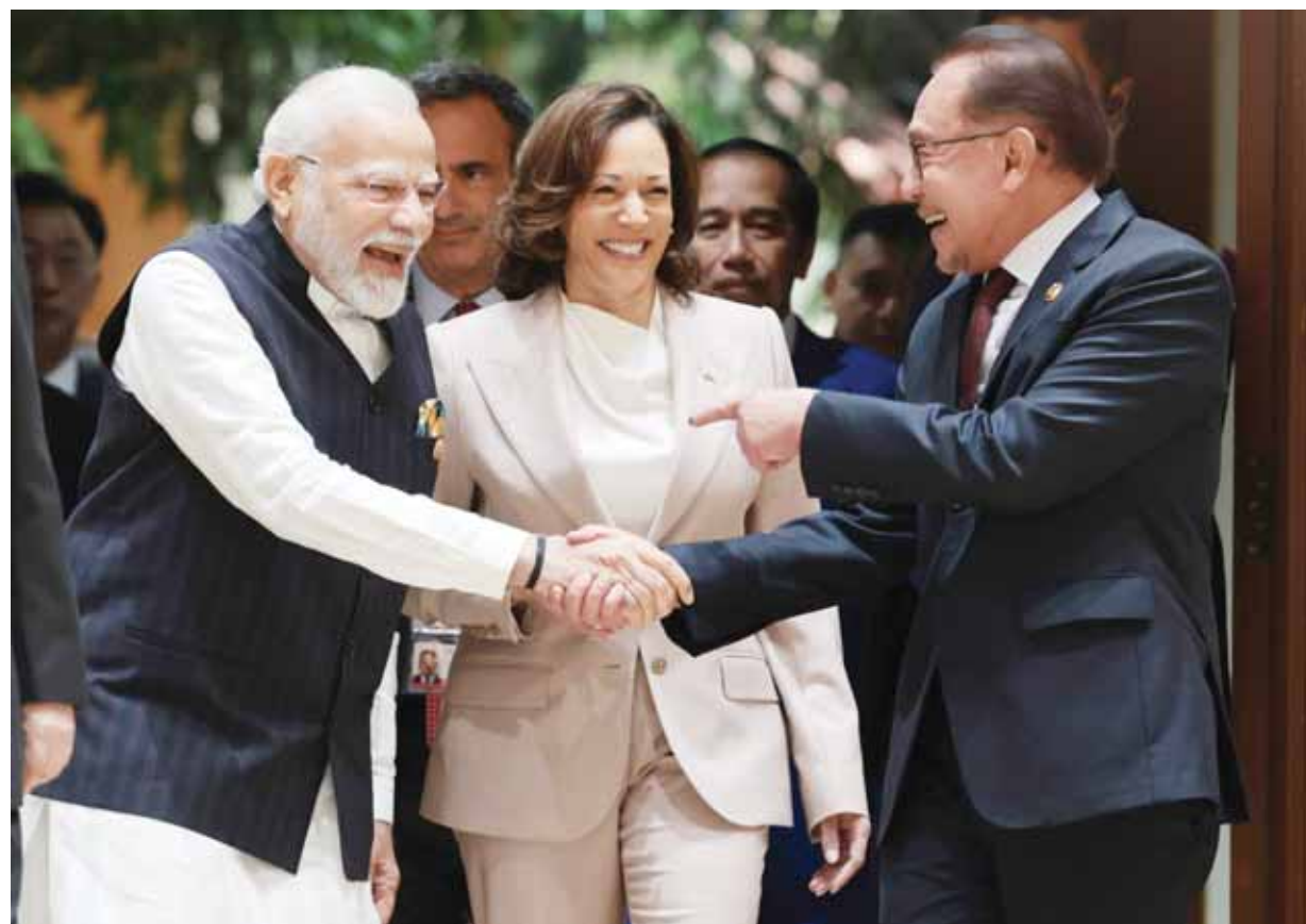
Prime Minister Narendra Modi shakes hands with Malaysian Prime Minister Anwar Ibrahim as US Vice President Kamala Harris looks on, on the sidelines of the 20th ASEAN-India Summit, in Jakarta, on Thursday

In his opening remarks, Modi said: "ASEAN matters because here everyone's voice is heard, and ASEAN is the epicentre of growth because the ASEAN region plays a crucial role in global development."