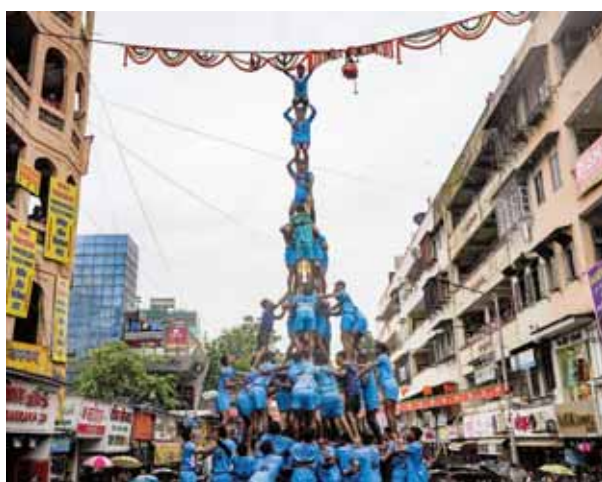
A devotee climbs atop a pyramid formed by fellow devotees to break 'Dahi Handi' during the Krishna Janmashtami festival, in Mumbai, on Thursday

While 77 people were injured during "human pyramid" formations done as part of the "dahi-handi" celebrations in various parts of Mumbai, 11 people were injured in similar mishaps in Thane. Of the 77 injured, 18 persons were treated and allowed to go, while the remaining injured persons are