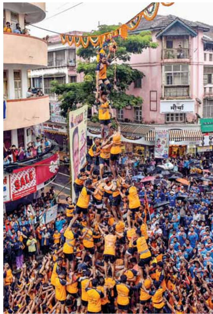
Govindas take part in 'Dahi Handi' celebrations on the occasion of Janmashanti, in Mumbai on Thursday

Biden and other US delegates will stay at ITC Maurya Sheraton hotel. The staff will undergo background checks, and special access cards will be given to those who will visit the 14th floor, where Joe Biden will stay. The special lift will be installed to reach the floor. About 400 rooms of this hotel have been booked.