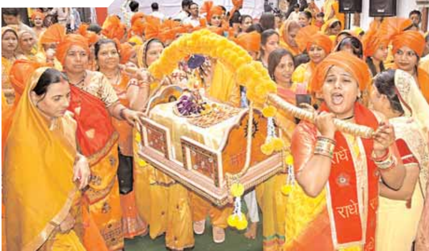
Devotees take part in a 'palki yatra' to celebrate the Janmashtami festival, in Bhopal