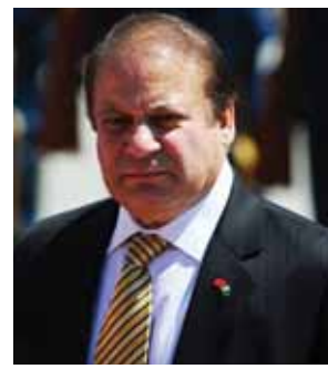
■ ISLAMABAD

Ending his over four years of self-imposed exile in the UK, former prime minister Nawaz Sharif is likely to return to Pakistan next month, according to a media report on Saturday.