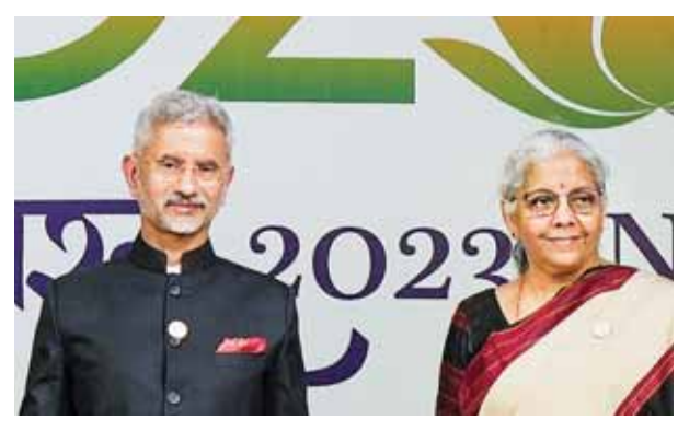
External Affairs Minister S Jaishankar and Union Finance Minister Nirmala Sitharaman during a Press conference at the G20 Summit, in New Delhi on Saturday

PTI ■ NEW DELHI The G20 has contributed to making "India world-ready and the world India-ready," External Affairs Minister S Jaishankar said on Saturday as he underlined that India's presidency of the grouping prioritised addressing urgent concerns of the Global South. Addressing a press briefing on the G20 Summit outcomes, he also said that while noting that G20 is not the platform to resolve geopolitical and security issues, the leaders recognised that they can have significant consequences for the global economy. "In particular they dwell on the ongoing war in Ukraine and the impact it has had especially on developing and least developing nations still recovering from