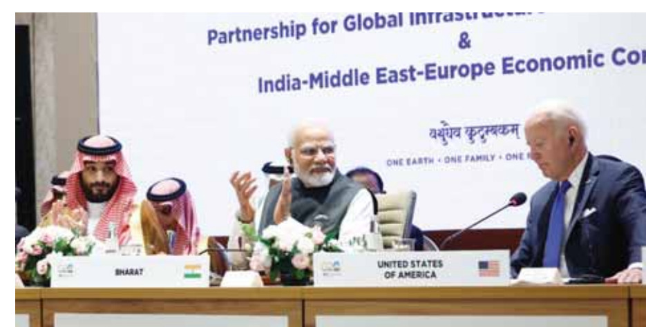
Saudi Arabian Crown Prince Mohammed bin Salman Al Saud, left, Indian Prime Minister Narendra Modi, center, and US President Joe Biden attend Partnership for Global Infrastructure and Investment event on the day of the G20 summit in New Delhi

PIONEER NEWS SERVICE ■ NEW DELHI The G20 on Saturday said today's era is not of war in the context of the ongoing Ukraine and stressed in the New Delhi Leaders' Declaration the use or threat of use of nuclear weapons is inadmissible. The Declaration was adopted with unanimous consensus after India changed the text on Ukraine. There have been several rounds of negotiation without any consensus on the text on Ukraine. India on Saturday shared a new text on the Ukraine crisis for the joint statement. "Friends, we have just got good news. With the hard work of our teams, and with the cooperation of you all, there is consensus on the New Delhi G20 Summit Leaders' Declaration," Modi said in a brief televised statement during the second session of the summit, speaking in Hindi. "Concerning the war in Ukraine, while recalling the discussion in Bali, we reiterated