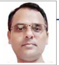
SWARN KUMAR ANAND

Prime Minister Narendra Modi's deft leadership at the G20 summit underscores India's growing global influence. This article delves into key diplomatic moves, from Bangladesh to Ukraine, highlighting India's ascension as a unifying force. Despite geopolitical tensions, India's stance strengthens its position on the world stage.