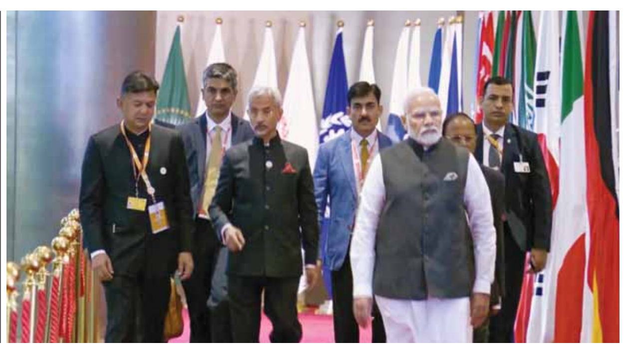
Prime Minister Narendra Modi arrives at the Bharat Mandapam for the G20 Summit, in New Delhi on Saturday