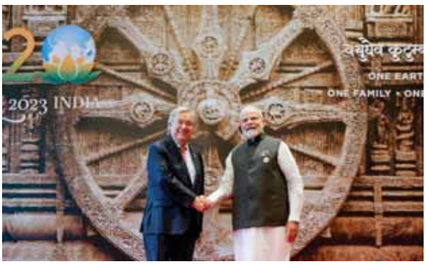
Prime Minister Narendra Modi and a foreign leader shake hands in front of the Konark Wheel replica at the Bharat Mandapam.

Modi welcomed heads of state and other leaders amid melodious strains of shehnai as flags of G20 member countries, invited nations and several international organisations fluttered in the pleasant morning breeze. The 'Konark Wheel' went viral on social media platforms. Union Minister Dharmendra Pradhan shared his delight on X (formerly Twitter) on "Odisha's timeless wonder".