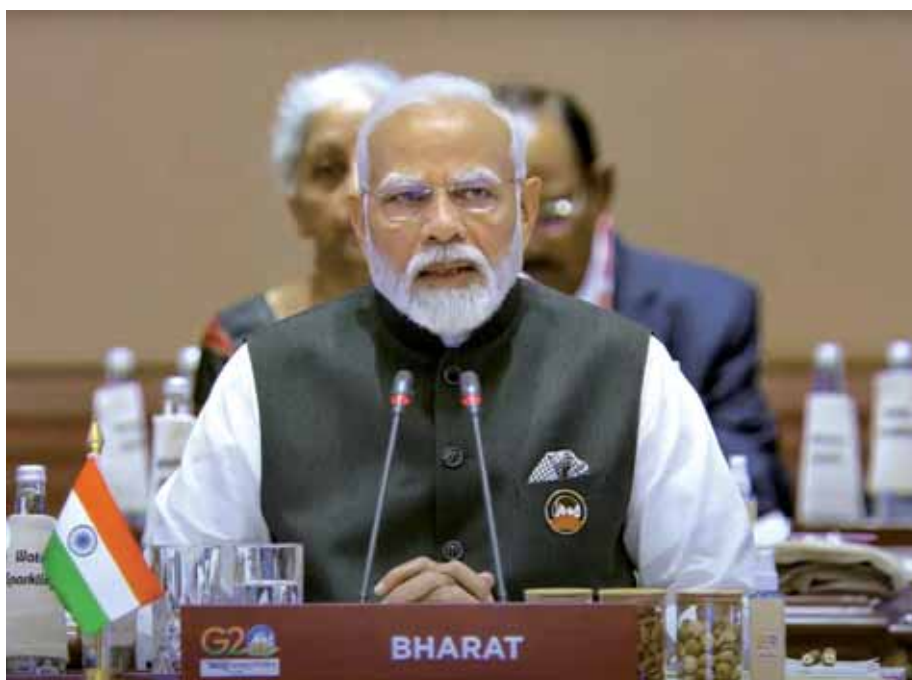
Prime Minister Narendra Modi addresses the G20 Summit at the Bharat Mandapam convention centre in New Delhi on Saturday

for India as head of the G20, Modi announced the adoption of the New Delhi Leaders Declaration. It came amid increasing tensions and divergent views over the Ukraine conflict. The announcement about the consensus on the declaration and its subsequent adoption came hours after India circulated a new text to the G20 countries to describe the Ukraine conflict. "Friends, we have just got good news, with the hard work of our teams, and with the cooperation of you all, there is consensus on the New Delhi G20 Summit Leaders Declaration," Modi told the leaders at the summit. "I announce that this declaration is adopted (Banged the gavel thrice)," he announced. Modi also flagged concern over prevailing distrust in the world in the backdrop of the ongoing Ukraine conflict and urged the leaders to turn the global trust deficit into confi-