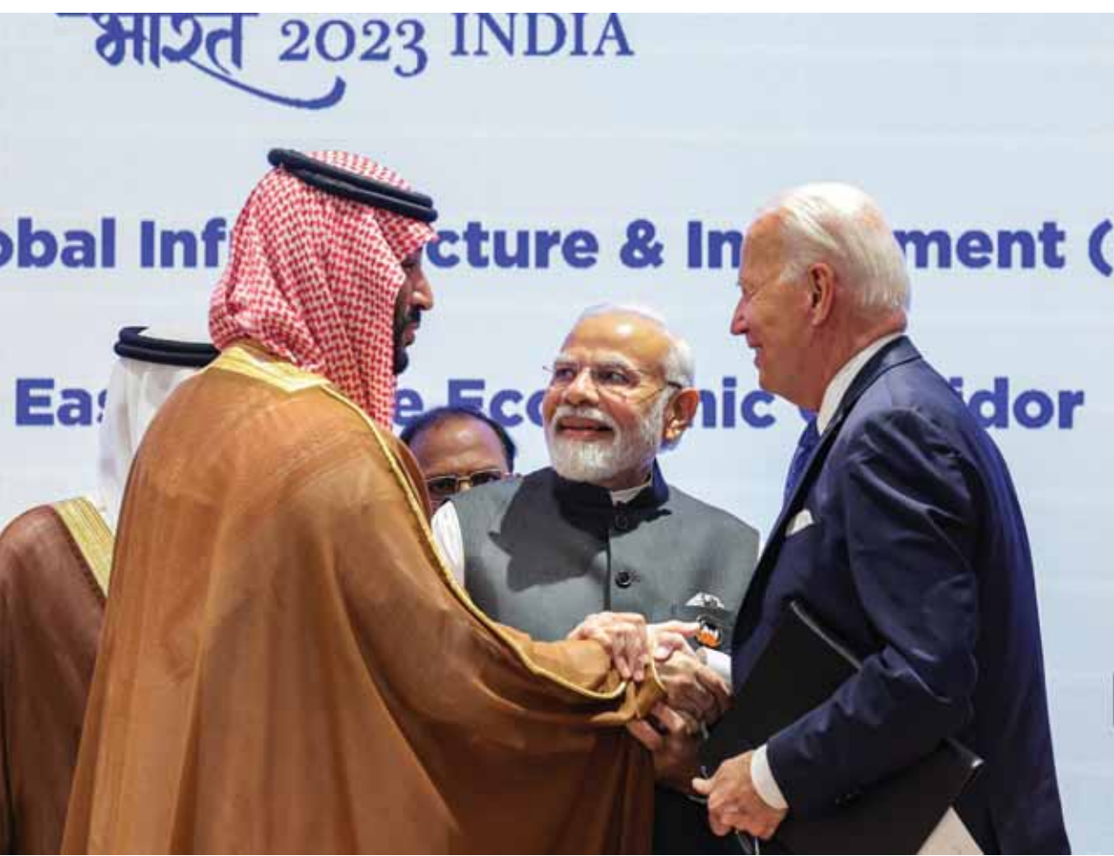
Prime Minister Narendra Modi with US President Joe Biden and Crown Prince and Prime Minister of Saudi Arabia Mohammed bin Salman bin Abdulaziz Al Saud during the G20 Summit in New Delhi on Saturday

developing nations, especially the African continent. The Prime Minister was leading from the front on the issue of the African Union's membership of the G20. In June, Modi wrote to G20 leaders to pitch for according to the African Union full membership of the grouping at its New Delhi summit. Weeks later, the proposal was formally included in the draft communique for the summit during the third G20 Sherpas meeting in Hampi, Karnataka, in July. As G20 president, India has been focusing on issues like inclusive growth, digital innovation, climate resilience, and equitable global health access with an aim to benefit the Global South or the developing countries. In January, India hosted the Voice of the Global South Summit with an aim to highlight the problems and challenges facing the developing countries. Continued on Page 2