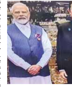
Jagdeep Dhankhar with his wife Sudesh Dhankhar, former President Ram Nath Kovind, and former Vice President M Venkaiah Naidu too joined the dinner party.

his wife Yoko Kishida, who was dressed in a saree, Chinese Prime Minister Li Qiang, Australian Prime Minister Anthony Albanese along with his spouse and Mauritius PM Pravind Kumar Jugnauth and his wife, were among other dignitaries welcomed by President Murmu and Modi. Singapore Prime Minister Lee Hsien Loong, Indonesian President Joko Widodo and his wife, Italian Prime Minister Giorgia Meloni, Russian Foreign Minister Sergey Lavrov were also greeted by Murmu and Modi. The Prime Minister was also seen explaining to some of the G20 leaders, including US President Biden, UK Prime Minister Rishi Sunak, French President Emmanuel Macron and Australian PM Albanese, about the importance of the university. Besides Vice President