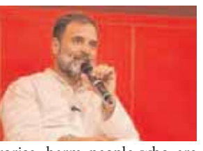
Rahul Gandhi on Sunday hit out at the BJP during an interaction with students and academics in Paris, saying that the governing party is out to get power at any cost and that there is "nothing Hindu" about their actions.

Congress leader Rahul Gandhi has hit out at the BJP during an interaction with students and academics in Paris, saying that the governing party is out to get power at any cost and that there is "nothing Hindu" about their actions. During the interaction at the Sciences PO University in Paris, a leading social sciences institution in France, the 53-year-old Opposition leader covered a broad range of topics such as his 'Bharat Jodo Yatra', the Opposition alliance's fight to defend India's democratic structures, changing global order and other key issues. He stressed that the Opposition was committed to fighting for the "soul of India" and the country would "come out just fine" from the current "turbulence". "I've read the 'Gita', I've read a number of the Upanishads, I've read many Hindu books; there is nothing Hindu about what the BJP does, absolutely nothing," said Rahul Gandhi, in response to a question about the rise of "Hindu nationalism" in the country at the interaction, a video of which was released on Sunday. "I have not read anywhere, in no Hindu book, from no learned Hindu person have I ever heard that you should ter-