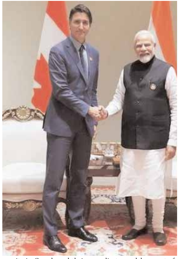
Prime Minister Narendra Modi and Canadian Prime Minister Justin Trudeau shake hands during the G20 Summit in New Delhi on Sunday.

Prime Minister Narendra Modi on Sunday conveyed to his Canadian counterpart Justin Trudeau India's strong concerns about the continuing anti-India activities of extremist elements in Canada that were promoting secessionism, inciting violence against its diplomats and threatening the Indian community there. In his talks with Trudeau on the sidelines of the G20 Summit, Modi also mentioned that a relationship based on "mutual respect and trust" is essential for the progress of the India-Canada relationship, the Ministry of External Affairs (MEA) said. "The Prime Minister highlighted that India-Canada relations are anchored in shared democratic values, respect for rule of law and strong people-to-people ties," it said. "He conveyed our strong concerns about continuing anti-India activities of extremist elements in Canada. They are promoting secessionism and inciting violence against Indian diplomats, damaging diplomatic premises, and threatening the Indian community in Canada and their places of worship," it said. The nexus of such forces with organised crime, drug syndicates and human trafficking should be a concern for Canada as well. It is essential for the two countries to