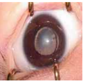
The team, which included a researcher at the Indian Institute of Technology in New Delhi, found that the patients were able to distinguish pictures of faces from non-face stimuli.

Surgery done at various stages of adolescence can aid sight recovery in children born with dense bilateral cataracts. The operation alters the brain's specific visual pathways, allowing patients to discriminate between pictures and recognise faces. The sensitive period for visual development closes around 5 to 7 years, so the conventional wisdom has been that surgery during adolescence can only offer limited benefits for congenital cataracts. To investigate this, scientists followed 19 cataract patients aged 7 to 16 who received surgery. They found that surgery improved early parts of the visual system. The majority of this improvement occurred in the first few days after surgery.