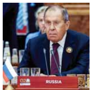
Russian Foreign Minister Sergey Lavrov on Sunday thanked India saying New Delhi played an important role in "preventing the West" from taking forward their approach on many issues, including Ukraine.

Russia on Sunday said the G20 (now G21) Summit under India's presidency was a "breakthrough" conclave in many ways as its outcomes showed a path to the world to move forward on a range of challenges and demonstrated the strength and importance of the Global South. In a press briefing here, Russian Foreign Minister Sergey Lavrov thanked India saying New Delhi played an important role in "preventing the West" from taking forward their approach on many issues, including Ukraine. The summit declaration clearly sent across a message that military conflicts in the world must be resolved according to the UN Charter and that the Western powers will not be able to press ahead with their concepts of resolution of various crises. "It is a breakthrough summit in many ways. It provides us a way forward to move ahead in many issues," he added. The G20 Summit in New Delhi provided a direction towards fairness in global governance and global finance as well, Lavrov noted. "I want to express my gratitude to India for preventing attempts to politicise the G20," he said, adding the West will not be able to remain a "hegemony" as we see new centres of power coming up in the world.