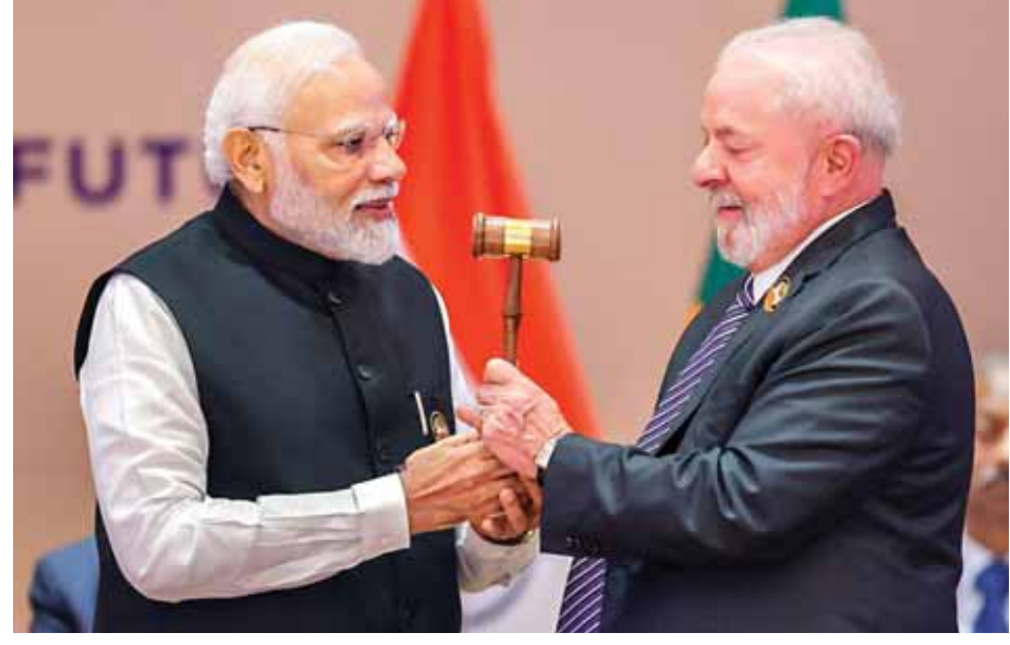
Prime Minister Narendra Modi hands over the G20 presidency to the President of Brazil, Luiz Inacio Lula da Silva at the closing session of the G20 Summit 2023 at the Bharat Mandapam, in New Delhi on Sunday.