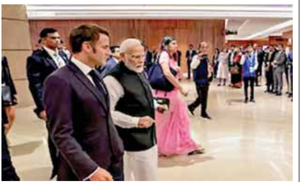
Prime Minister Narendra Modi and President Emmanuel Macron on Sunday reviewed the entire gamut of their bilateral ties during their talks in New Delhi.

India and France reviewed the entire gamut of their bilateral ties here on Sunday during talks between Prime Minister Narendra Modi and President Emmanuel Macron. The two leaders reiterated their unwavering commitment to collectively serve as a force of good, carrying the message of 'Vasudhaiva Kutumbakam' i.e. 'one earth, one family, one future', during tumultuous times reshaping the global order. A joint statement released after the lunch meeting between the two leaders on the sidelines of the G20 summit said Modi and Macron discussed, assessed and reviewed the progress in bilateral relations since their last meeting in July in Paris. They also exchanged views on important international and regional developments. President Macron's visit to India comes after the historic visit of Prime Minister Modi to Paris on July 13-14 as the Guest of Honour on the occasion of French National Day on 14 July 2023, commemorating the 25th anniversary of the India-France strategic partnership. Acknowledging the strength of India France partnership, founded in deep trust, shared values, belief in sovereignty and strategic autonomy, a resolute commitment to international law and principles enshrined in the UN Charter, an abiding faith in multilateralism and a mutual pursuit of