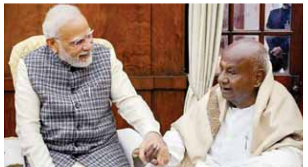
Prime Minister Narendra Modi on Sunday met former Karnataka Chief Minister H D Kumaraswamy to discuss seat-sharing for the upcoming Lok Sabha elections.

Seat-sharing for the Lok Sabha seats between the Janata Dal-Secular (JDS) and the BJP for the coming Lok Sabha seats will be decided after former Karnataka Chief Minister H D Kumaraswamy meets Prime Minister Narendra Modi at the national Capital. There is no decision on the number of seats to be shared by the two parties in Karnataka which has 28 Lok Sabha constituencies, sources said. JDS is expecting more than 4 Lok Sabha seats which it earlier reported to have been offered to it by the BJP. The third main political force in Karnataka after the ruling Congress and the main opposition the BJP, the JDS is seeking 6 Lok Sabha seats to contest in Karnataka, according to sources. In 2019 Lok Sabha poll