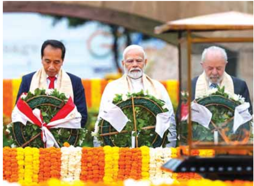
Prime Minister Narendra Modi and world leaders pay homage at Mahatma Gandhi's memorial Rajghat on the final day of the G20 Summit, in New Delhi, Sunday.