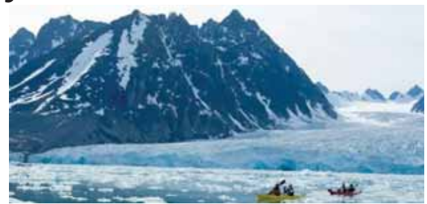
New research shows that even if the countries stick to goals set out in the Paris climate agreement, half the planet's glaciers will have melted by 2100.

Even if the countries stick to goals set out in the Paris climate agreement, half the planet's glaciers will have melted by 2100, according to new research that warns the scale and impacts of glacial loss are greater than previously thought. At least half of that loss will happen in the next 30 years, which means a rise in sea level, threatening the supply of water of up to 2 billion people, and increasing the risk of natural hazards such as flooding. For example, in India and China, the Himalayan glaciers are crucial for many important rivers and the vanishing of glaciers will bring a serious livelihood crisis to billions of people. Researchers found 49 per cent of glaciers would disappear under the most optimistic scenario of 1.5C of warming. However, if global heating