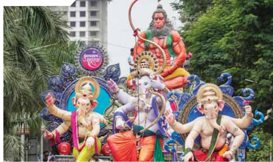
Idols of Lord Ganesha being carried ahead of the Hindu festival of 'Ganesh Chaturthi', in Mumbai