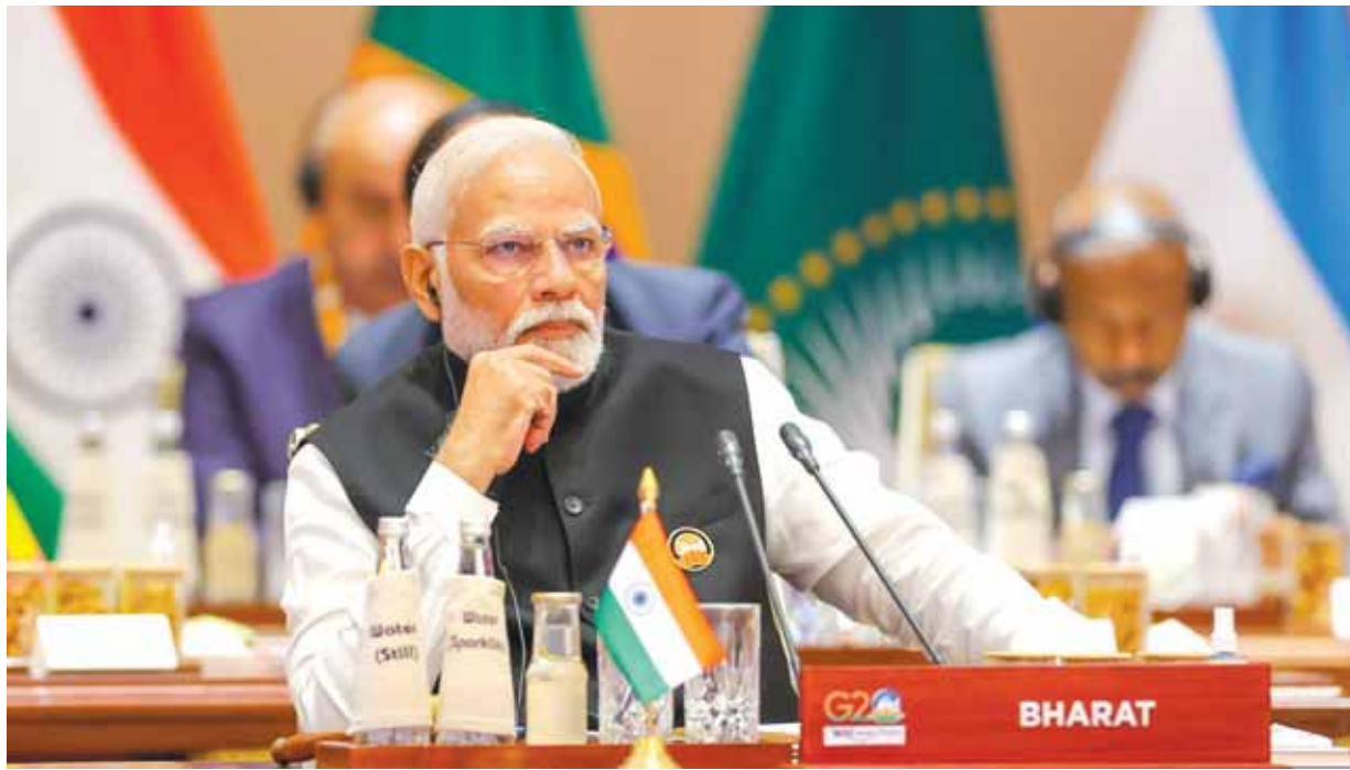
Prime Minister Narendra Modi during the 'One Future' session on the final day of the G20 Summit 2023 at the Bharat Mandapam, in New Delhi, Sunday

Earlier in the day, the Prime Minister received the G20 leaders and delegation heads at New Delhi's Rajghat. They paid floral tributes to Mahatma Gandhi, followed by a tree-plantation ceremony at the G20 venue, Bharat Mandapam. Addressing global leaders during the 'One Future' session of the G20 Summit, Modi noted that sustainability and stability were as important as transformation to keep pace with a fast-changing world. In this context, he urged the leaders to resolve to implement a Green Development Pact, Action Plan on Sustainable Development Goals, high-level principles on anti-corruption, digital infrastructure and Multilateral Development Bank (MDB) reforms. Modi made a fresh push for reforms in global bodies including the UN, saying despite the increase in member states of the world body, the number of permanent members in the UN Security Council (UNSC) has remained the same. He said the world's "new realities" should be reflected in the "new global structure." The world was different when the UN was founded with 51 members. Now the number of member states has risen to nearly