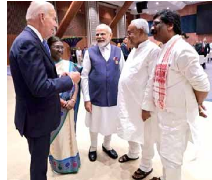
(Left to Right) US President Joe Biden talks to President Murmu, Prime Minister Narendra Modi, Bihar Chief Minister Nitish Kumar and Jharkhand Chief Minister Hemant Soren during the G20 Summit in New Delhi. Prime Minister Narendra Modi and world leaders pay homage at Mahatma Gandhi's memorial Rajghat on the final day of the G20 Summit, in New Delhi, Sunday.