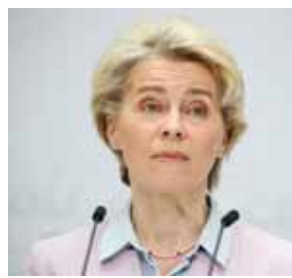
European Commission President Ursula von der Leyen on Sunday said Europe and its partners should develop a new global framework for artificial intelligence risks to avert systemic societal risks and foster investments in safe and responsible AI systems.

European Commission President Ursula von der Leyen on Sunday said Europe and its partners should develop a new global framework for artificial intelligence risks to avert systemic societal risks and foster investments in safe and responsible AI systems. Addressing the "One Future" session of the G20 Summit here, the European Commission President asserted that one thing seems clear that the future will be digital. "Today, I want to focus on AI and digital infrastructure. As it has been described, AI has risks but also offers tremendous opportunities. The crucial question is how to harness a rapidly changing technology," she highlighted. It is telling that even the makers and inventors of AI are calling on political leaders to regulate it, she added. "In the EU, in 2020, we presented the first ever law on artificial intelligence. We want to facilitate innovation while building trust. But we need more. What the world does now will shape our future. I believe that Europe — and its partners — should develop a new global framework for AI risks," von der Leyen said. "It should protect us against systemic societal risks and foster investments in safe