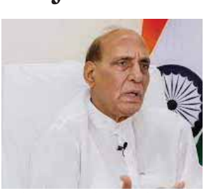
Defence Minister Rajnath Singh on Sunday lauded Prime Minister Narendra Modi's vision and said he successfully demonstrated "Bharat's prowess as both a Vishwa Guru and Vishwa Bandhu".

Lauding Prime Minister Narendra Modi's vision, Defence Minister Rajnath Singh on Sunday said India's G20 presidency has left an "indelible mark" on the world stage, and the consensus reached on the declaration marks a historic milestone in bridging the global trust deficit. He praised the Prime Minister's vision, and said he successfully demonstrated "Bharat's prowess as both a Vishwa Guru and Vishwa Bandhu". "The historic G20 Summit in New Delhi marks a historic milestone in bridging the global trust deficit and cultivating global trust and confidence," he said. The defence minister said the G20 Declaration, encompassing a consensus statement on the Ukraine war and other actionable tasks, demonstrates