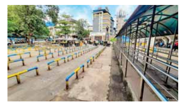
A deserted auto rickshaw stand outside Thane railway station during a 'bandh' called by Sakal Maratha Morcha to condemn the police action at a recent protest in Jalna over Maratha reservation in Thane on Monday