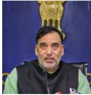
Delhi Environment Minister Gopal Rai addresses a Press conference on the ban on manufacturing and sale of firecrackers, in New Delhi on Monday

"The manufacturing, storage, sale, online delivery, and bursting of any type of firecrackers are completely prohibited in Delhi. The police in Delhi-NCR have been instructed to issue a circular on behalf