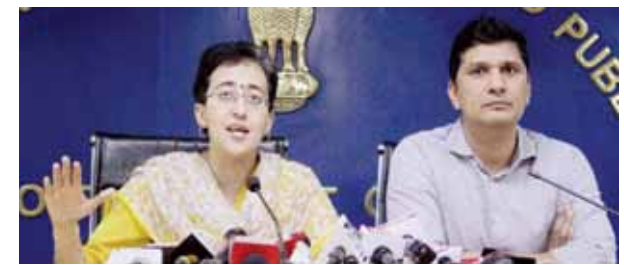
Delhi Ministers Atishi Singh and Saurabh Bharadwaj address a press conference, in New Delhi on Monday

"During the preparations for G20, many roads across the city were redesigned and beautified, landscaping was done in the city, and lights and fountains were installed at various spots. The key areas of Delhi were decorated, well-main-