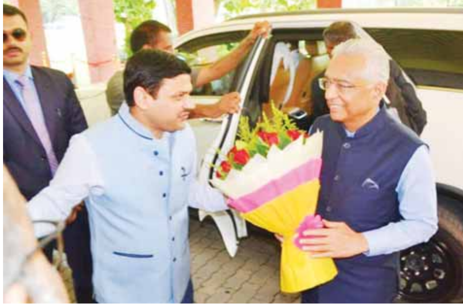
Mauritius PM Pravind Jugnauth being welcomed at a hotel by DC KR Sharma in Varanasi on Monday.

In view of the visit of Mauritius PM, elaborate security arrangements were made at all the places he was scheduled to visit during the day.