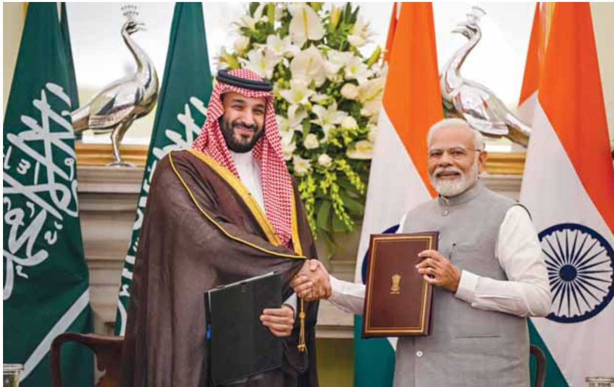
Prime Minister Narendra Modi and Saudi Arabia's Crown Prince and Prime Minister Mohammed bin Salman bin Abdulaziz Al Saud during signing of minutes of the first meeting of India-Saudi Arabia Strategic Partnership Council at the Hyderabad House in New Delhi on Monday

The leaders assessed the progress of the two Ministerial committees of the Strategic Partnership Council, namely the "Political, Security, Social