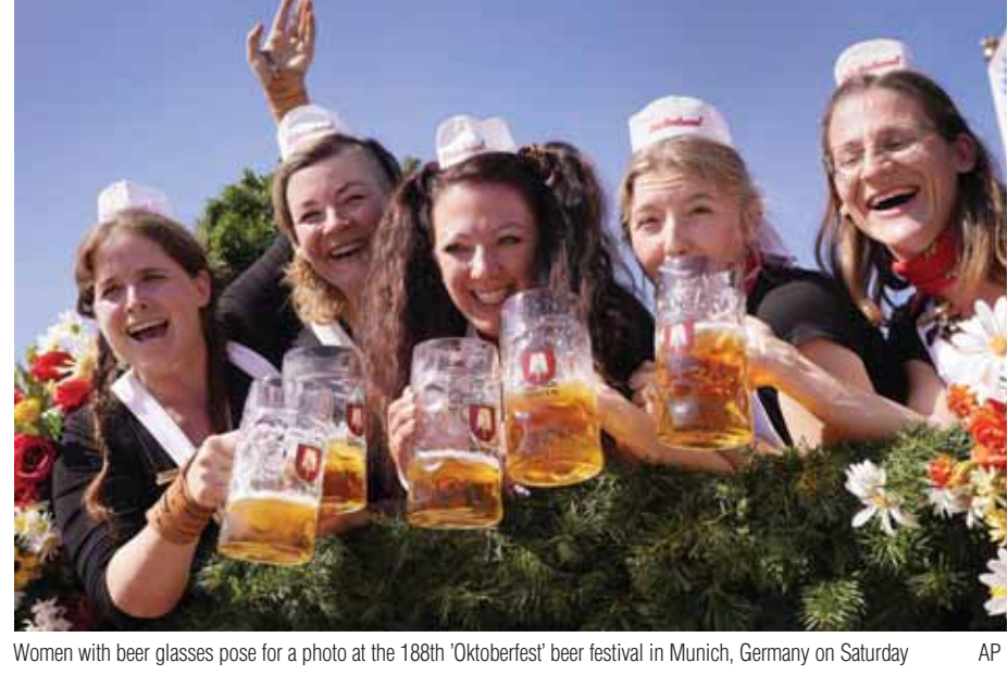
Women with beer glasses pose for a photo at the 188th 'Oktoberfest' beer festival in Munich, Germany on Saturday