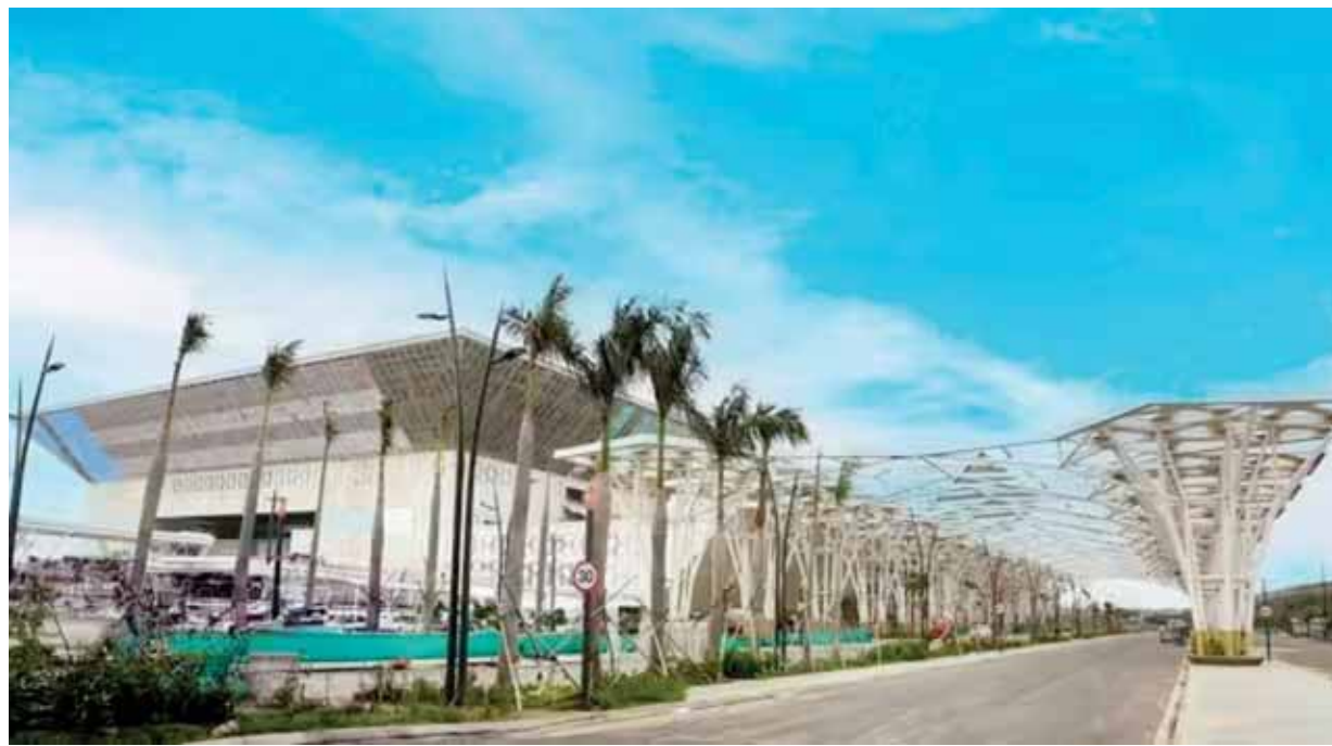
Modi will inaugurate Phase 1 of the India International Convention and Expo Centre (IICC), known as Yashobhoomi, in Dwarka on Saturday

Yashobhoomi also houses one of the largest exhibition halls in the world, it said. The exhibition halls, built across over 107,000 square metres, will be utilised for hosting exhibitions, trade fairs, and business events, and are con-