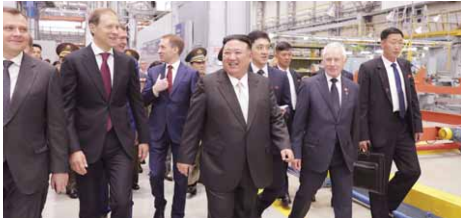
In this photo provided by the North Korean government, North Korean leader Kim Jong Un, centre, visits a Russian aircraft plant that builds fighter jets in Komsomolsk-on-Amur, about 6,200 kilometers (3,900 miles) east of Moscow, Russia on Friday.

AP ■ SEOUL North Korean leader Kim Jong Un inspected Russia's nuclear-capable bombers, hypersonic missiles and an advanced warship from its Pacific fleet on Saturday as he continued a trip in Russia's Far East that has sparked Western concerns about an arms alliance that could fuel Russian President Vladimir Putin's war on Ukraine. After arriving in the city of Artyom by train, Kim travelled to an airport just outside the port city of Vladivostok where Russian Defence Minister Sergei Shoigu and other senior military officials gave him an up-close look at Russia's strategic bombers and other warplanes. All the Russian warplanes shown to Kim on Saturday were among the types that