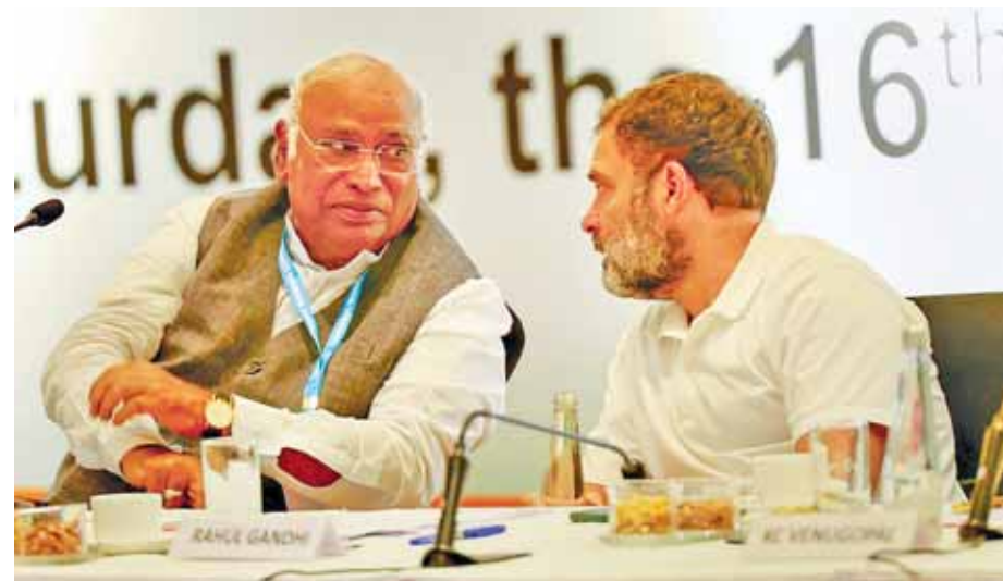
Congress president Mallikarjun Kharge with party leader Rahul Gandhi during Congress Working Committee Meeting in Hyderabad on Saturday

The first meeting of the Mallikarjun Kharge-led Congress Working Committee (CWC) on Saturday focused more on the prospects of the newly formed coalition of Opposition parties called "INDIA". In his opening remarks at the newly constituted CWC, Kharge said that 27 INDIA bloc parties stand together on fundamental issues of importance. After three "successful" meetings, the Opposition alliance is moving forward to combat the "anti-people and anti-democratic BJP Government". Kharge alleged the BJP is resorting to vindictive action against Opposition parties in response to this development within the INDIA bloc. In attendance at the meeting were Kharge, former party chiefs Sonia Gandhi and Rahul Gandhi, Priyanka Gandhi Vadra, Rajasthan Chief Minister Ashok Gehlot, Chhattisgarh CM Bhupesh Baghel, Himachal Pradesh CM Sukhvinder Singh Sukhu, Karnataka CM Siddaramaiah, and general secretaries KC