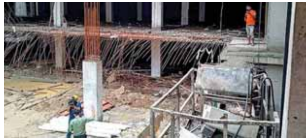
the incident on Friday.

The long-stalled project is being completed by the state-run NBCC under the monitoring of the Supreme Court. "Four workers had died after